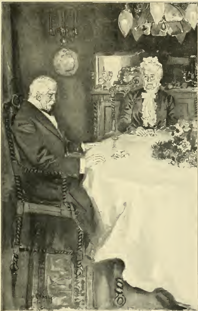
"LADY HENRY LISTENED EAGERLY"