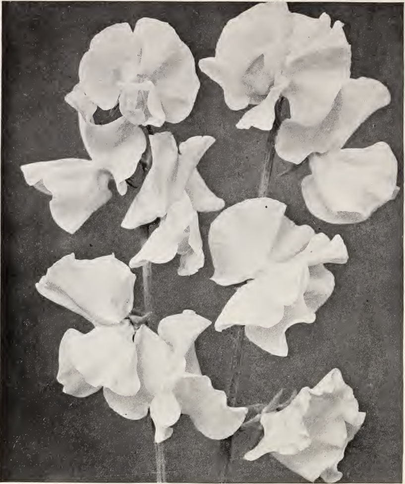
SWEET PEA—DAISY MOTTE. (see p. 23)