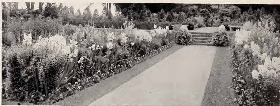
A STRIKING ARRANGEMENT OF LILIES AND PERENNIALS.