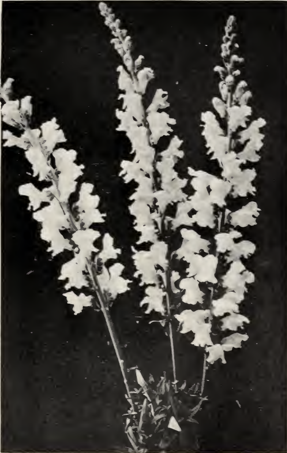
ANTIRRHINUM, HUNT'S "GENEVA PINK"