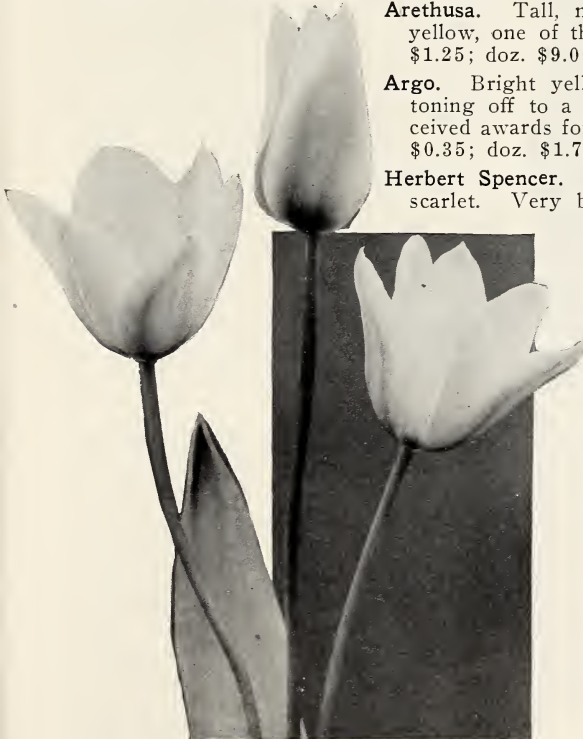
NEW COTTAGE TULIP "LEDA"

Vesta. Cup-shaped bloom of purest white, with black stamens. Tall strong stem. Excellent forcing Tulip. Each $0.25; doz. $1.50; 100 $9.00.