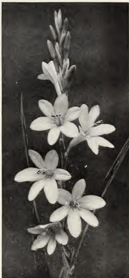
The Graceful Snow-White Watsonia

in appearance nor is there any that can approach it in beauty. It is easy to grow, prefers "cool" slow forcing, but if bulbs are potted early they will bloom in February and March and you'll want more of it the following year. A beauty for cut decorative use.