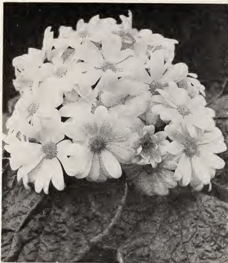
Cineraria, Hunt's "Perfection"