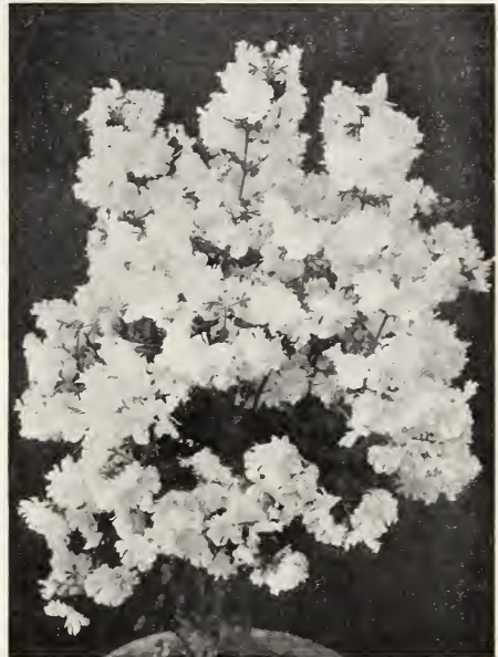
A Specimen Plant of Hunt's Selected Hybrid Schizanthus