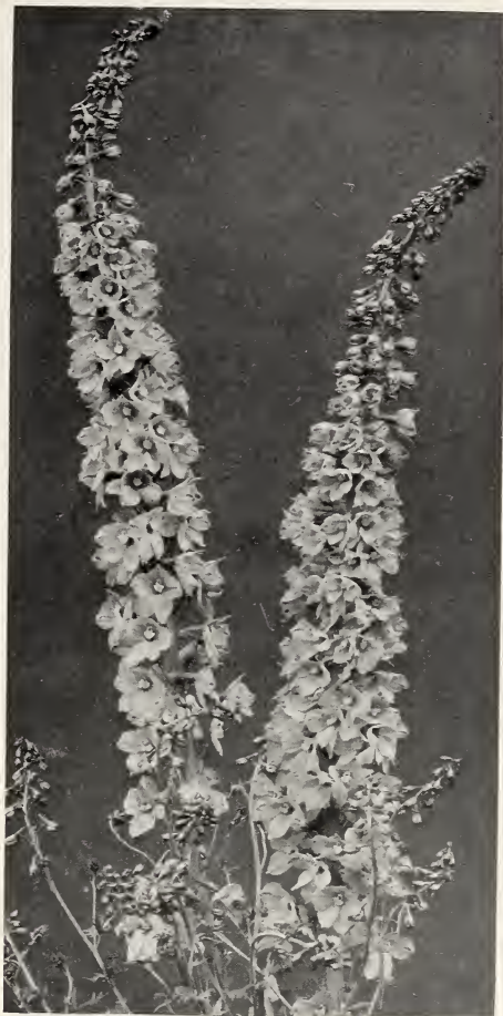
The True "Wrexham" Delphinium

Lanceolata. Lighter in color than the preceding. ¼ oz. 60c; pkt. 25c. Plants $3 doz.