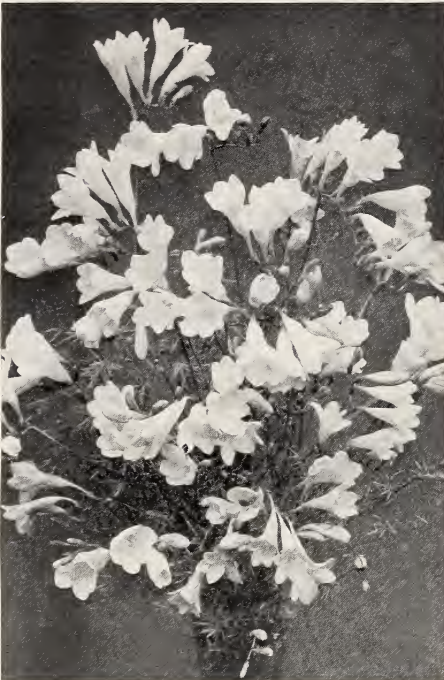
FREESIA "MRS. MARC PETERS"

New crop bulbs will be ready in July and if potted at once, can be bloomed early for Christmas.