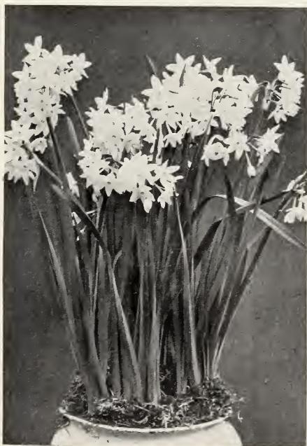
NARCISSUS, PAPER WHITE GRANDIFLORA

Mammoth Bulbs, Per doz. $3.00; per 100 $19.00.