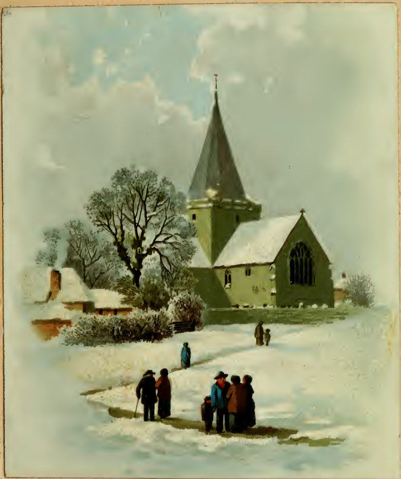
MOTHER AND SON.