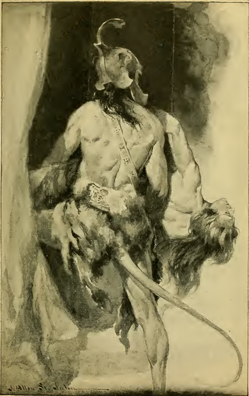
Mo-sar sprang forward, and seizing Jane about the waist, carried her off struggling and fighting fiercely