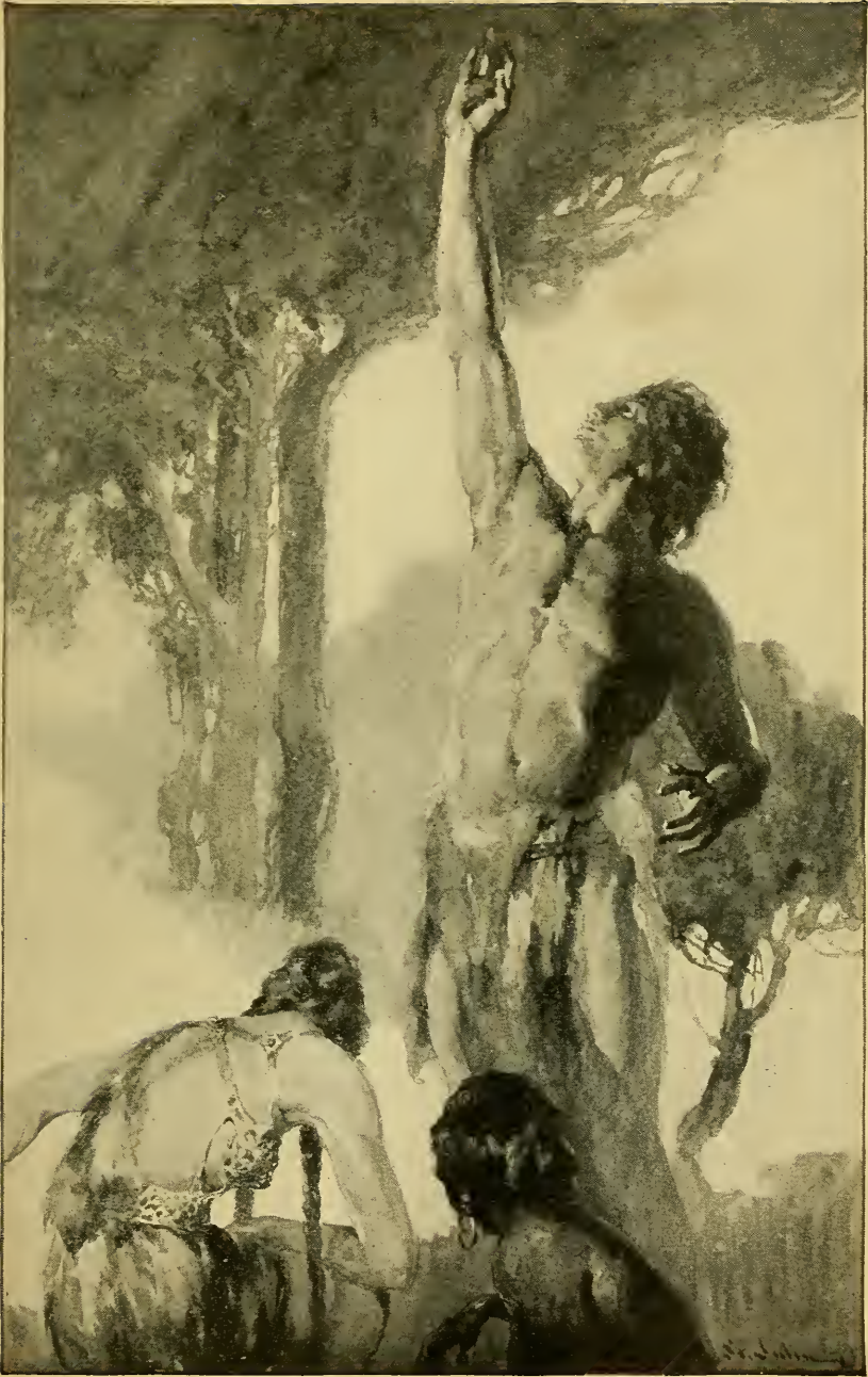
The two women dropped to their knees, stricken with awe at the thought of the awful nearness of the Great God