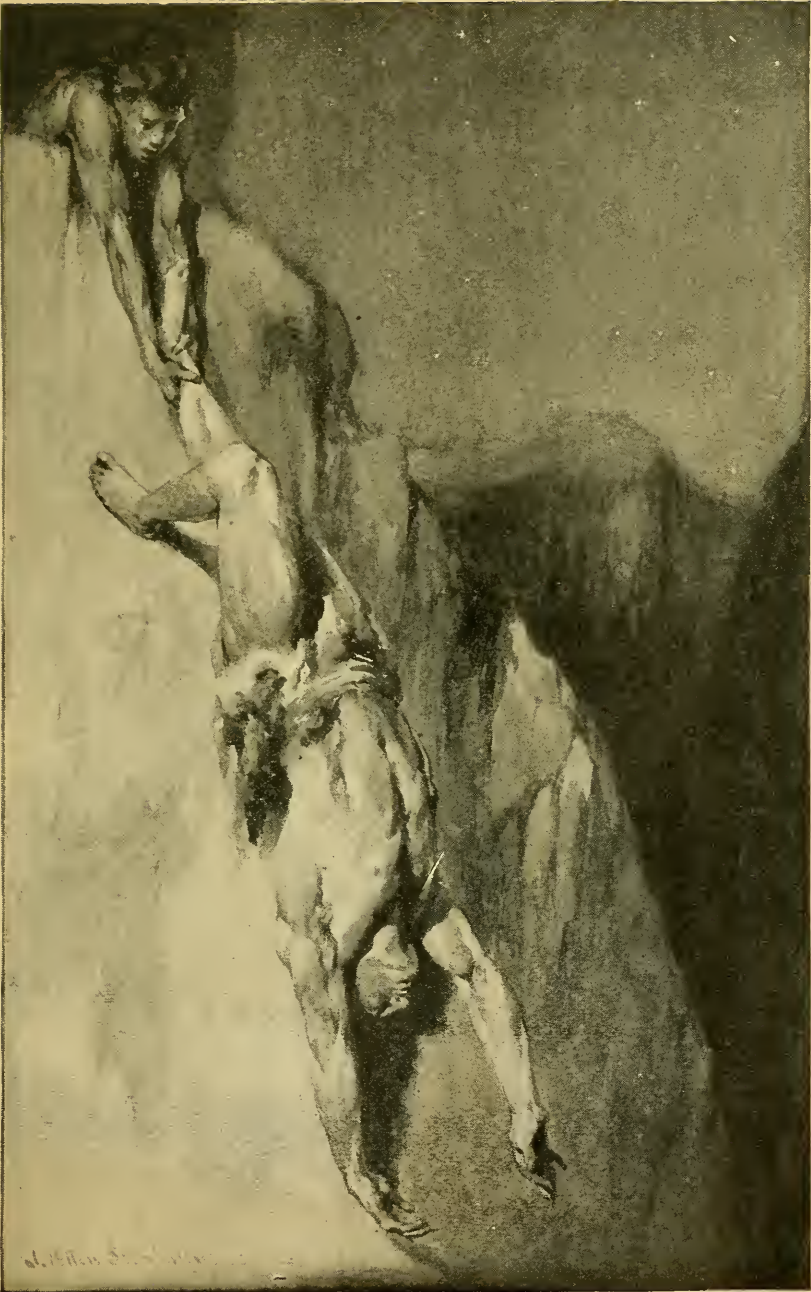
She felt her fingers numbing slowly to the strain upon them