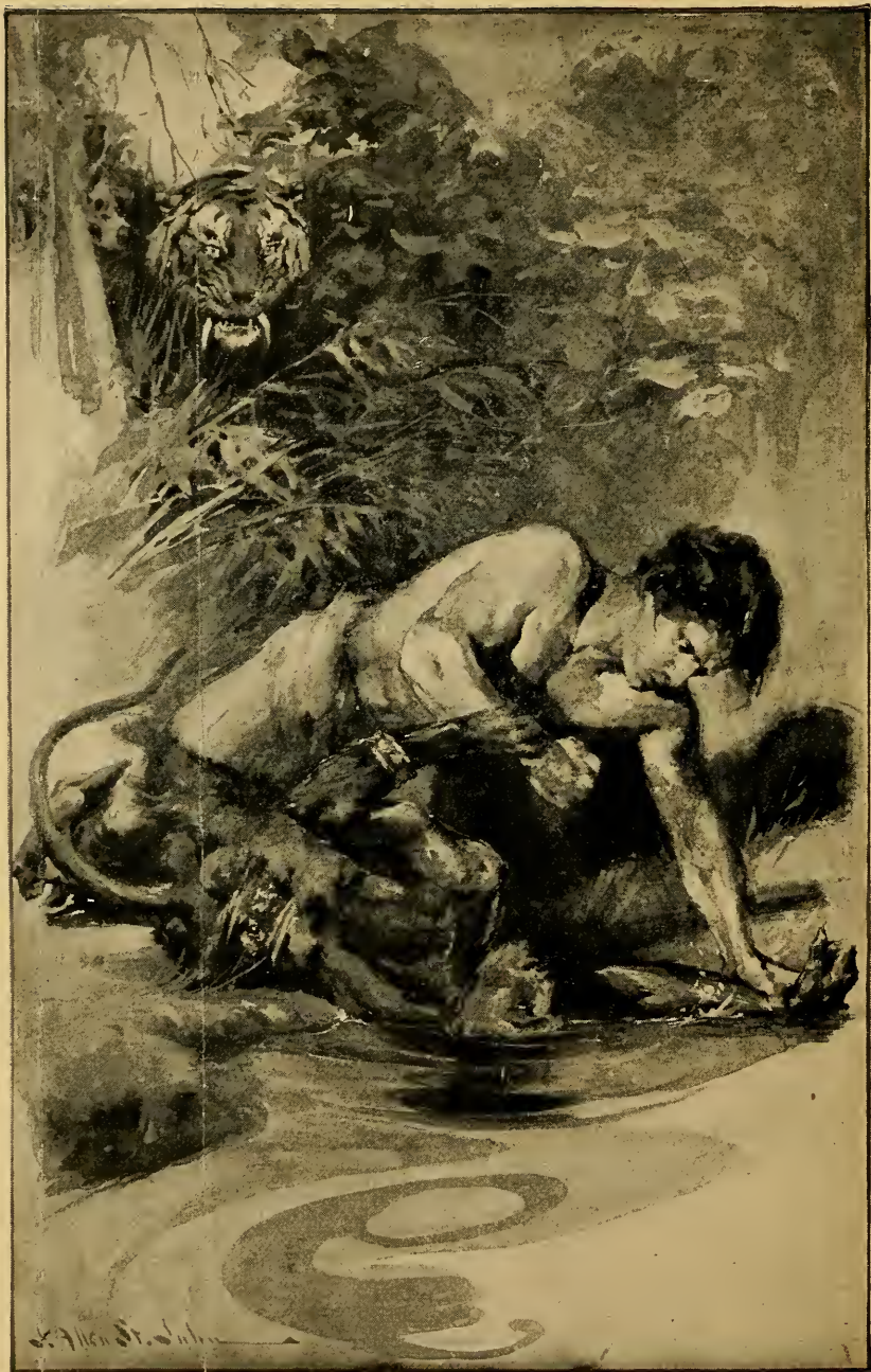
As the two antagonists battled, a devil-faced saber-tooth peered menacingly from the jungle