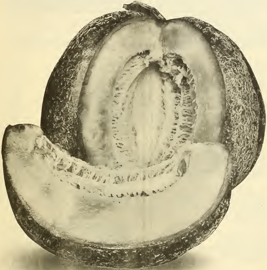
MELON, FARQUHAR'S HONEYDROP