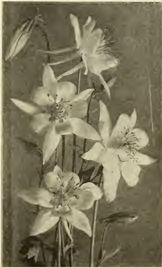
Aquilegia. Farquhar's Long-Spurred Hybrids.