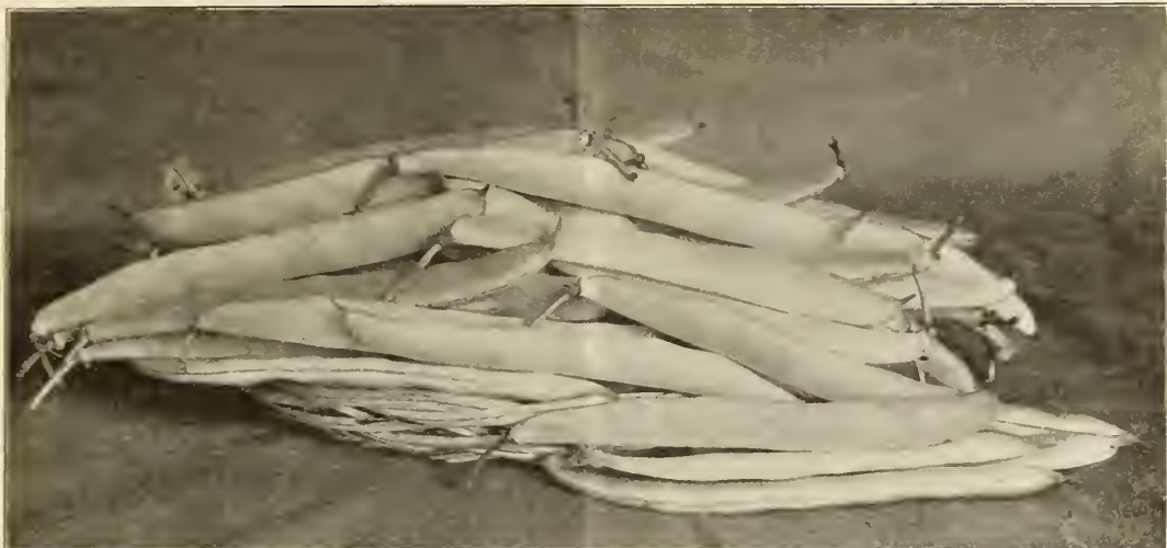
BEAN—Farquhar's Rustless Golden Wax.