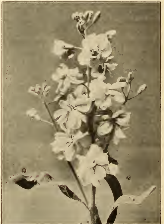
STOCK, Beauty of Nice.

PETUNIA Giant Single Varieties. Farquhar's Ruffled Giants, Mixed. A California strain producing large flowers with the edges deeply ruffled or fluted. 1/2 oz. $ 2.00 Farquhar's Snowstorm. White, fringed flowers, single. 500 seeds. $ .50 Farquhar's Ruffled Pink. Single. 500 seeds. $ .50 Farquhar's Giants of California, Mixed. Enormous flowers in great variety. 1/8 oz. $ 2.00 Giant Crimson. 500 seeds. . . . . .50 Giant Pink. 500 seeds. . . . . .50 Giant White. 500 seeds. . . . . .50 Giant Striped and Blotched. 500 seeds. . . . . .75 Yellow-Throated Varieties, Mixed. 500 seeds. . . . . $ .75