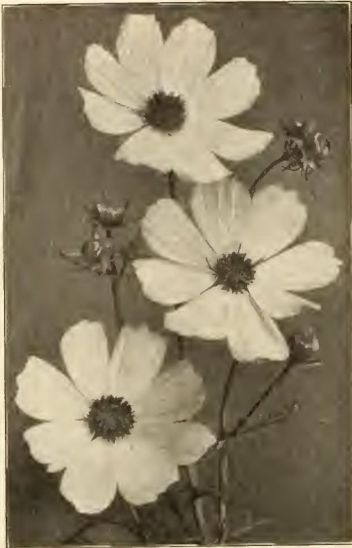
COSMOS, Midsummer Giants.