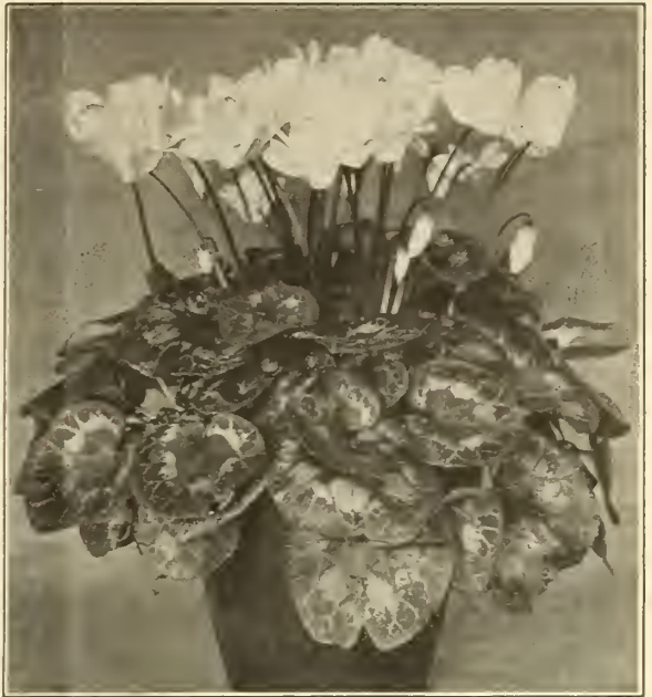
CYCLAMEN, Farquhar's Giant.

Farquhar's Dark Blue. Very compact; ¼ oz. ¼ oz. Oz. the best for carpet beds. $ .85 $1.50 Crystal Palace Compacta. Dark blue. .85 1.50 Farquhar's Azure Blue. .60 1.00 Gracilis. Light blue. .40 Speciosa. Dark blue; trailing. .35 .60 1.25