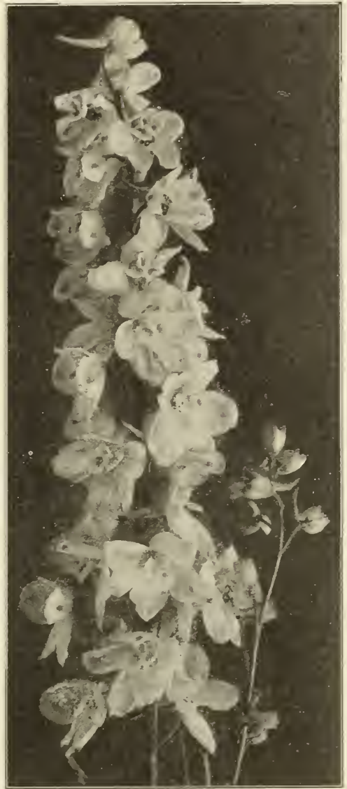
Delphinium. Farquhar's Hybrids.