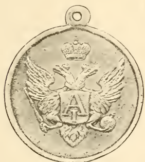
Monogram of Alexander I.

NOTE.—The third medal mentioned in the deposition is similar to the smaller one reproduced. The originals will be produced before the Tribunal.