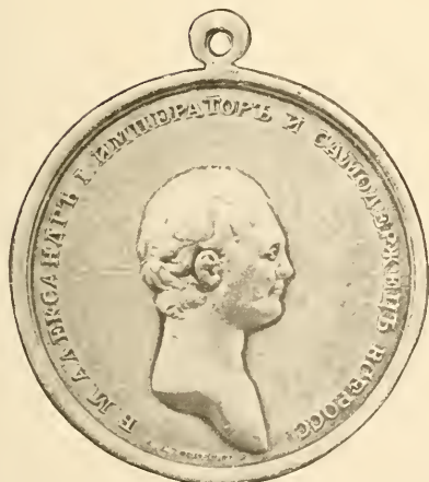
Translation of inscription: "By the Grace of God, Alexander I, Emperor and Autocrat of All the Russias."