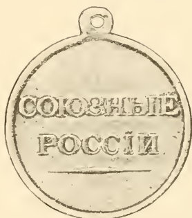
Translation of inscription: "Allies of Russia."