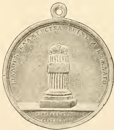
Translation of inscription: "The Pledge of Happiness to all and each."—Crowned in Moscow, Sept. 15, 1801.