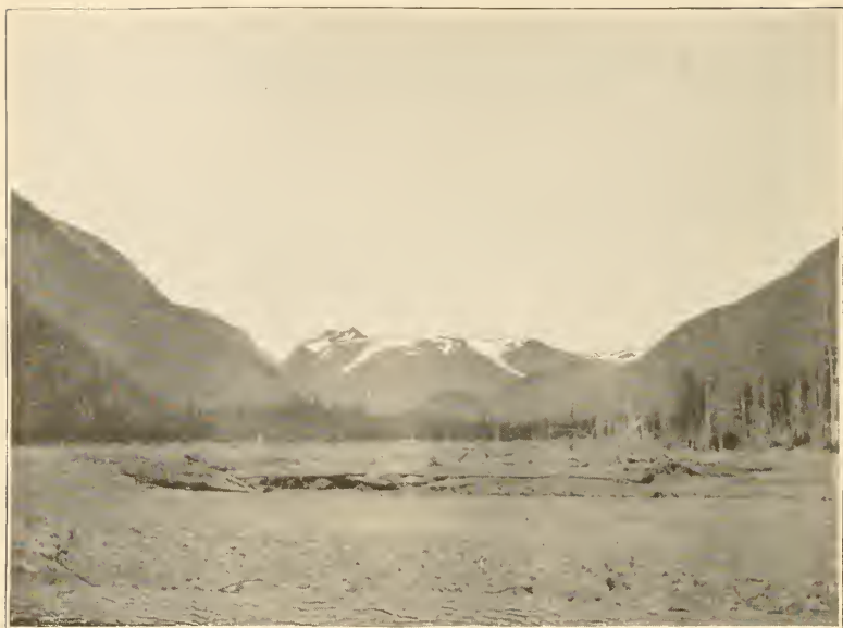
BEAR RIVER VALLEY from a point near the 56th parallel.