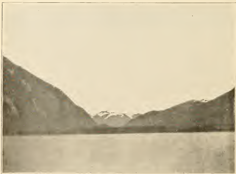
BEAR RIVER VALLEY from Portland Canal.