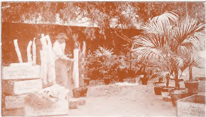
Packing is done quite carefully at the "Exotic Nurseries" It is a point second to none, that the plants should reach you as they leave us. Many nurseries overlook this fact but the "Exotic Nurseries" give it its full importance.

WIGANDIA urens . Very attractive on account of its large, showy leaves and its large, conspicuous blue flowers—a very striking arborescent plant. Balled plants $1.00 and up.