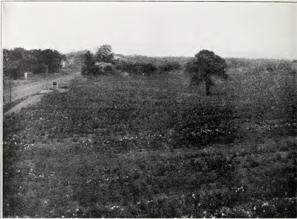
A View, looking west, of Kendal Dahlia Gardens at beginning of bloomtime 100,000 HILLS AND NOT A SINGLE

If you order "Garden Beautiful" collection on back cover you may select any 50c Dahlia or 1 Tritoma (see page 30) in this catalog FREE as a courtesy.