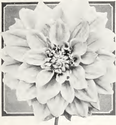
EL DORADO (Greatly Reduced)

EASTERN STAR F. D. (Dahlidel)—The color of this decorative is a saffron yellow with old gold shading. The flower is of good substance and good keeping qualities with full centers, held on strong, erect stems. Of excellent bush growth and free flowering. It gives 10 inches without forcing and has a wonderful prize winning record. $1.00 each, 3 for $2.70.