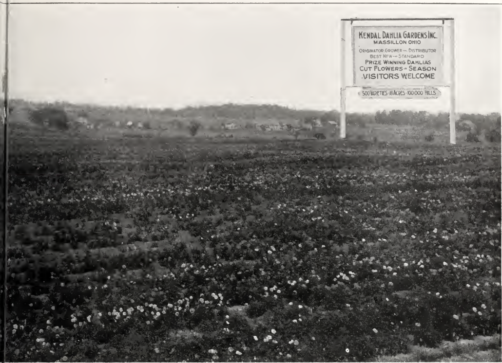
31 from 35 feet elevation of housetop on east side of gardens. Sign is inset. KE IN THE WHOLE GARDENS

erect stems. A sturdy grower and a free bloomer with full centers to the end of the season. Blooms often 10 inches in diameter, 4\frac{1}{2} inches deep; bush 5 to 6 feet in height. A cut flower, garden or exhibition variety with Certificates of Merit and high score and a prize winner. $2.50 each, Plants, $1.25.