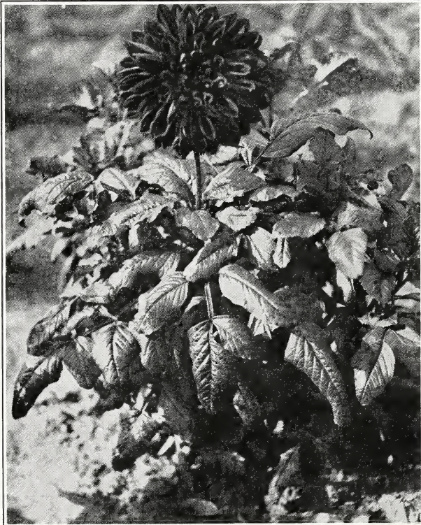
THOMAS A. EDISON F. D. (Dahliadel)—Royal Purple named for the famous Electrical Wizard with his approval. Staghorn petal formation insect resistant foliage, cane stiff stems, thrifty growing habits, is the report on this new 1930 Dahlia from high sources. Has grown in our gardens since 1931. Our available stock limited. $5.00 each, Plants, $2.50.

We appreciate your patronage in values not words. Note this. Upon receipt of your 1932 order from this catalog we will forward you a coupon for 10% of the value of the 1932 order good for that amount on an order of equal amount or more in 1933 or for 10% of the amount if 1933 order is less. For instance, if your 1932 order is for $7.50 we will send you a coupon good for 75c on an order of $7.50 or more in 1933 or for 10% of any 1933 order less than $7.50, and so on. We make this unusual offer to our customers as our appreciation for their support which has assisted our success. We want you to take advantage of it.