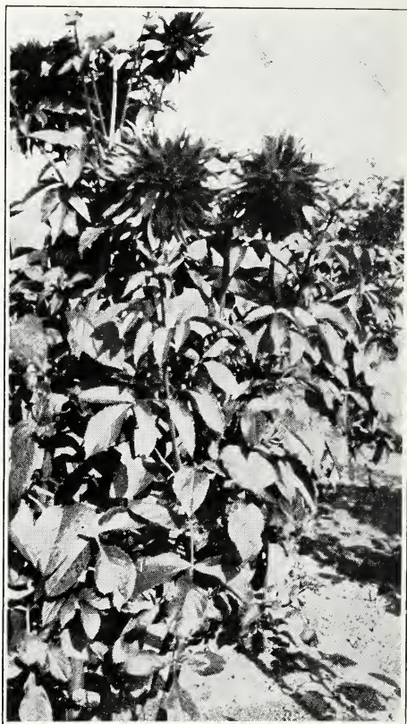
Ft. Monmouth grown in California from one of our plants delayed 13 days in transit. Tall plant extreme upper left, Ohio Giant.

F. W. BUTLER F. D. (Boston)—An unusual shade of orange with exceptionally deep petals regularly formed. One of the largest of its type on excellent stems. At the 1929 San Francisco Show it was the largest perfect bloom. Stock very limited. $10.00 each, Plants, $5.00 Net.