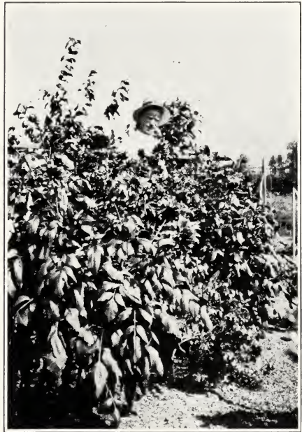
Two Jane Cowl grown in California from our plants delayed 13 days because misdirected and the man who grew them. Our plants are like that.

INDIANA MOON F. D. (Martin) —Color, Flesh ocher, flushed pink, salmon and gold. Huge flowers of color, beauty and form on a vigorous, beautiful plant with disease and insect resisting foliage. A 1932 introduction bearing high endorsement of Eastern growers. 1930 Certificate of Merit Dahlia. $10.00 each, Plants, $5.00.