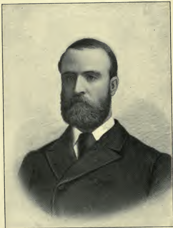
CHARLES STEWART PARNELL