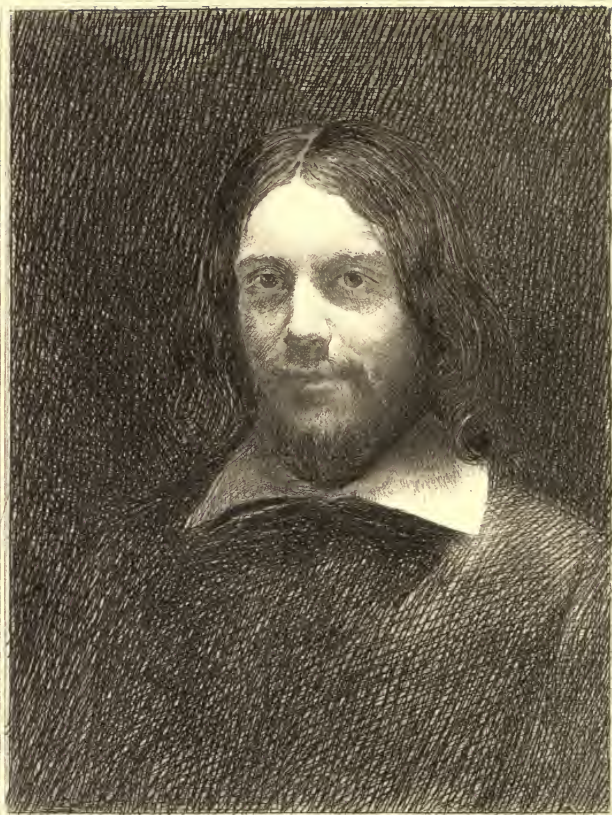
W PAGE PINX 1843