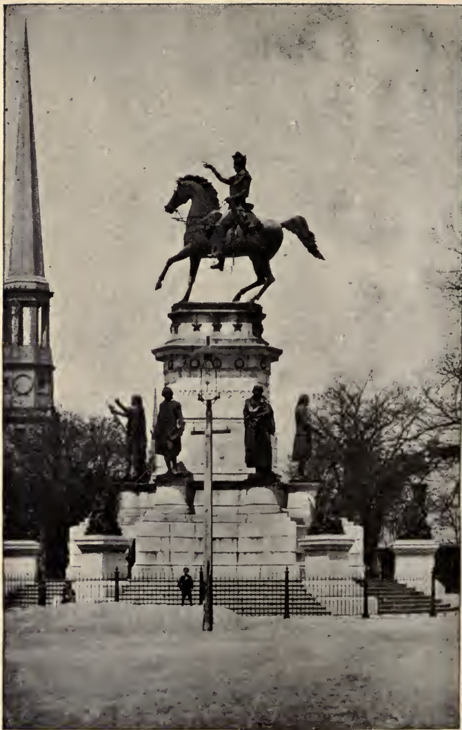
CRAWFORD'S STATUE OF WASHINGTON, in the Capitol Square, Richmond, Virginia.