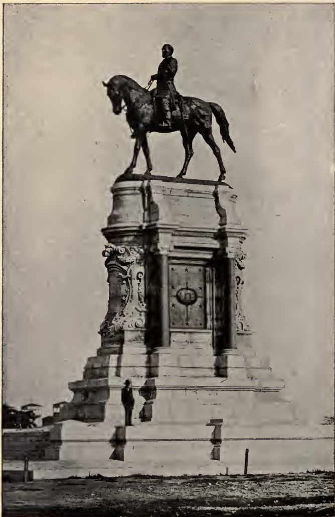
STATUE OF GENERAL R. E. LEE (by Mercier), in Richmond, Virginia.