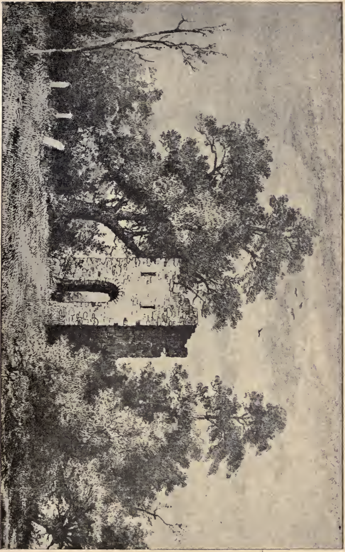
RUINS OF ANCIENT CHURCH TOWER, Jamestown, Virginia.