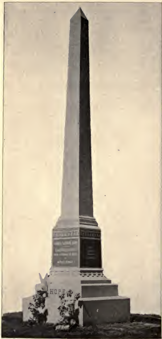
MONUMENT TO JAMES BARRON HOPE, in Elmwood Cemetery, Norfolk, Virginia.