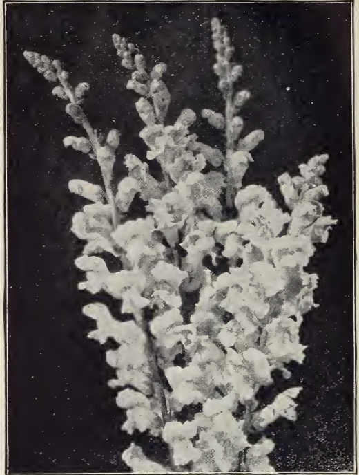
Antirrhinum or Snapdragon