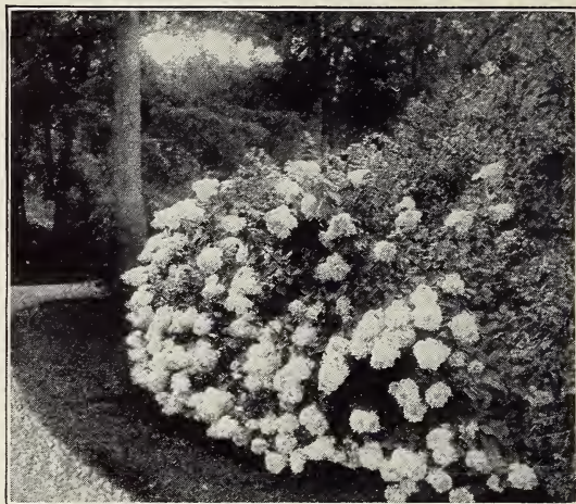
Hydrangea Paniculata Grandiflora

Morrowii (Japanese Bush Honeysuckle). Grows only 4 to 6 feet tall with wide-spreading branches. Vigorous grower, bearing snow-white flowers in May and June, followed by bright red fruits which are very decorative..... .....3 to 4 Feet, Each, 75c