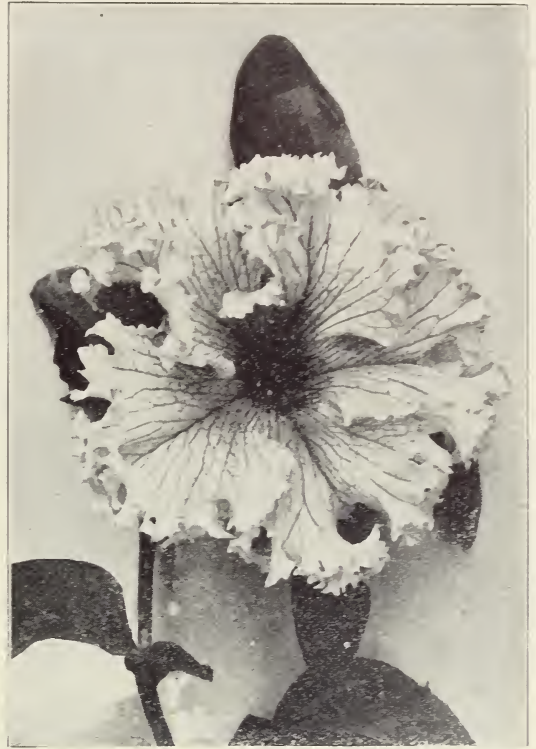
Type of Barnard's "Mammoth" Single