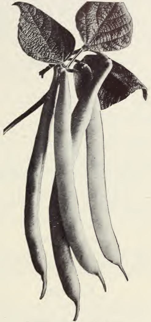
Barnard's Stringless Green Pod