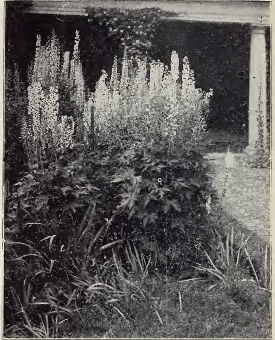
Delphinium Hybridum "Blue Bird" Strain

This pretty and interesting annual blooms most profusely from July till November; their exquisite pale lavender blossoms are excellent for cutting; plants grow about 18 inches high. Sow where plants are to bloom..... Pkt. 10c