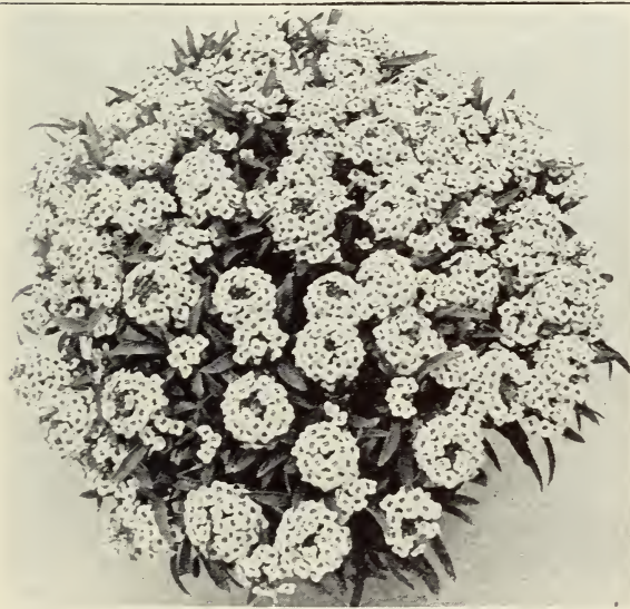
Barnard's Little Gem Alyssum