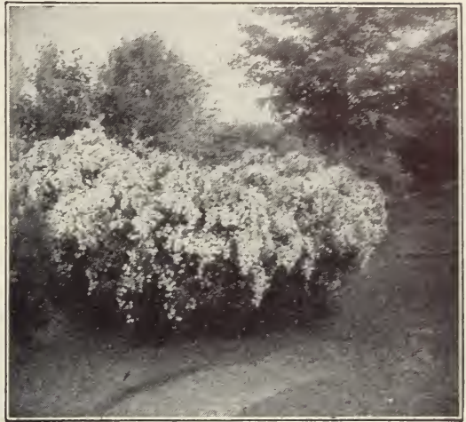
Spirea Van Houttei (Bridal Wreath)

Typhina laciniata (Staghorn Sumac). The branches are densely covered with velvety hairy-like growth resembling the developing Elks Horn. Deeply serrated leaves whose deep crimson color and persistent crimson fruit makes it attractive..... .....3 to 4 Feet, Each, 75c