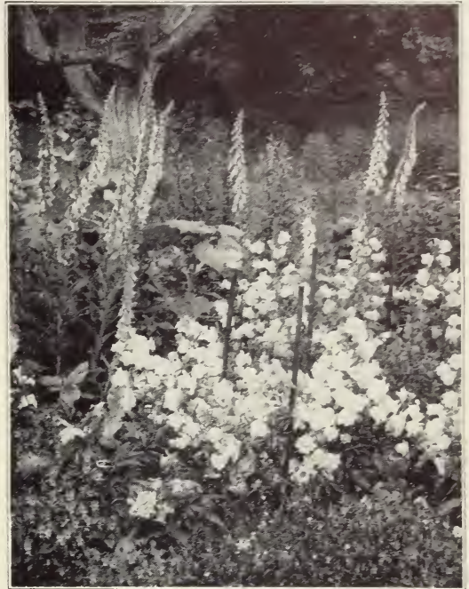
Canterbury Bells and Foxglove

Autumn Glow, pinkish-bronze. Old Homestead, pink. Victory, white. Indian, red. Golden Queen, yellow.