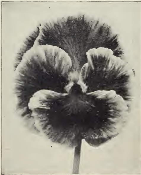
Type of Barnard's "Florists' Mixture"

Blue, Rose, White, Crimson, Balcony Queen (violet and white), and Balcony Mixed ..... Each, Pkt. 15c