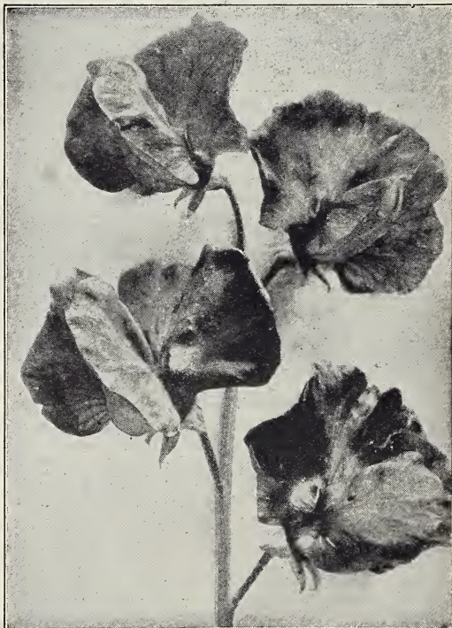
"Butterfly" or "Orchid Flowered"

Choice Mixture of Grandiflora Type are considered easier to grow than the Spencers.....Oz. 10c; ¼ lb. 30c; 1 lb. $1.00