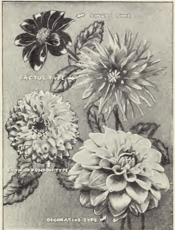
Different Types of Dahlias

Early flowering, producing several flower spikes from each bulb during July and August. Each, 5c; Doz., 50c