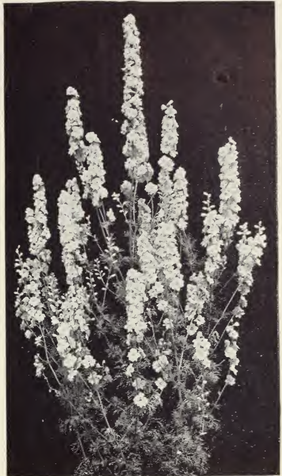
Larkspur, La France and Los Angeles Type