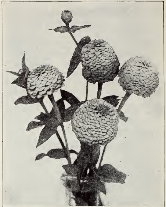
Lilliputian Zinnias, Are Very Popular