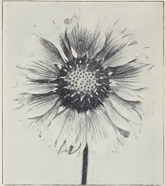
Gaillardia, The Dazzler