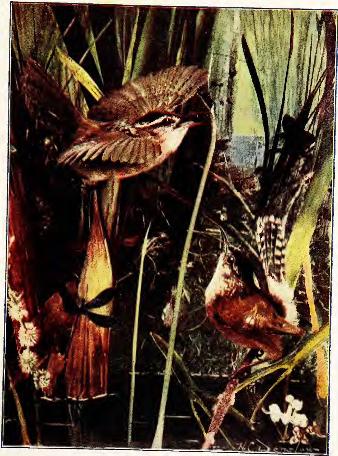
LONG-BILLED MARSH WREN