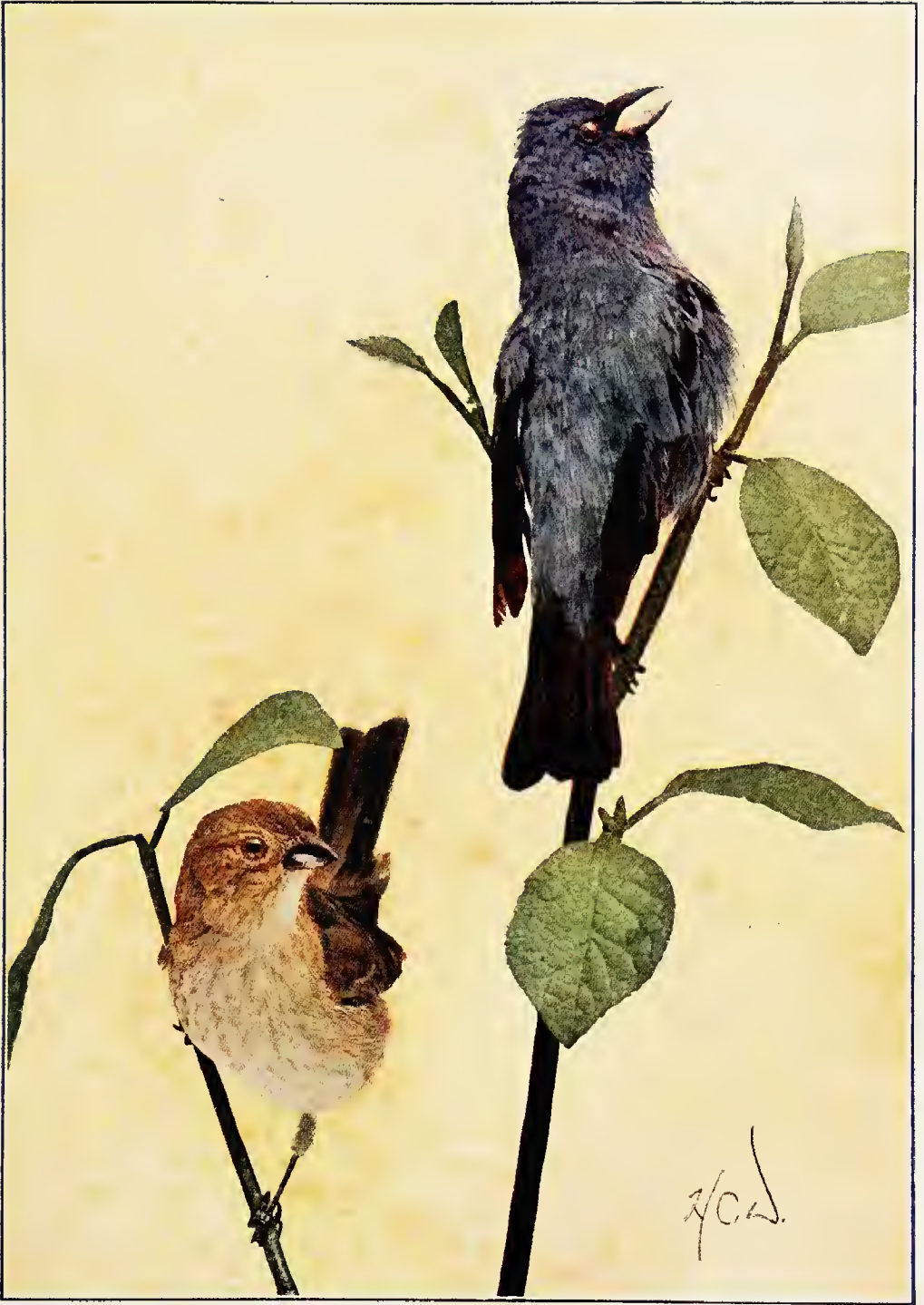
INDIGO BIRD. MALE AND FEMALE