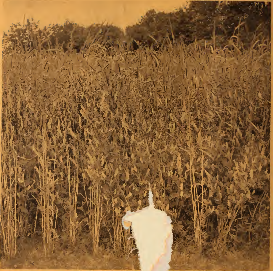
Our field of Acclimated Hairy Vetch grown with rye. After harvest the rye seed was all separated from the vetch seed with a special vetch seed separator.