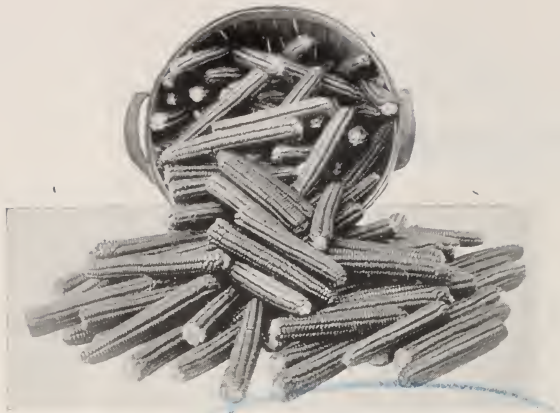
A bushel of my Yellow Flint Seed Corn.

This variety has been grown by my grandfather, father and myself on our farm for over sixty years. It is one of the earliest types grown in New England. We have improved the varieties by careful seed selection, and have developed a very uniform and productive variety of Flint corn. I can recommend it wherever Flint Seed Corn is desired. The plants are large, leafy, tender, and the ears are of a beautiful golden color. The plants will average 8½ feet in height, and the ears are about 11 inches in length, 6¼ inches in circumference. The ears bear eight rows of kernels, and about 50 kernels in the row.