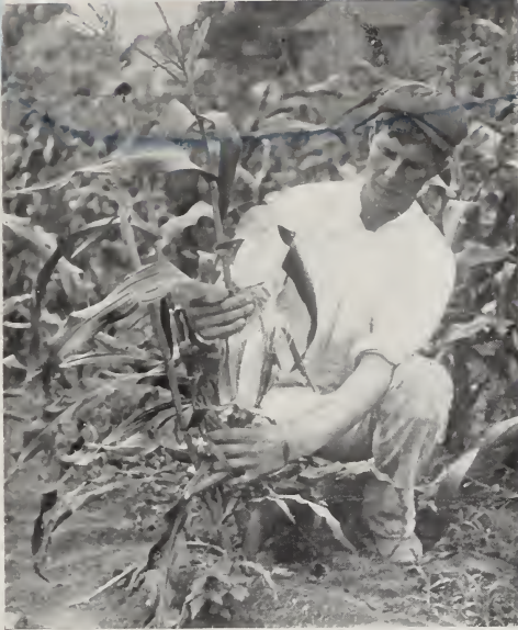
An ear of Malakhof Sweet Corn in edible condition.

This variety of sweet corn we have developed from a small quantity of seed which was secured from the seed introduction division of the Bureau of Plant Industry of the U. S. Dept. of Agriculture.