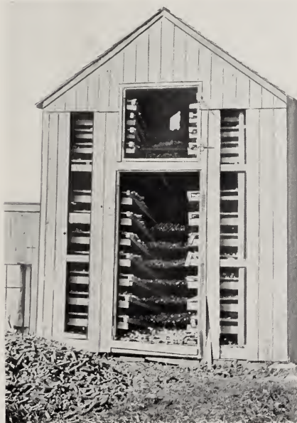
Curing room for Sweet Corn and system of ventilation during late summer.

The side picture represents one of my sweet corn curing houses thoroughly ventilated. The above cut shows my large seed corn warehouse where all of my flint and dent corn is dried and made ready for shipment. Everything is thoroughly up to date in regard to cleaning, sorting, shelling, etc. The ventilators can be closed in stormy weather and seed corn is thoroughly protected from all unfavorable weather conditions.