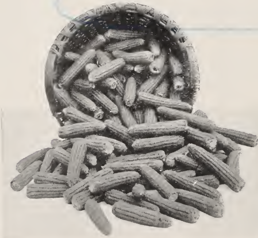
A bushel of seed ears of my strain of Early Crosby Sweet Corn.

I consider this the best variety of sweet corn for home planting or canning purposes in existence. We have been scientifically breeding this variety for six years testing our breeding stock for sugar content by chemical analyses and other tests, and propagating the higher yielding ears, with highest sugar content. It is very uniform early, and produces an extremely eatable and delicious table corn. By planting a few hills, a week apart, from May 15th to June 15th, a succession of tender, sweet and nourishing table corn can be had all summer. I would like to see every lover of high grade table corn, plant a quart of this seed or more.