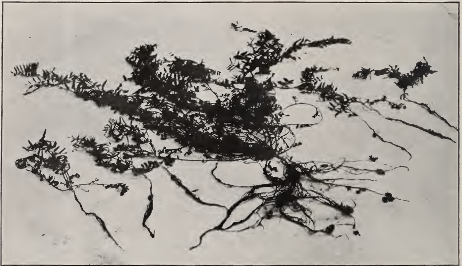
Several specimen plants of Hairy Vetch showing Nodules.

A limited amount of this acclimated seed will be ready for delivery about Aug. 1, 1911. Price $5.00 per bushel, or 10c. per pound. 40 to 60 pounds per acre of this seed should be sowed for cover crop purposes.