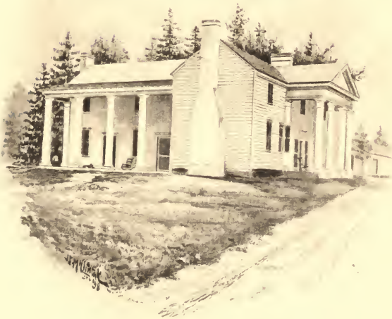
The Home of John C. Calhoun