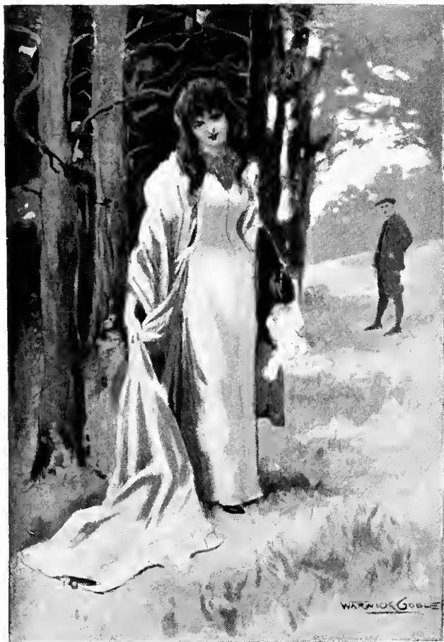
THE GHOST WALK.