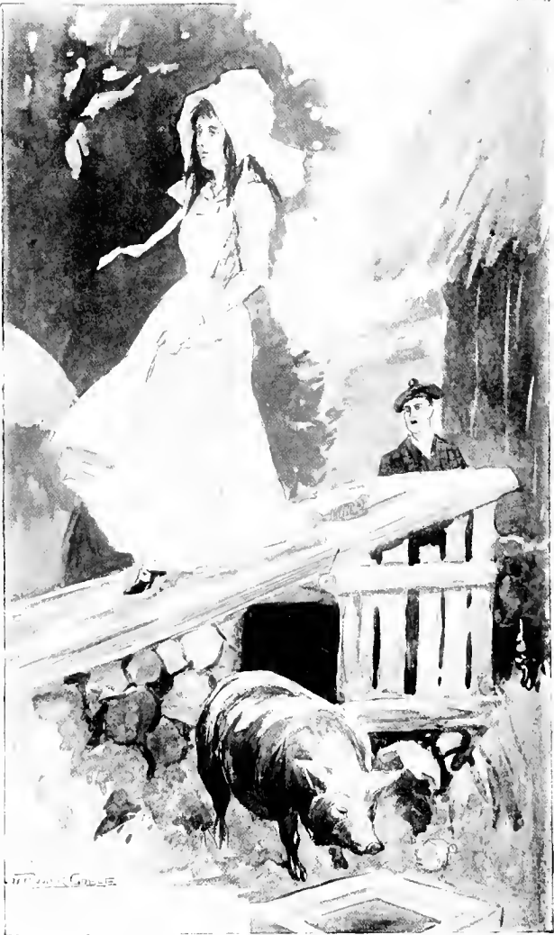
MARCHING MAJESTICALLY ERECT OVER THE ROOFS.