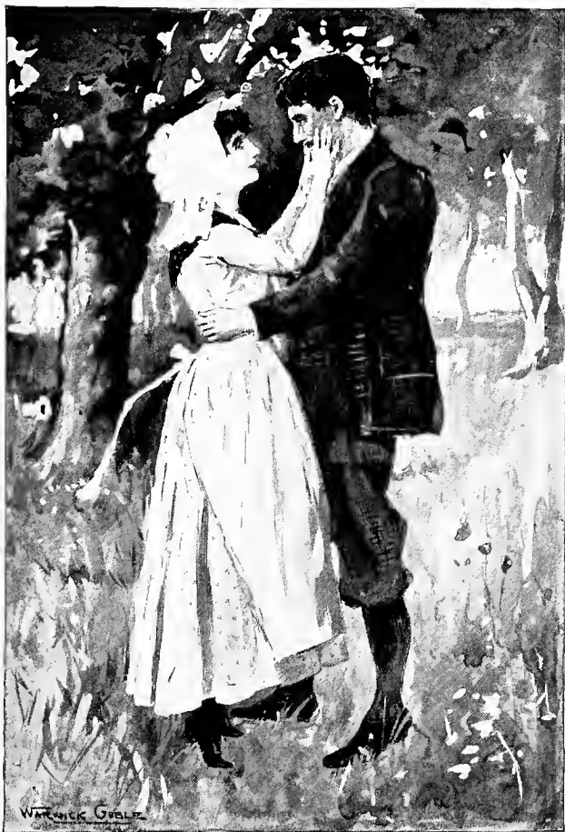
SHE STOOD ON TIPTOE, AND TAKING MY FACE BETWEEN HER HANDS SHE KISSED ME DAINTILY.