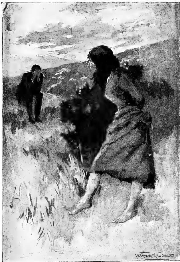
THE WILD THING ON THE MOOR.