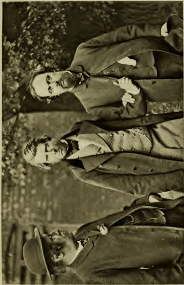
W. Bell Scott.