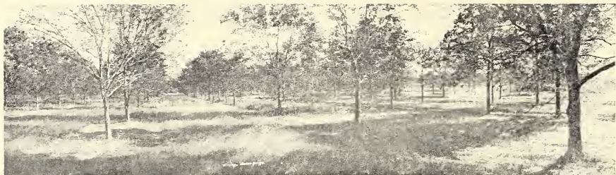
BECOME THE OWNER OF A PECAN ORCHARD LIKE THIS