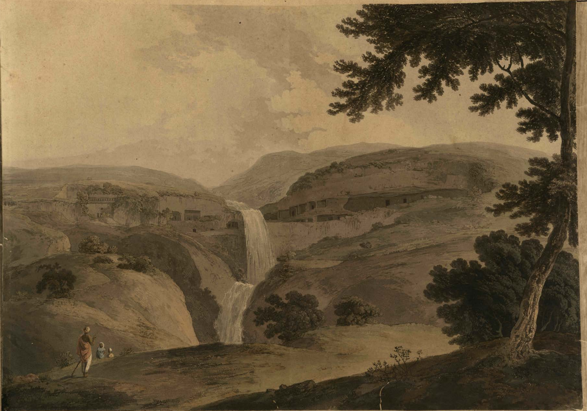
THE MOUNTAIN OF ELLORA. 3 d VIEW.