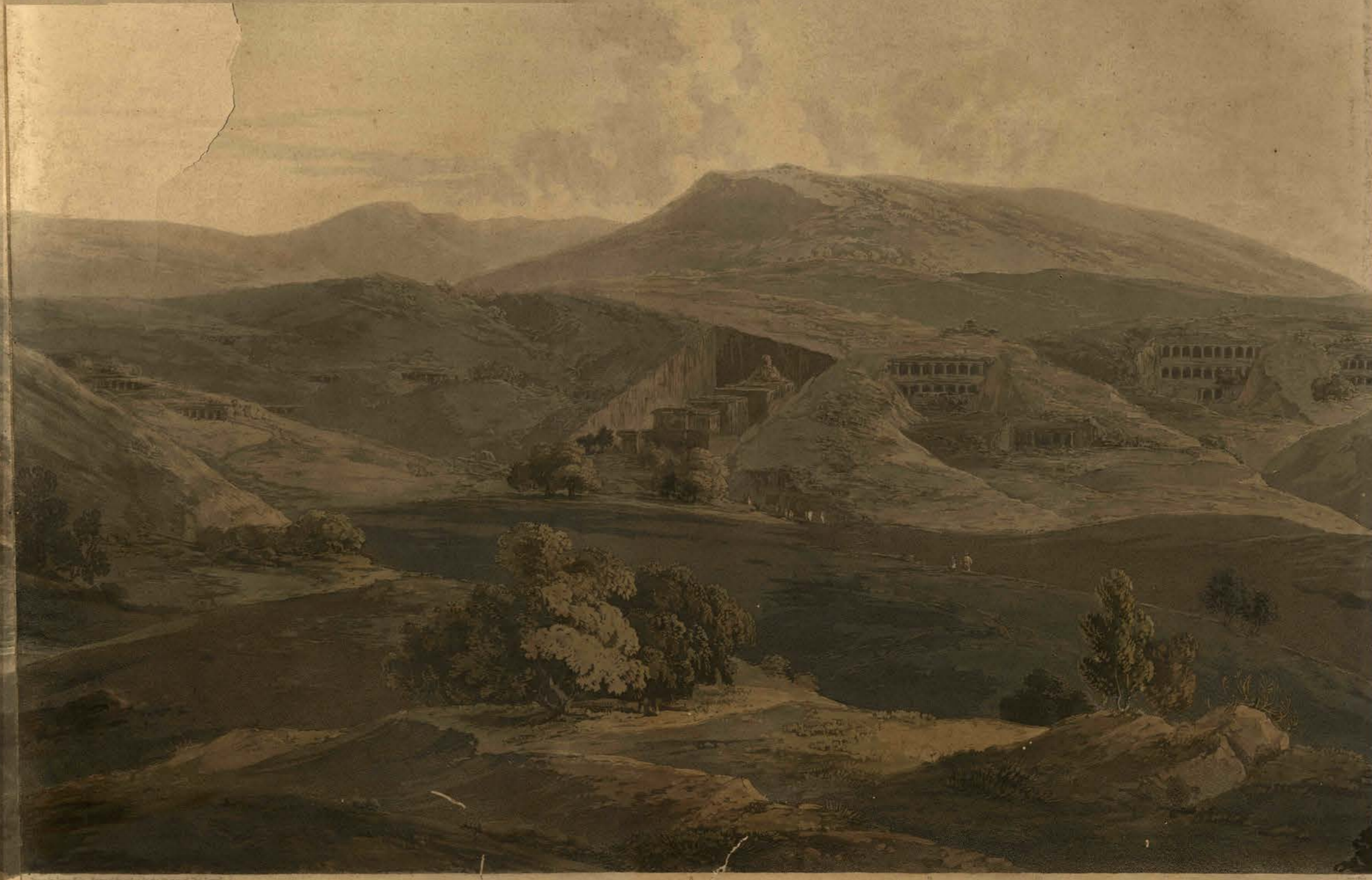
THE MOUNTAIN OF ELDORA. 2 ND VIEW.