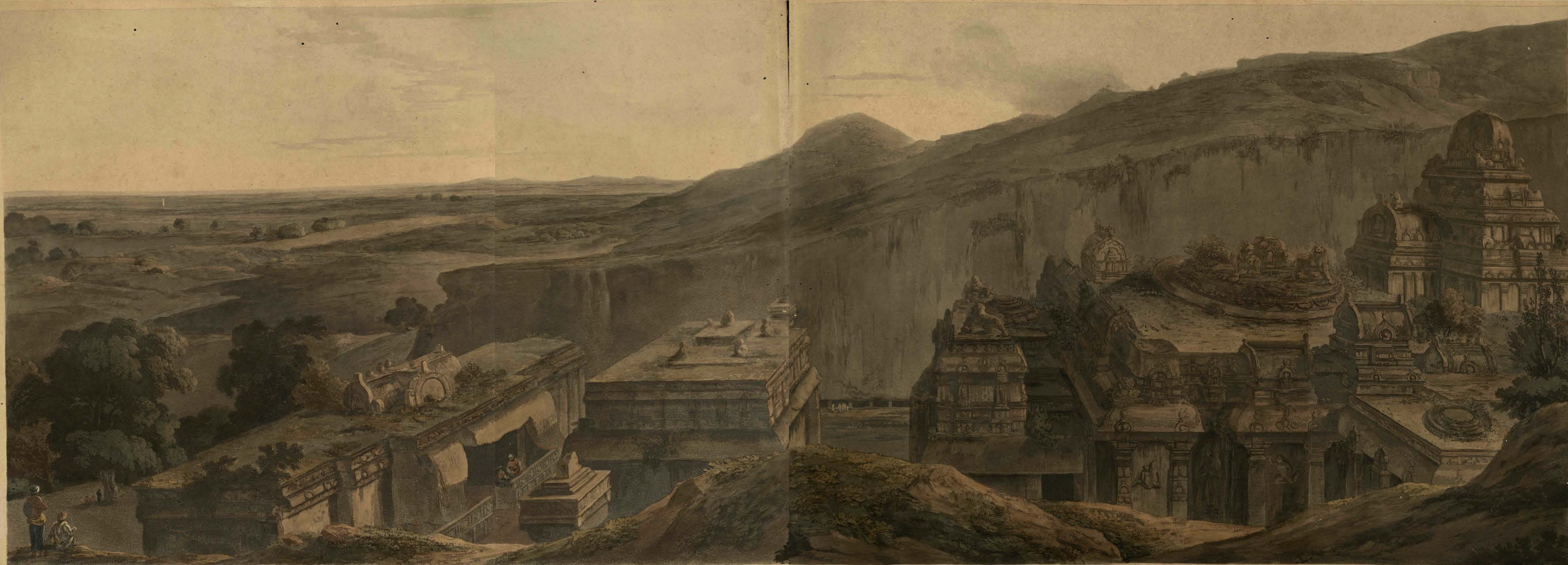
THE UPPER PART OF KAILASA. N.I.