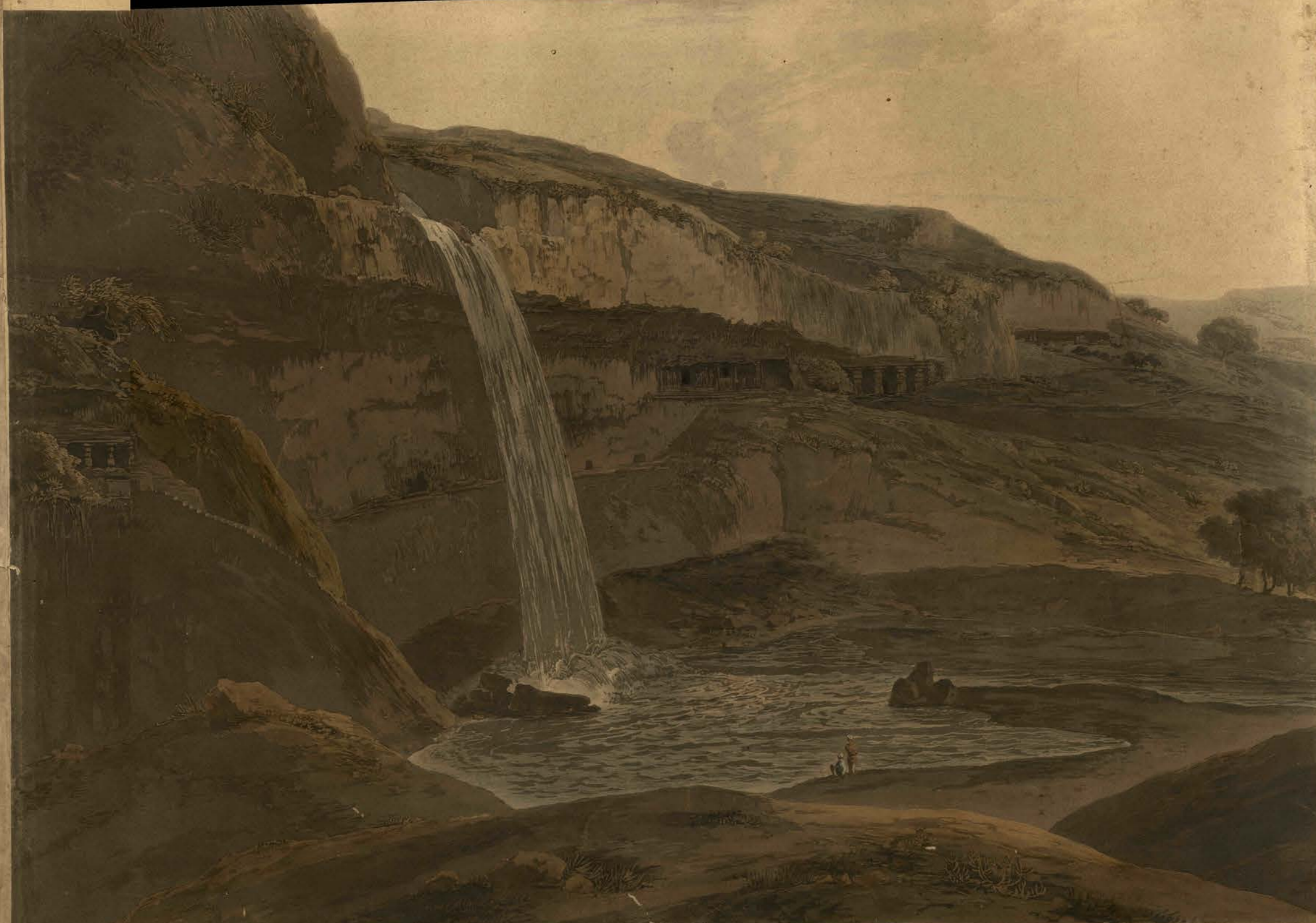
THE MOUNTAIN OF ELDORA. 1 ST VIEW.