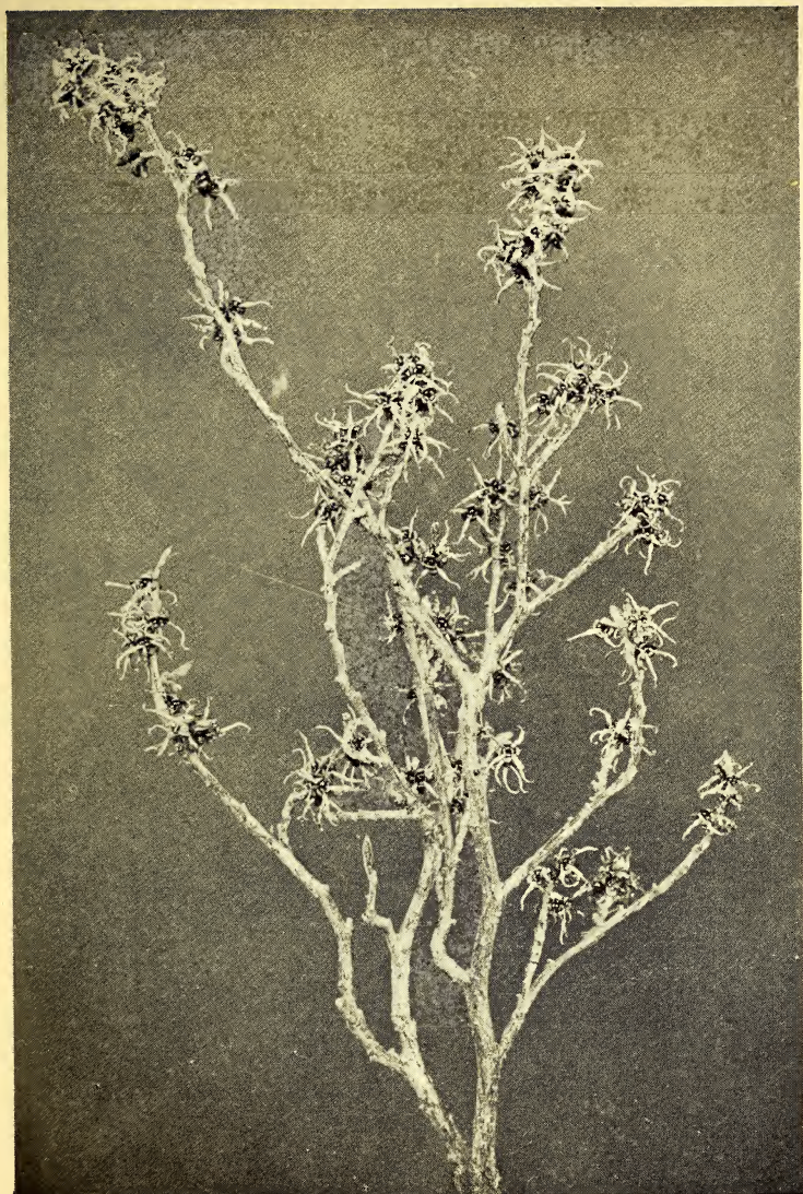
WITCH OR WYCH HAZEL