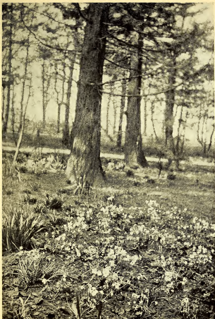
EARLY FLOWERS OF ANEMONE HEPATICA IN WOODLAND