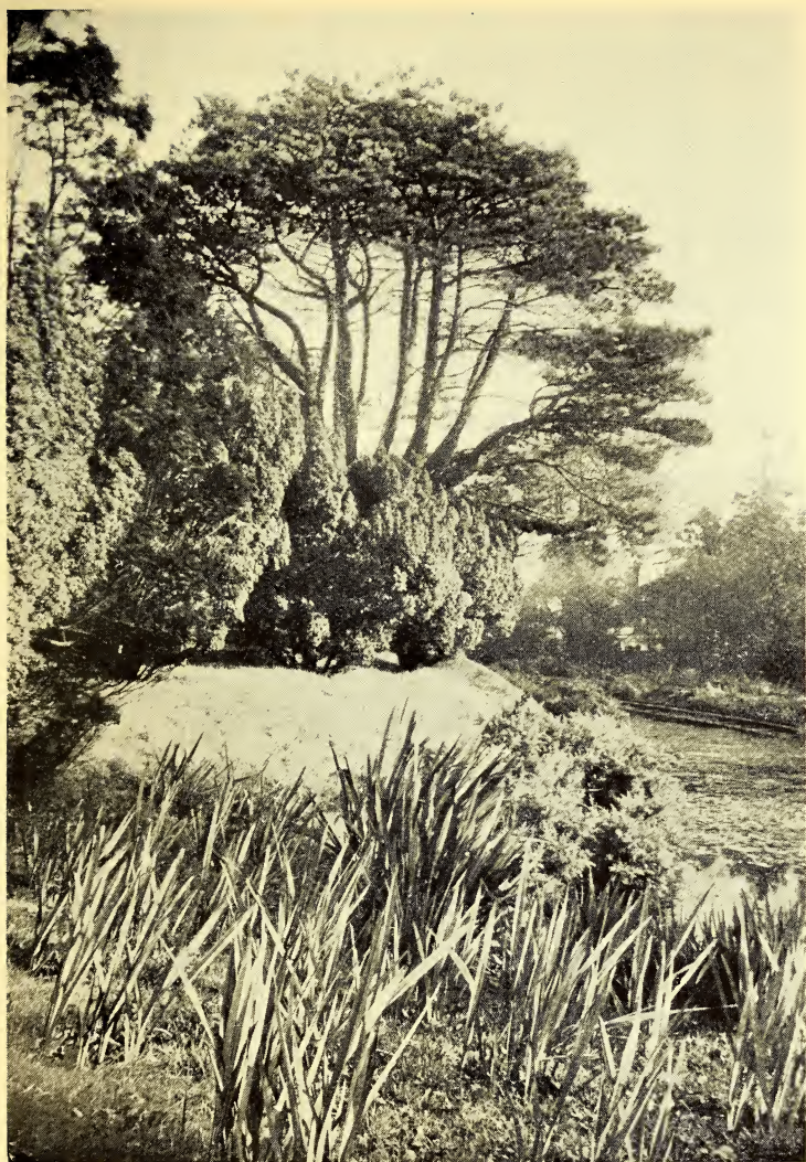
NEW ZEALAND FLAX ( PHORMIUM TENAX )