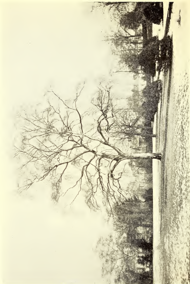
WEeping SILVER BIRCH (BETULA ALBA PENDULA) AT THE ROYAL BOTANIC GARDENS, EDINBURGH