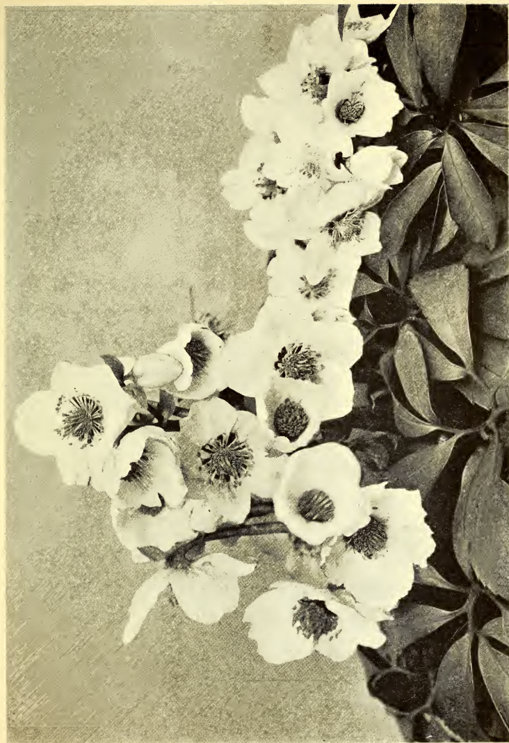
CHRISTMAS ROSES (HELLEBORUS NIGER AND A LARGE FLOWERED VARIETY, MAXIMUS)