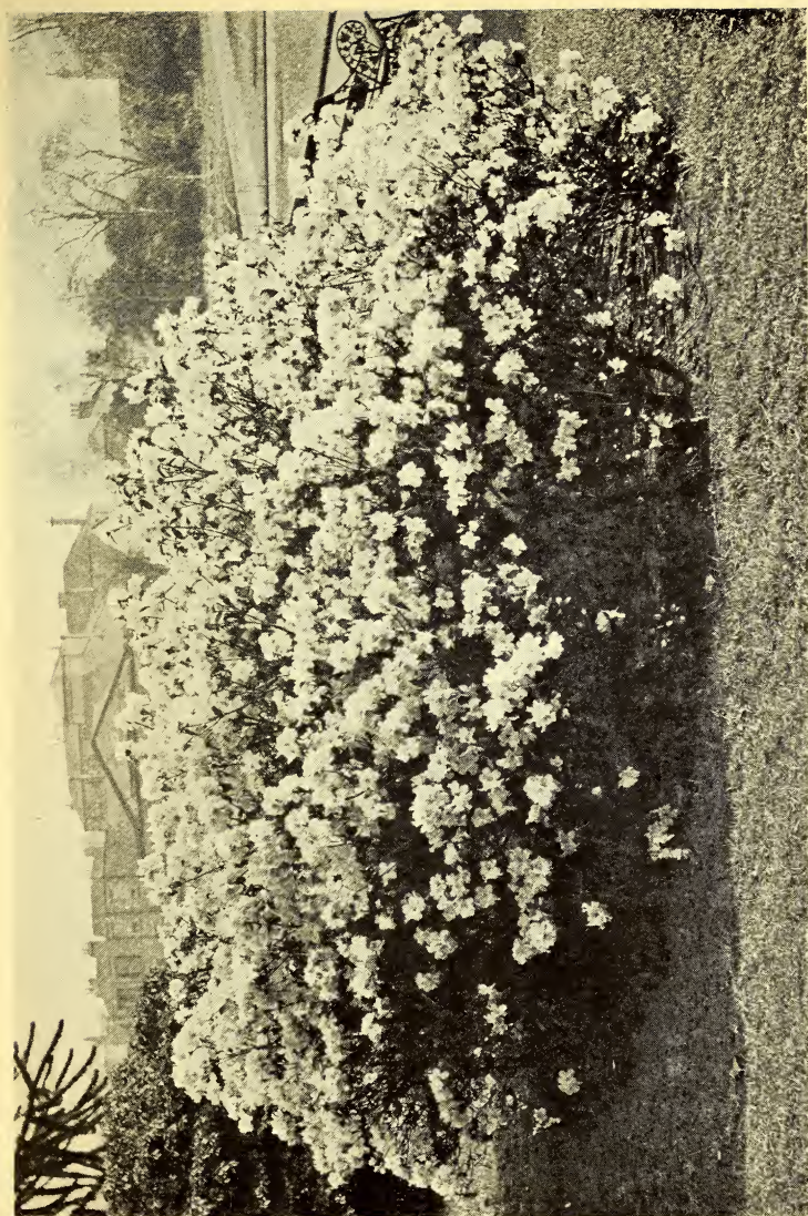
THE EARLY FLOWERING RHODODENDRON PRAECOX (CILIATUM X DAURICUM)