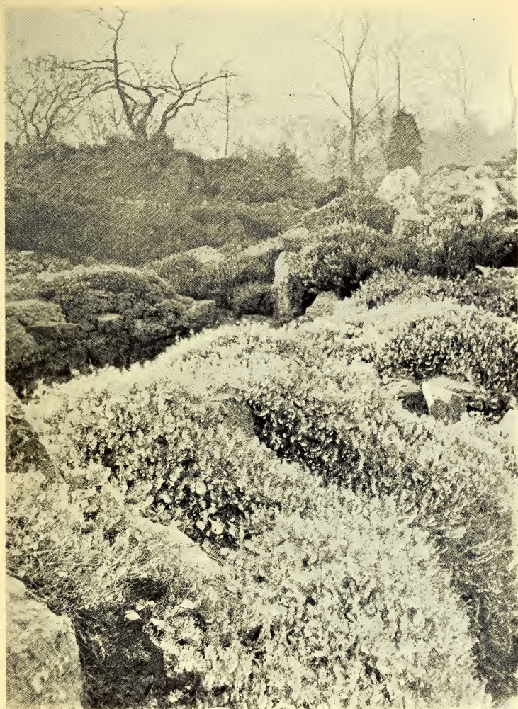
ERICA CARNEA, VAR. ALBA IN A ROCK GARDEN From a photograph taken in the first week of January