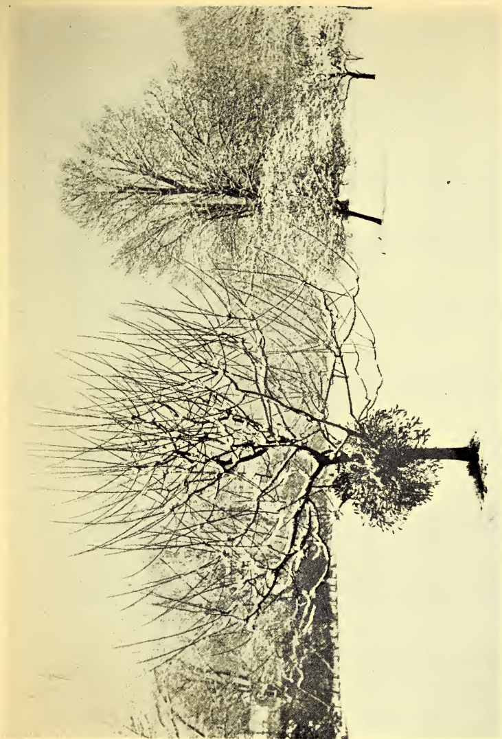
MISTLETOE ON CRAB APPLE