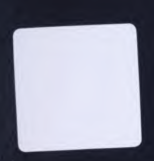
GETTY CENTER LIBRARY