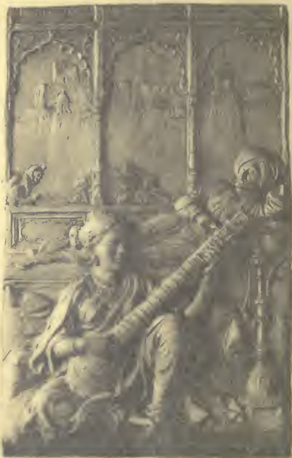
ON THE CITY WALL