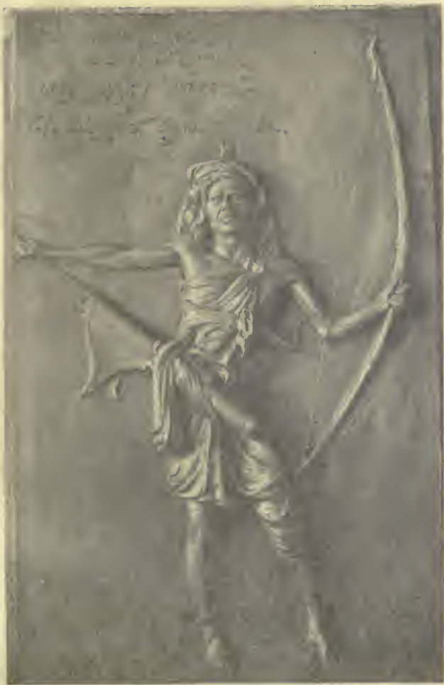
THE JUDGMENT OF DUNGARA