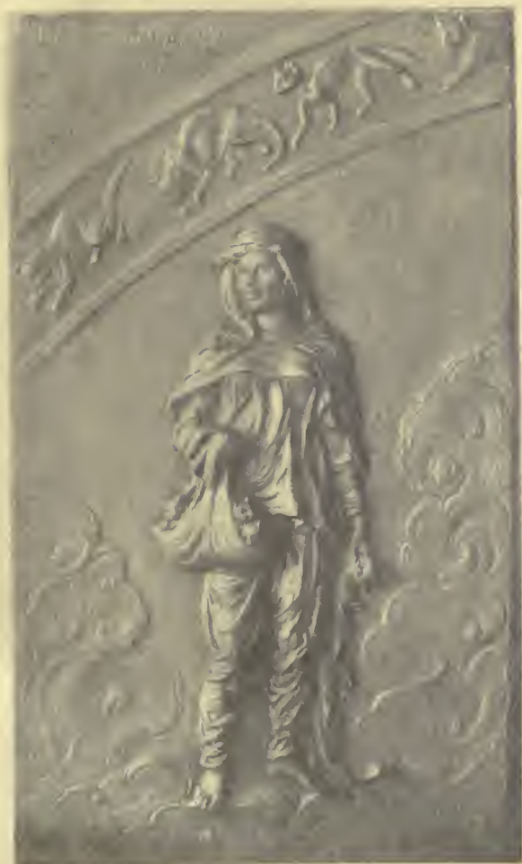
THE SENDING OF DANA DA