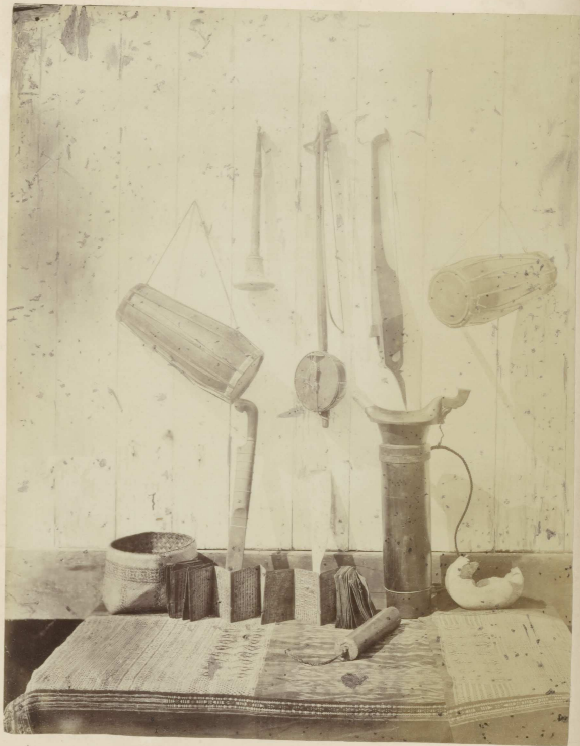
Battak Musical Instruments.