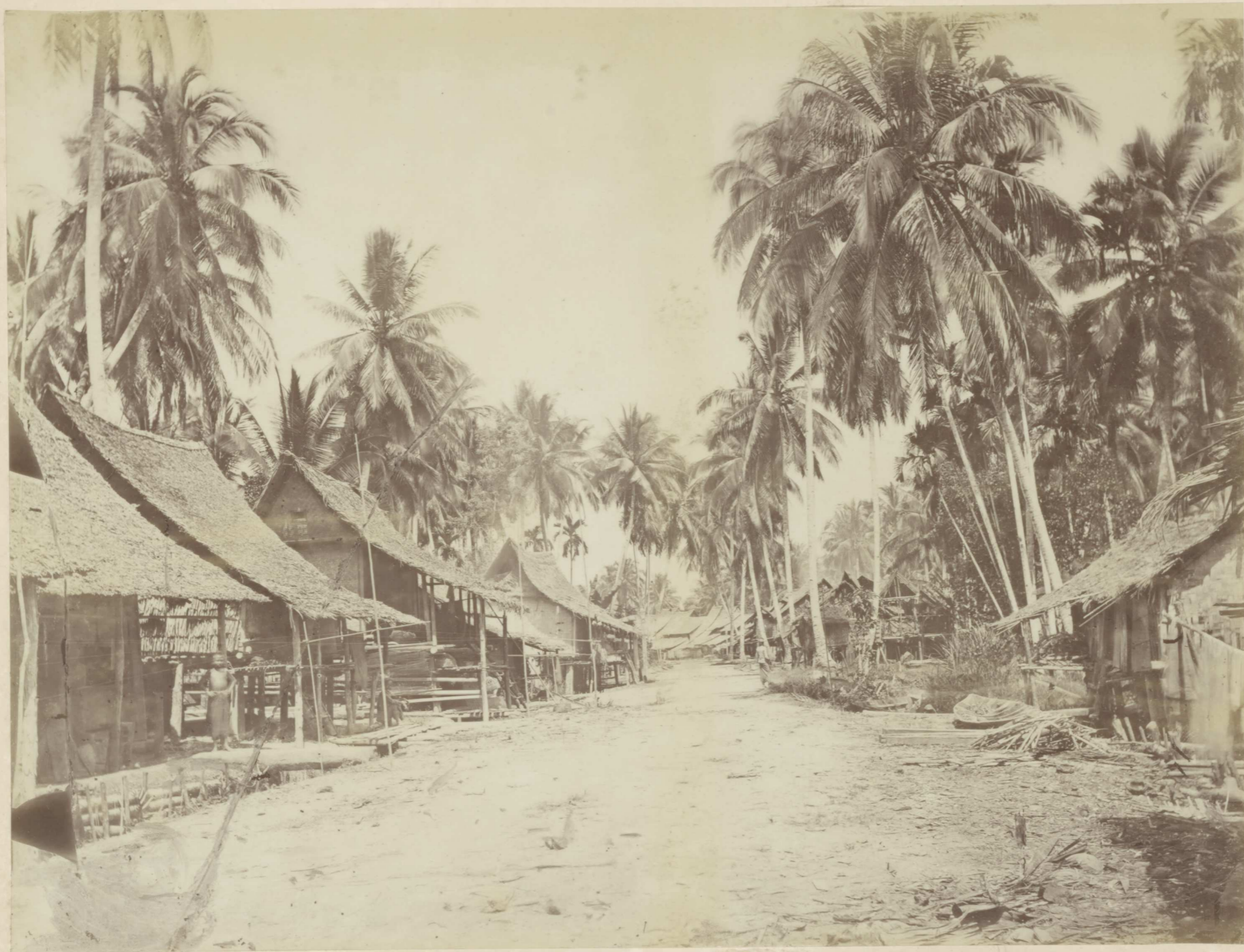
View of Labuan taken in 1867.