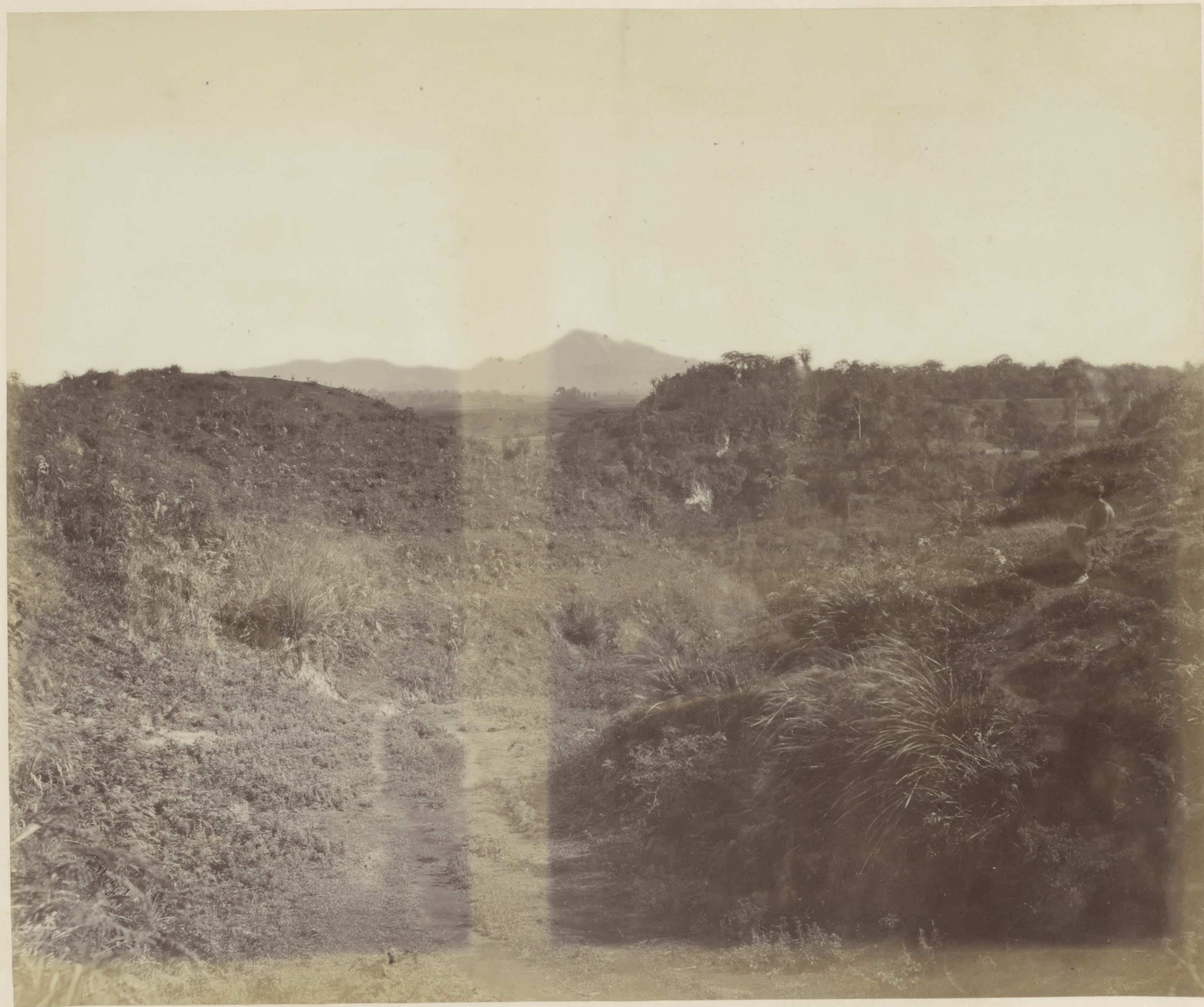
Gunnung Blerang, a Vulcanic Mountain on the Battak Plateau.