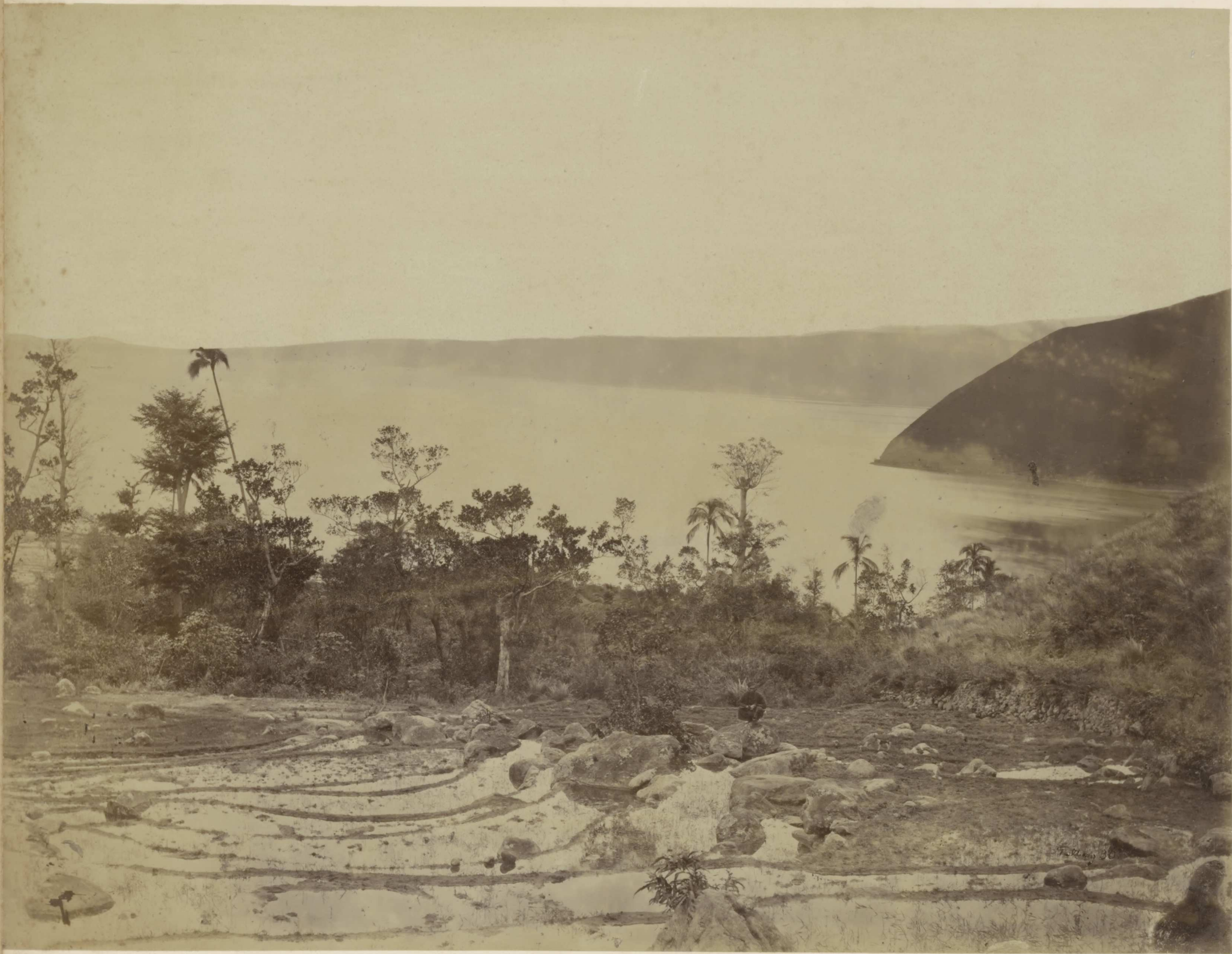
— 3000 Feet above the sea.