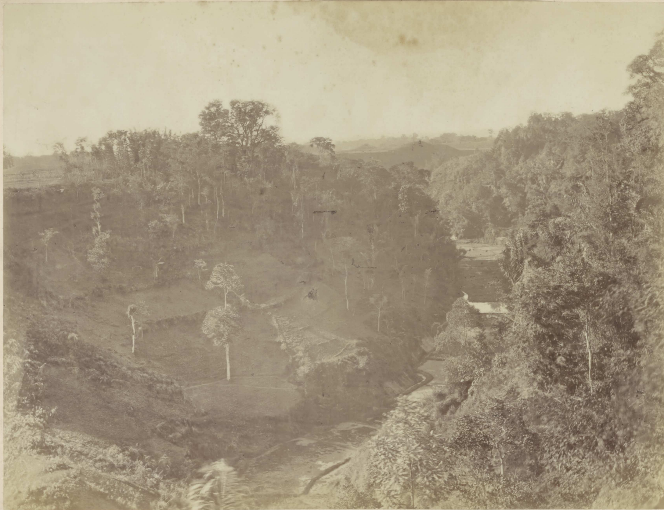
Ravines outside Bahru Jahai.