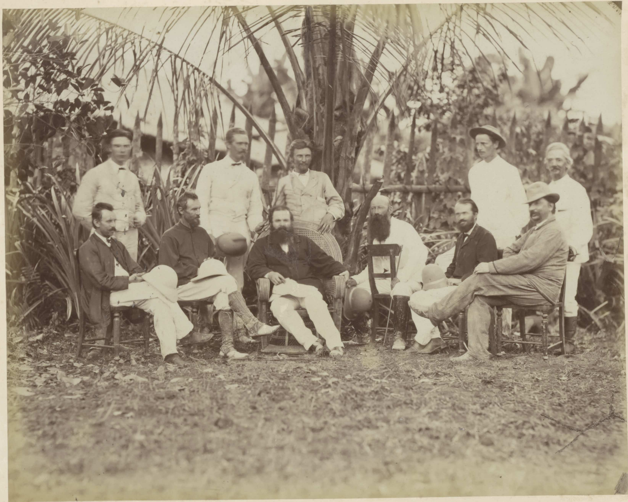
Group of Planters in Deli.