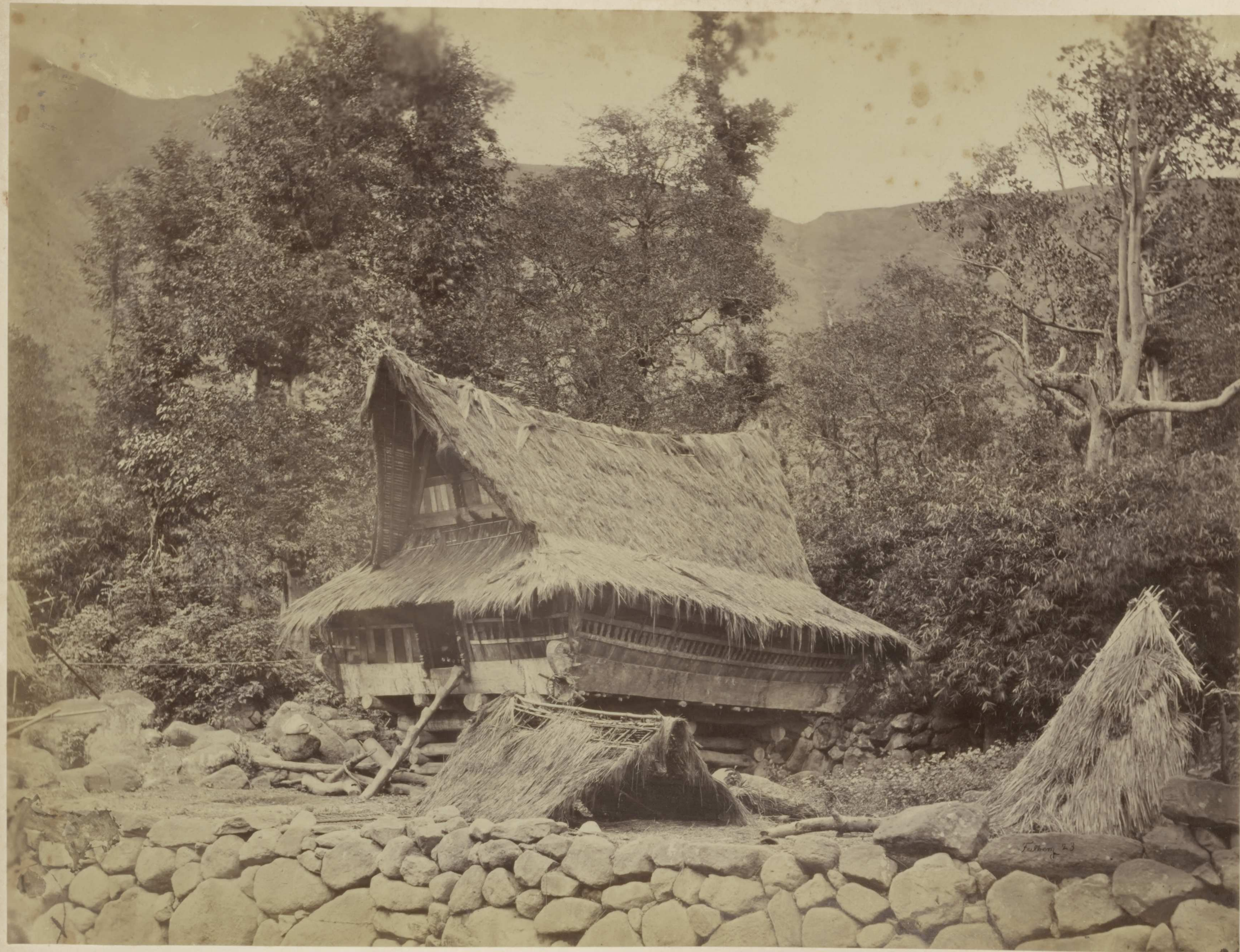
View from Dinging near Lake Tobah.