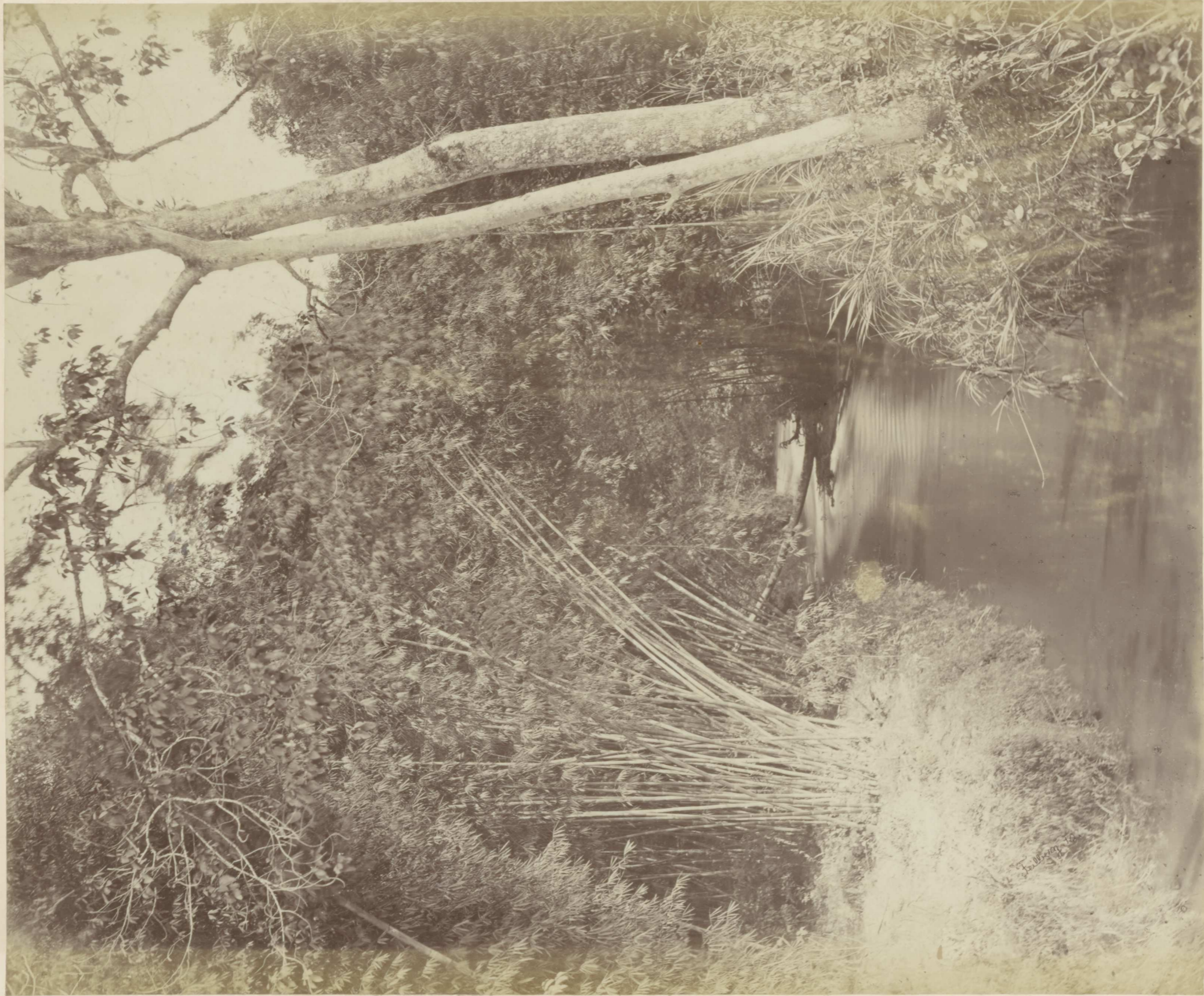
River Scenery at Sebroya.