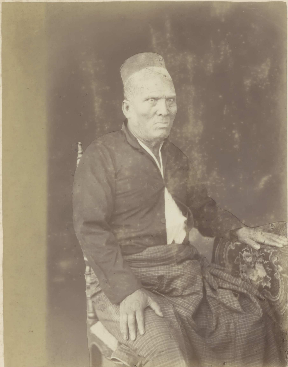
Dato of Amprampehra.