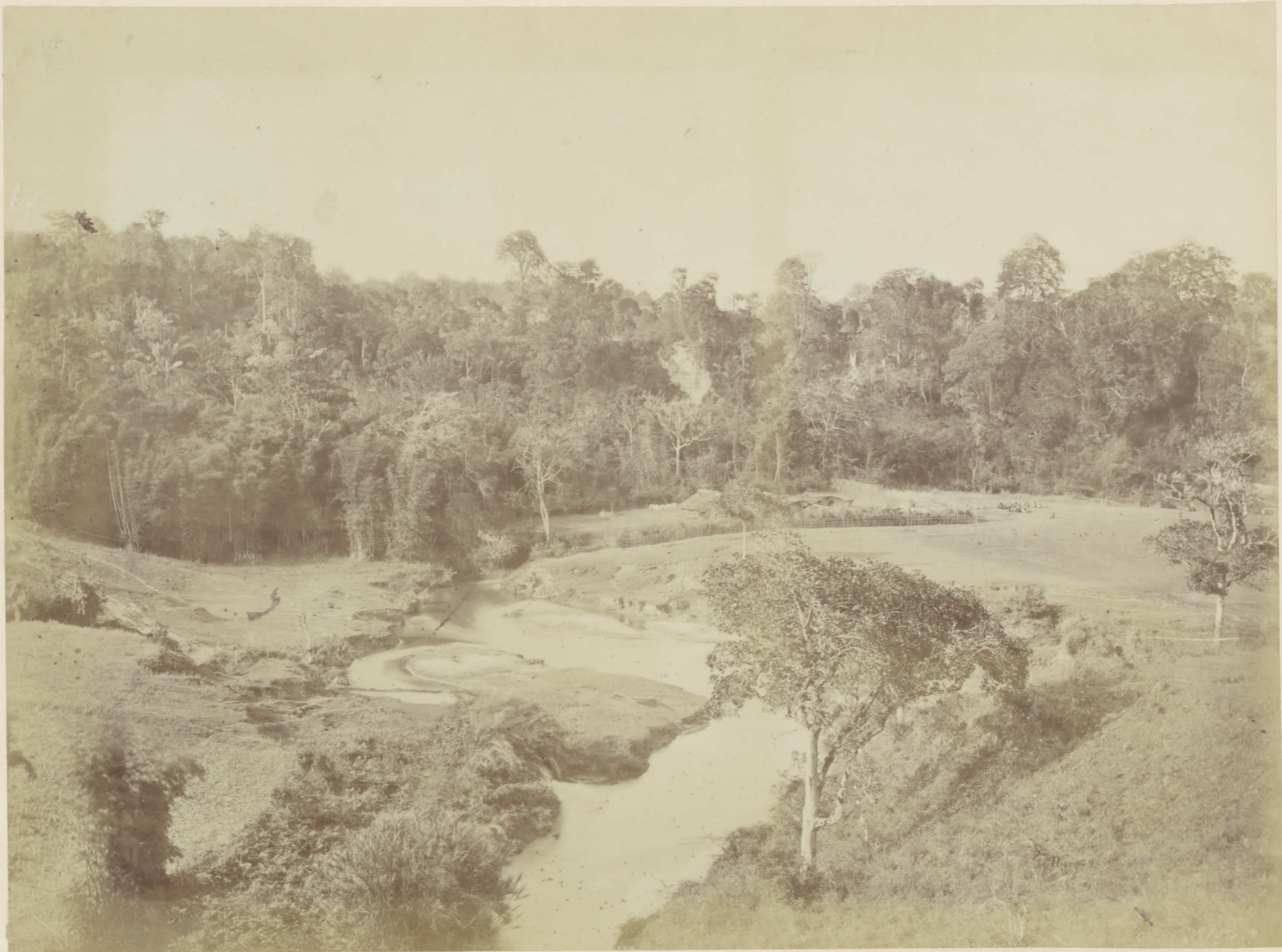
Our Encampment below Sebreyá.