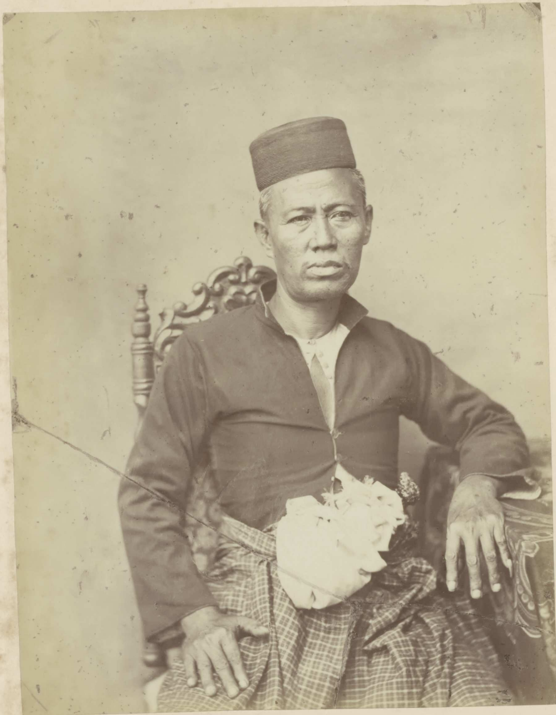
Pangehran of Lankat.