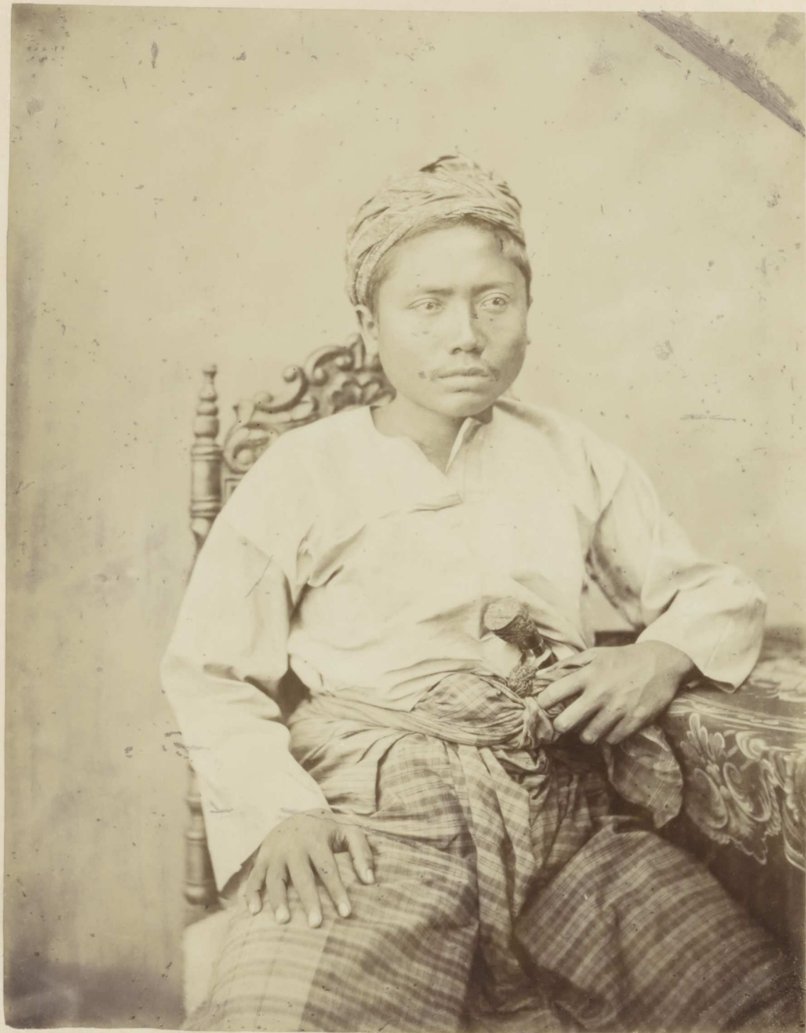
Dato of Sungal.