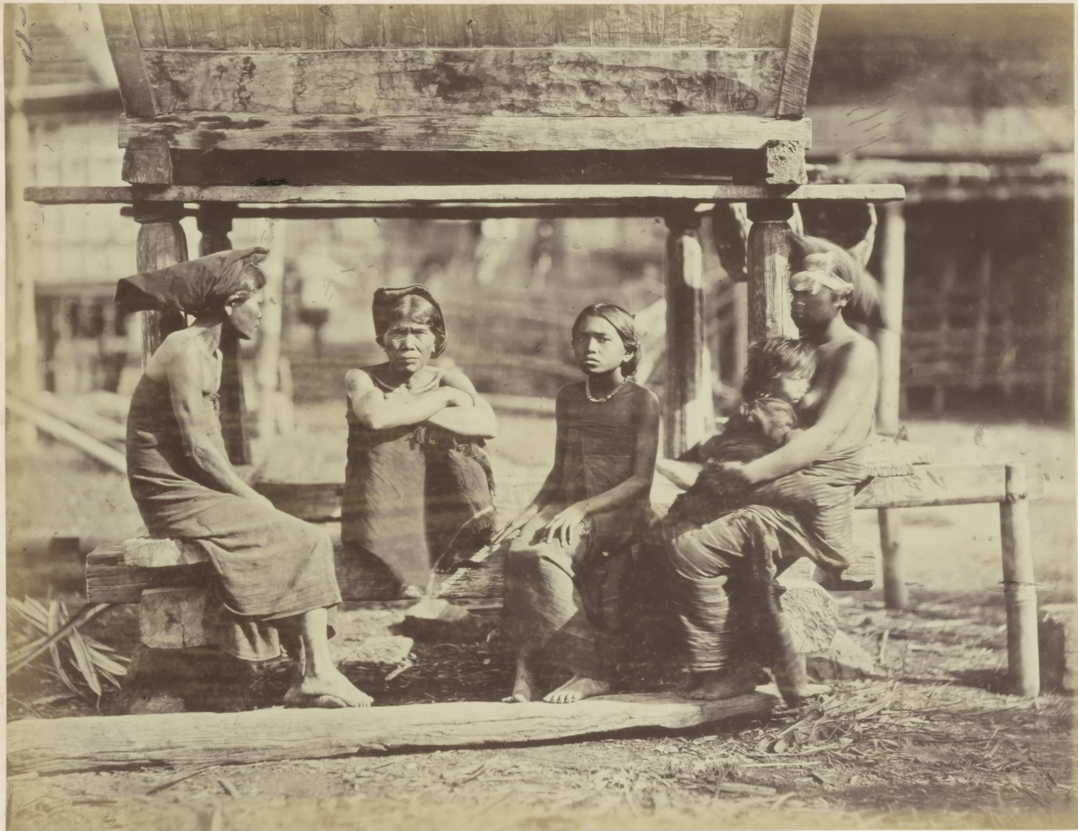
Group of Battak Women.