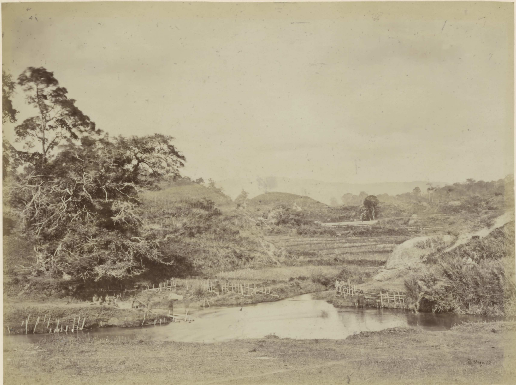
River Scenery near our Encampment at Sebreyá.