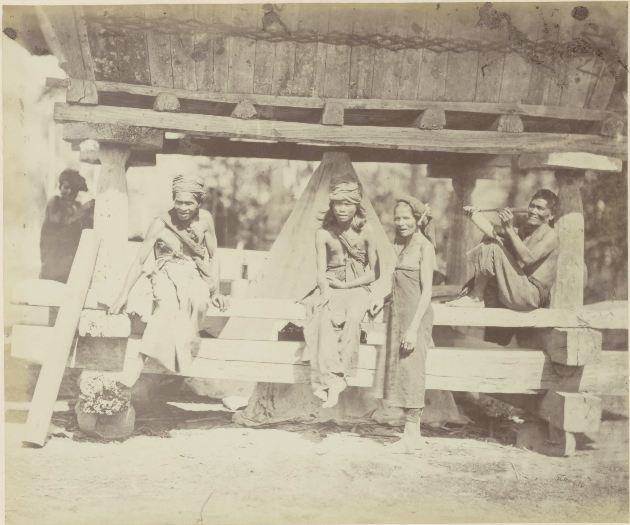
Group of Battaks.