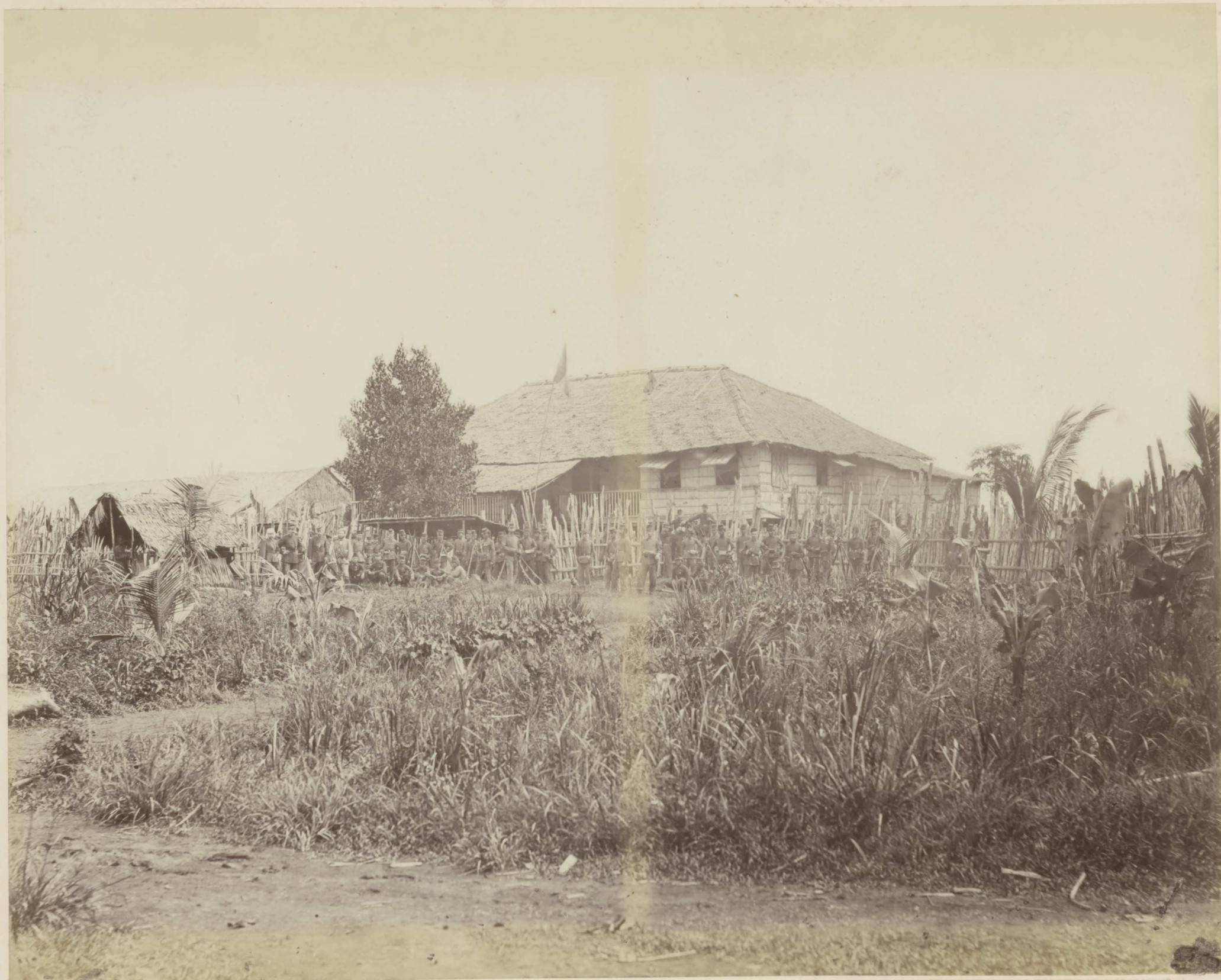
Entreprice, Headquarter of the Dutch Troops in the beginning of the Battak War.