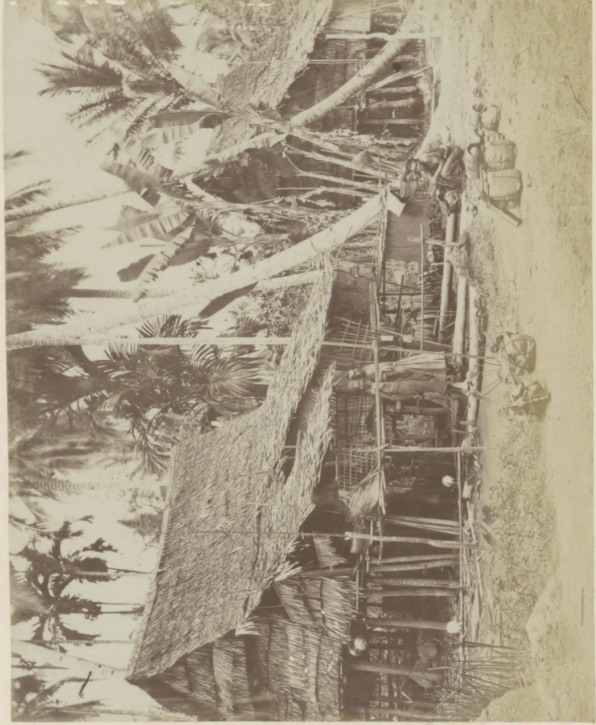
Malay Huts in Labuan frequented by Battaks.