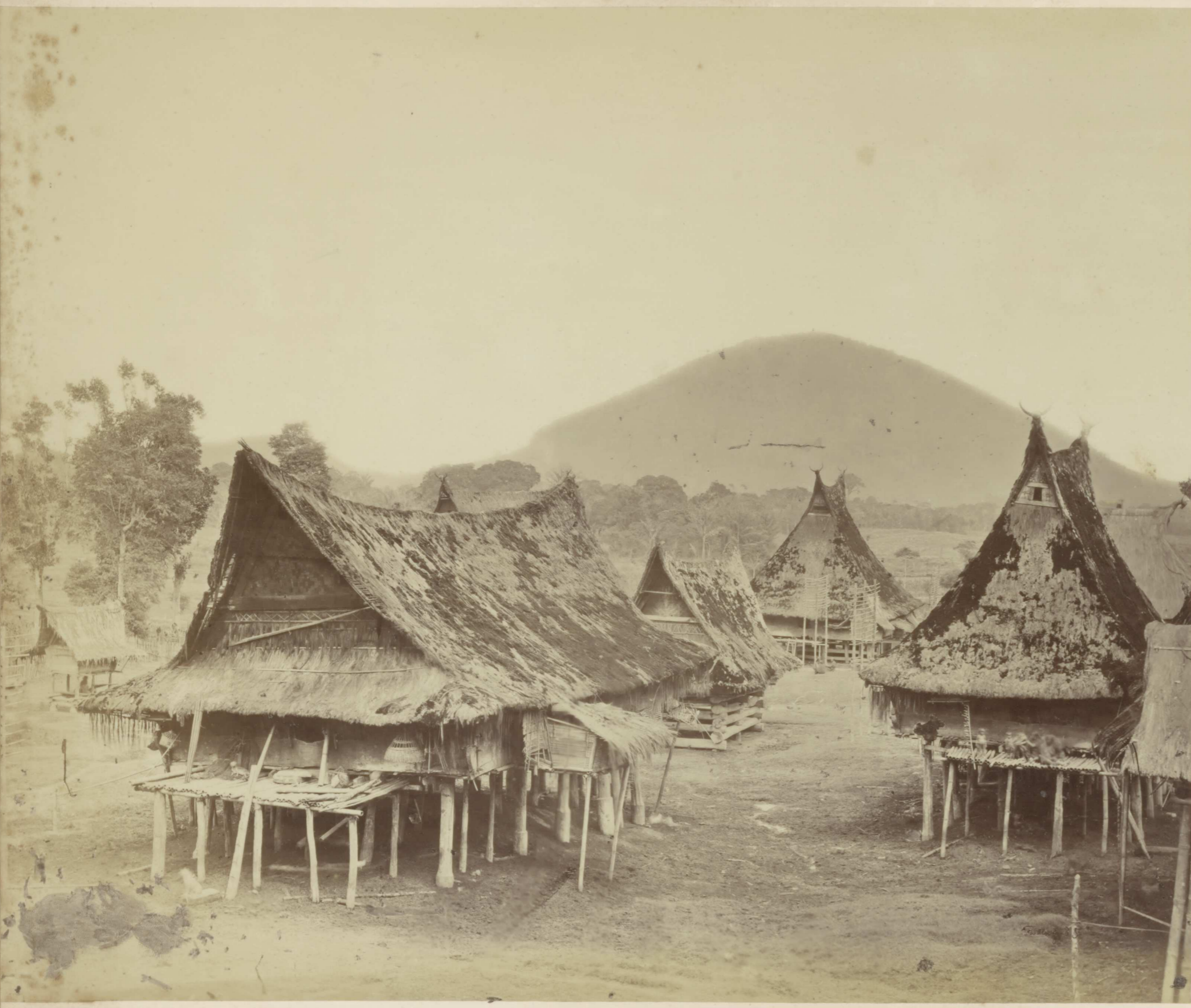
— near Lake Tobah.