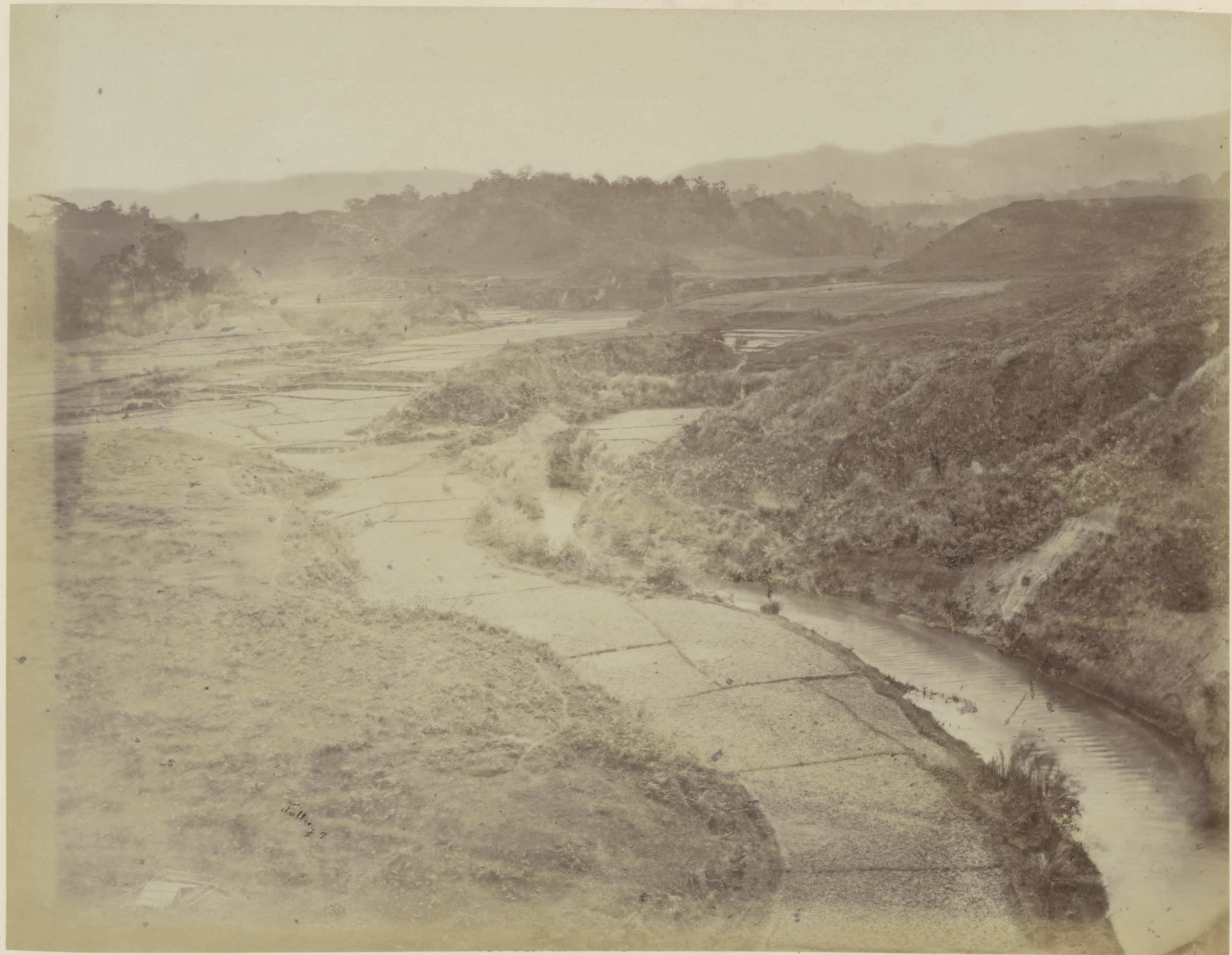
View of Ricefields on the Battak Plateau.