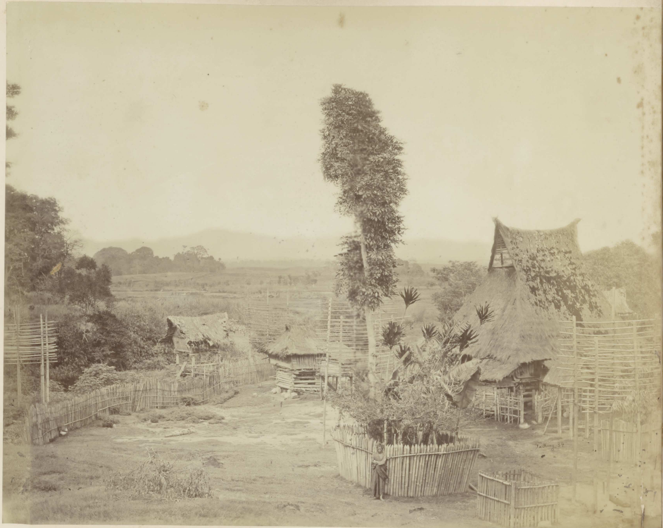
Battak Village —