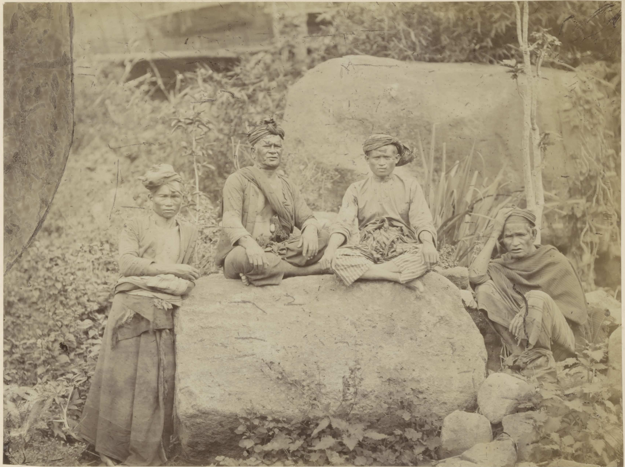
Group of Battaks at Dinging a Village at the Border of Lake Tobak.