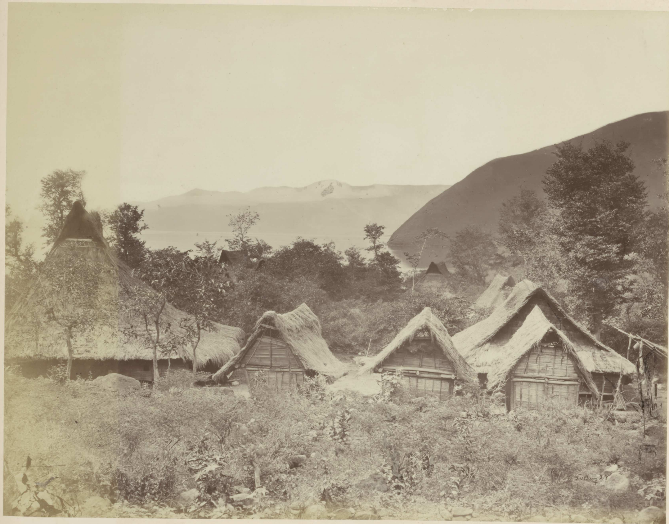
View from Dinging, Lake Tobah in the distance.