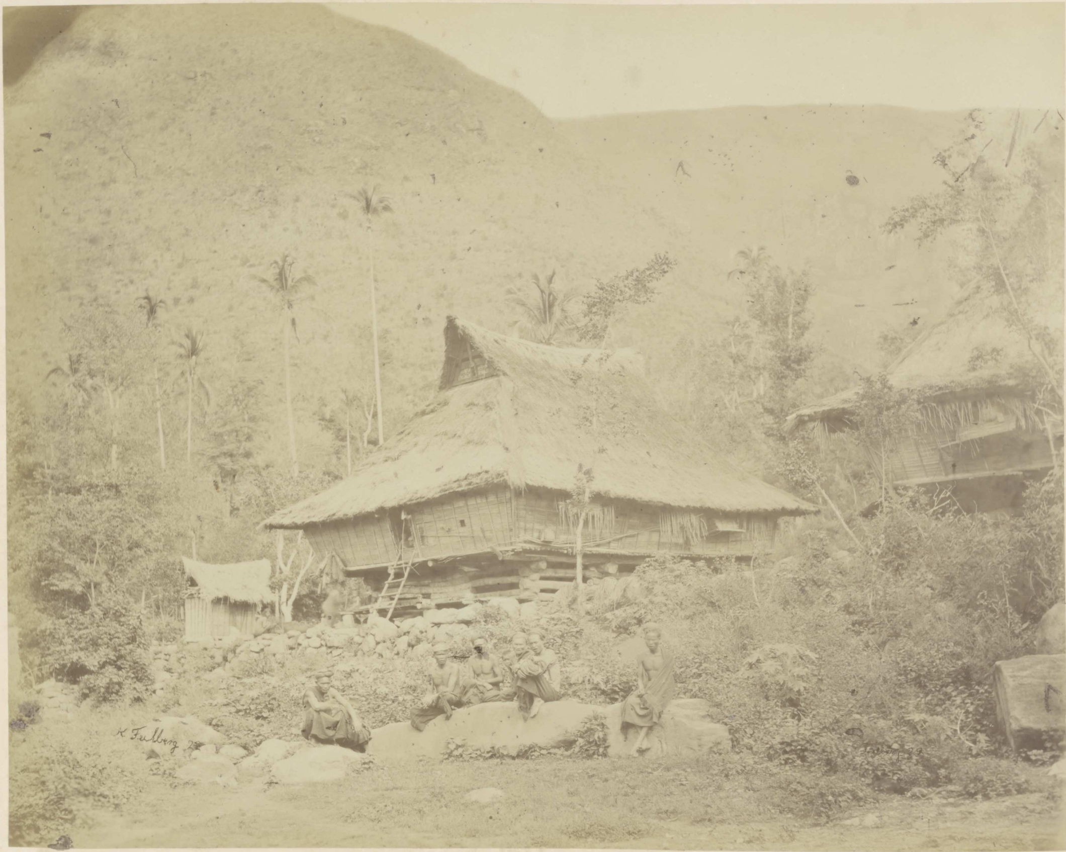
Battak House at Dinging.