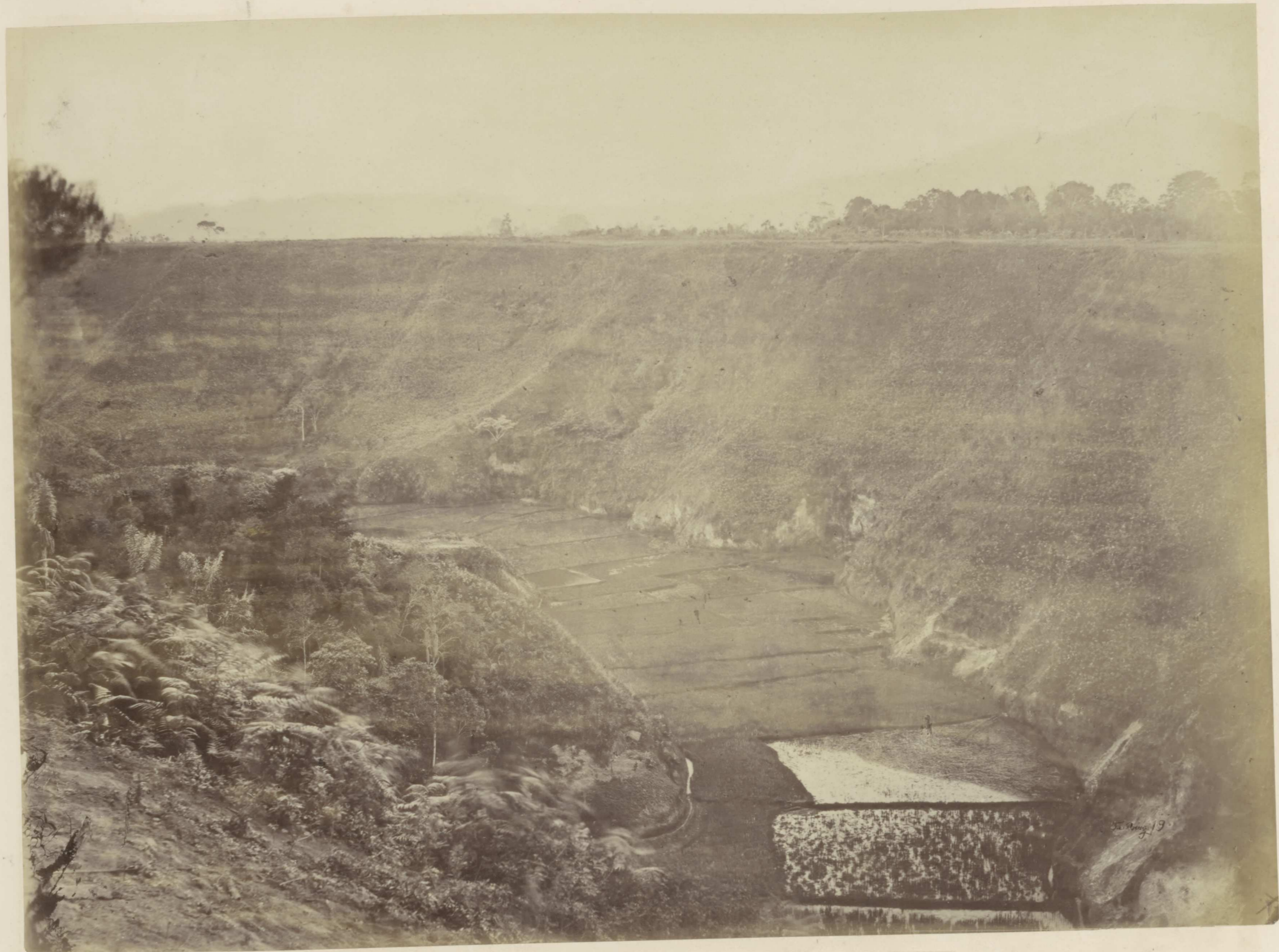
View of old Riverbeds on the Battak Plateau.