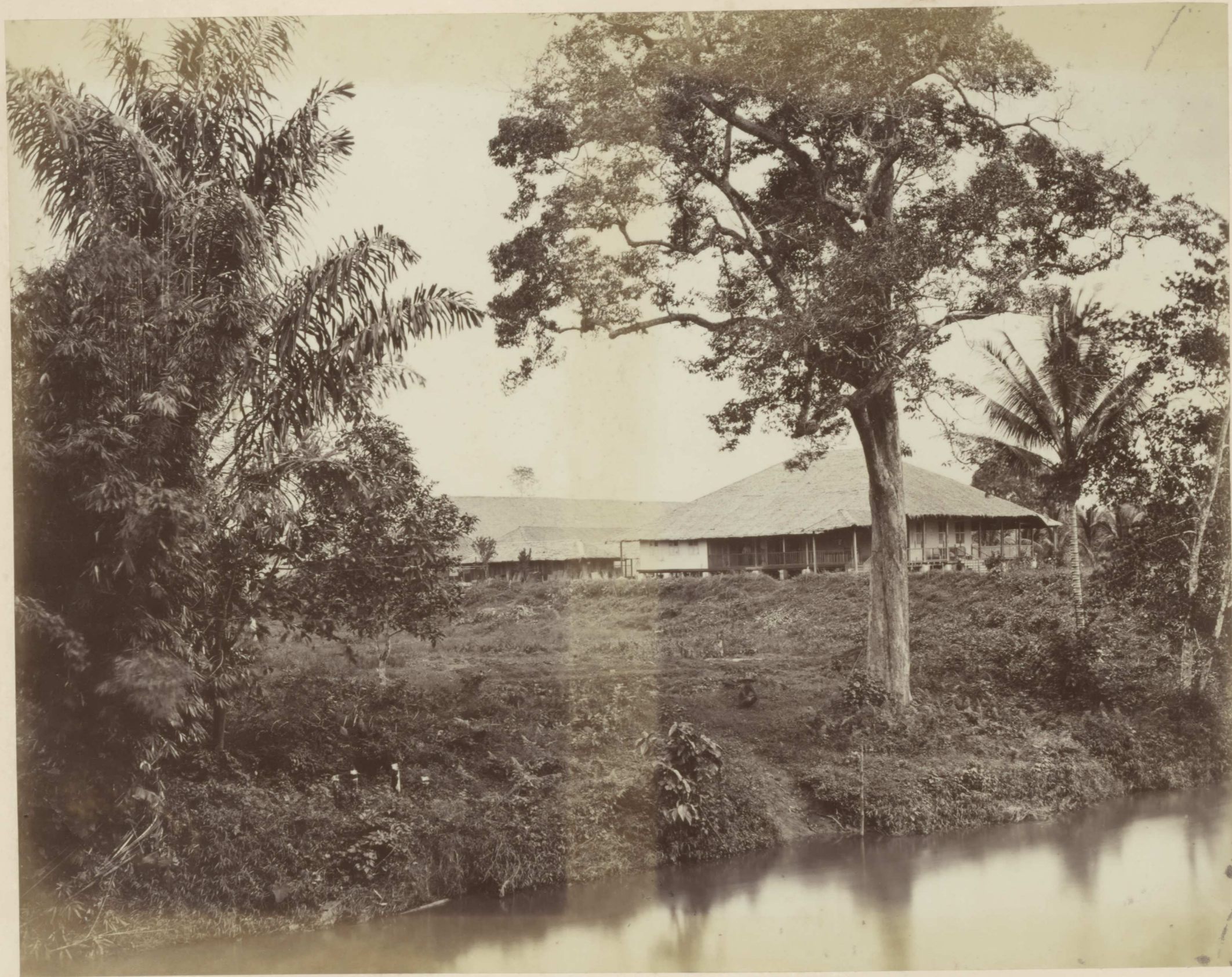
Medan Poetry belonging to the Deli Maatchappi.