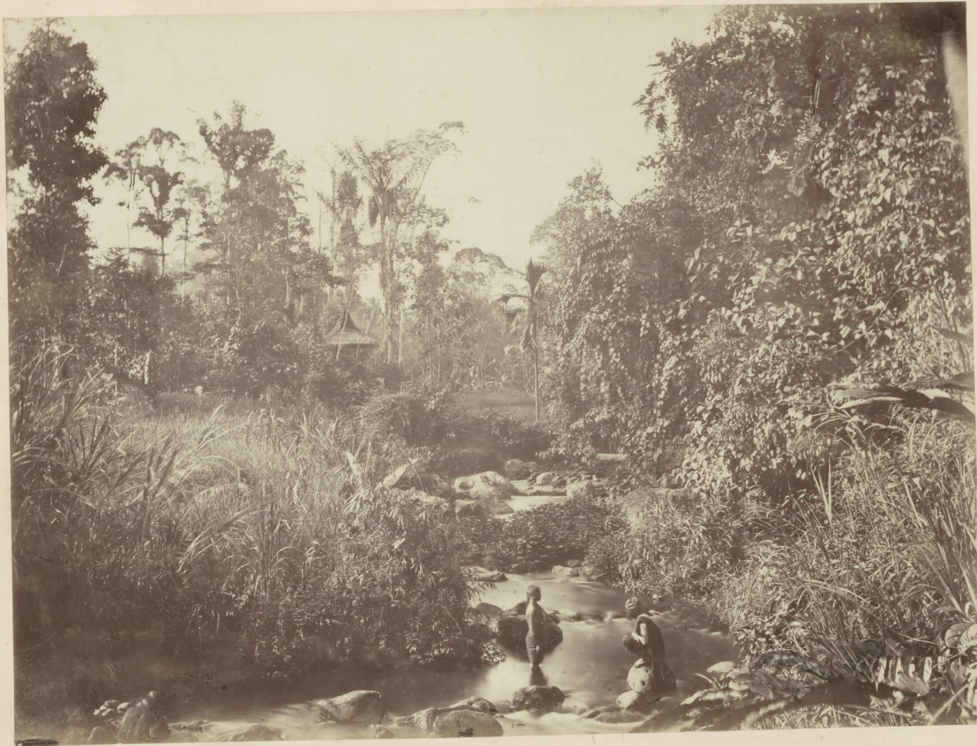
Scenery on the Road to the Battak Country.