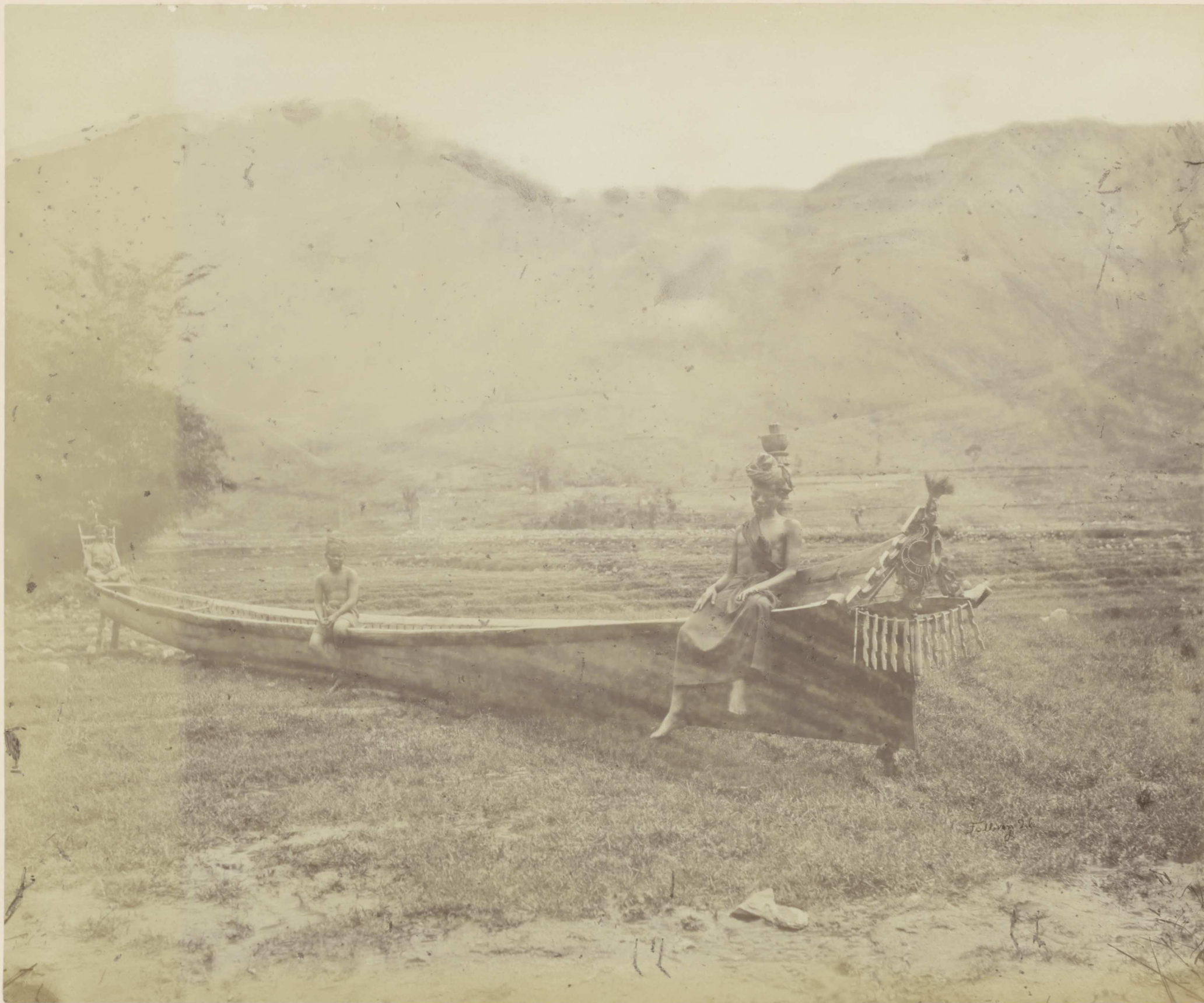
Battak Warcanoë used on Lake Tobah.