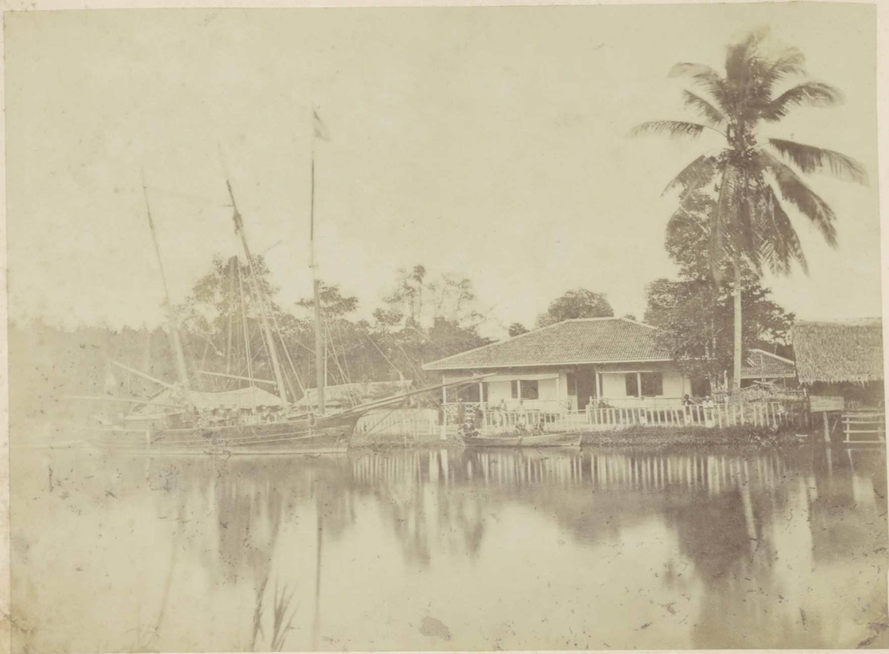
The Dutch Controllers Residence at Labuan.