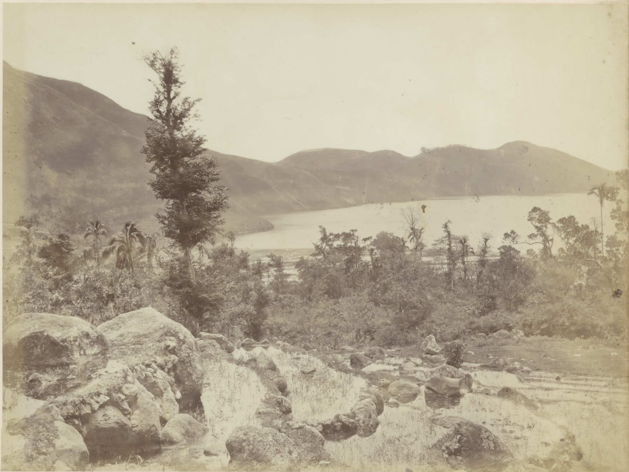
Lake Tobah —