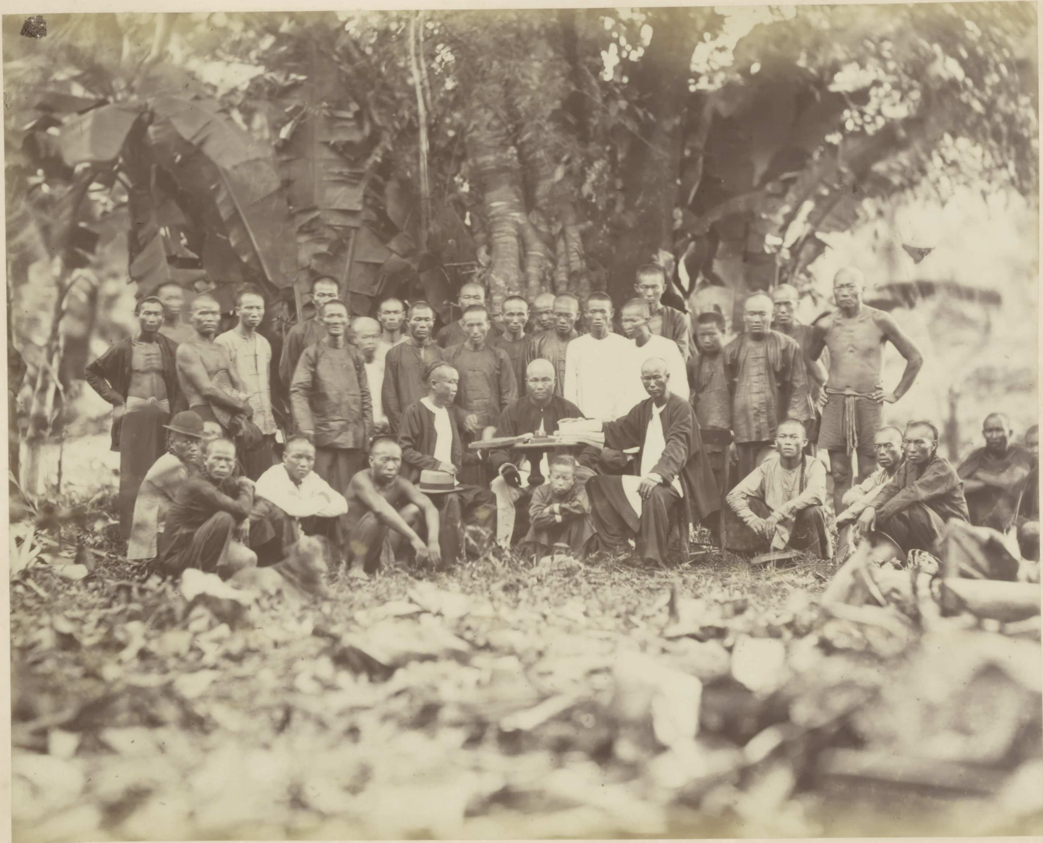
Chinese Coolies and Overseers.