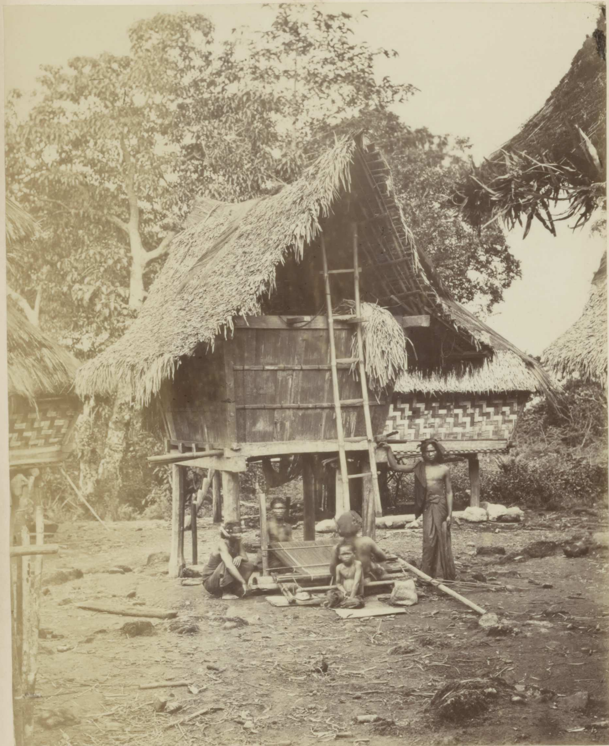
Battak Rice Magazin.