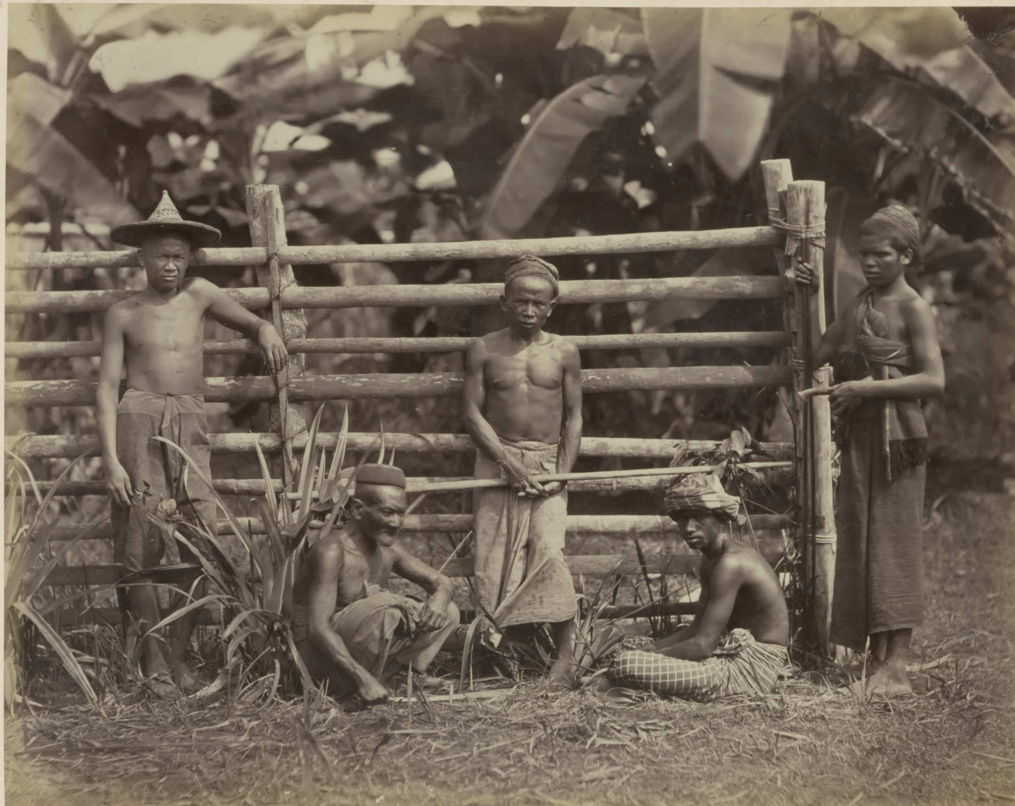
Different Labourers on Deli Plantations.