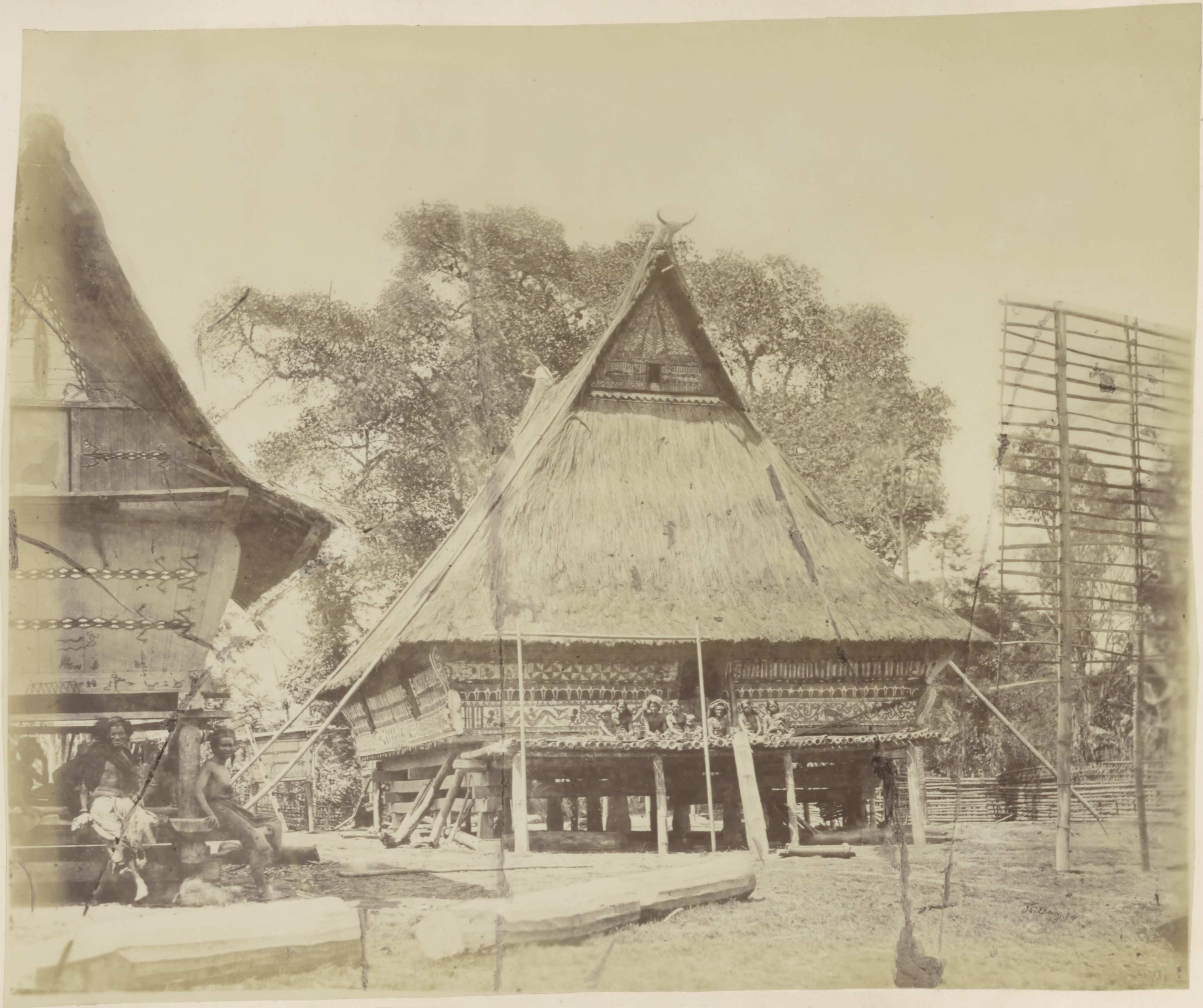
House of a Battakchief at Sebreyá.