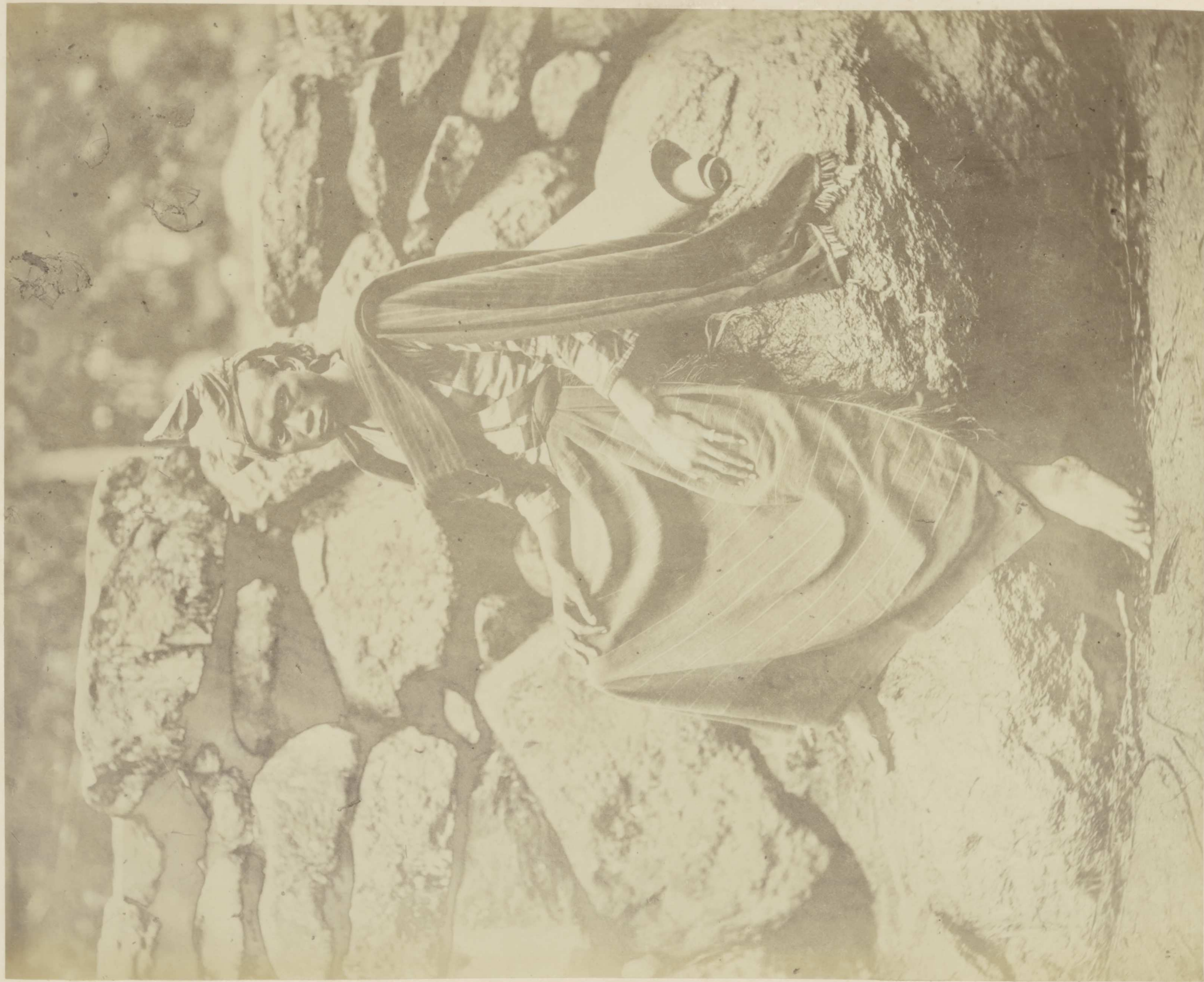
Battak Chief at Dinging.