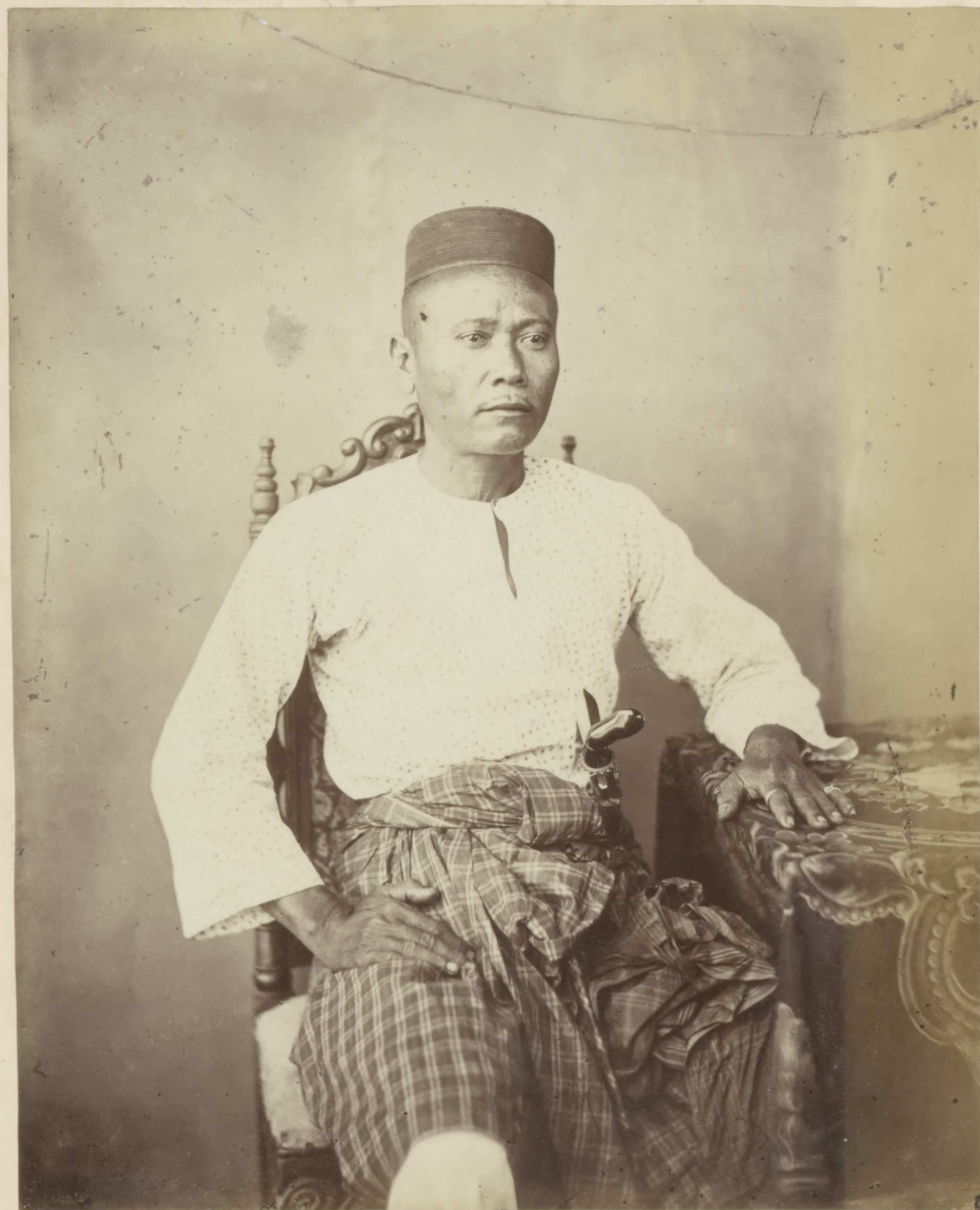
Pangehrans Orang Kaya.