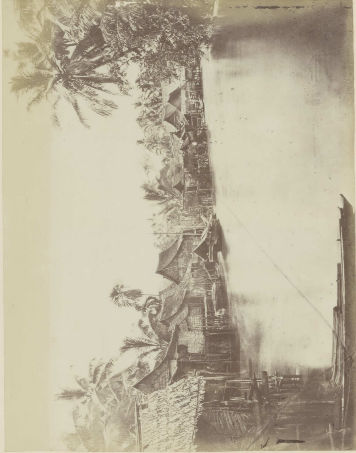
River View at Labuan.