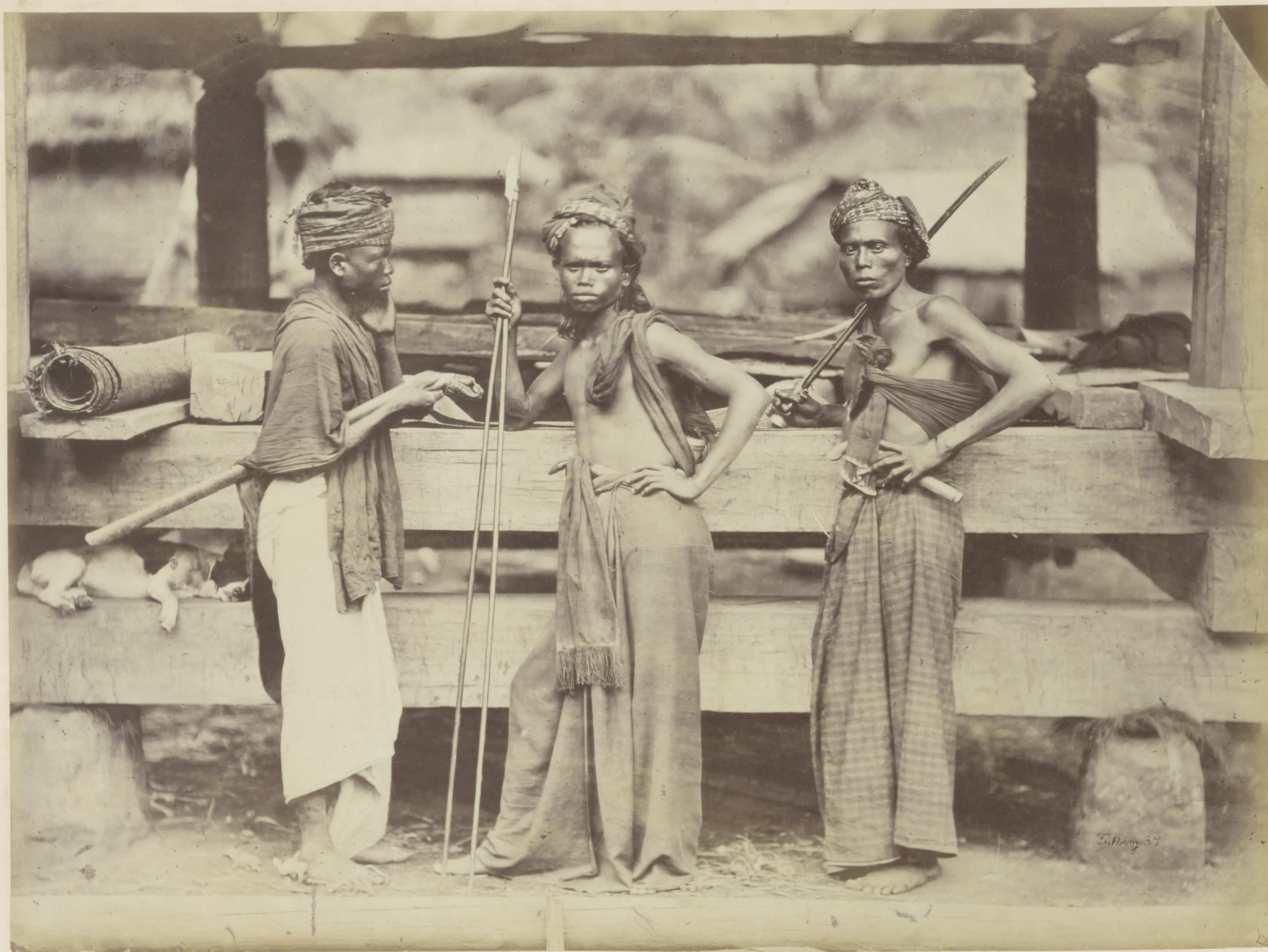
Group of Battak Warriors.