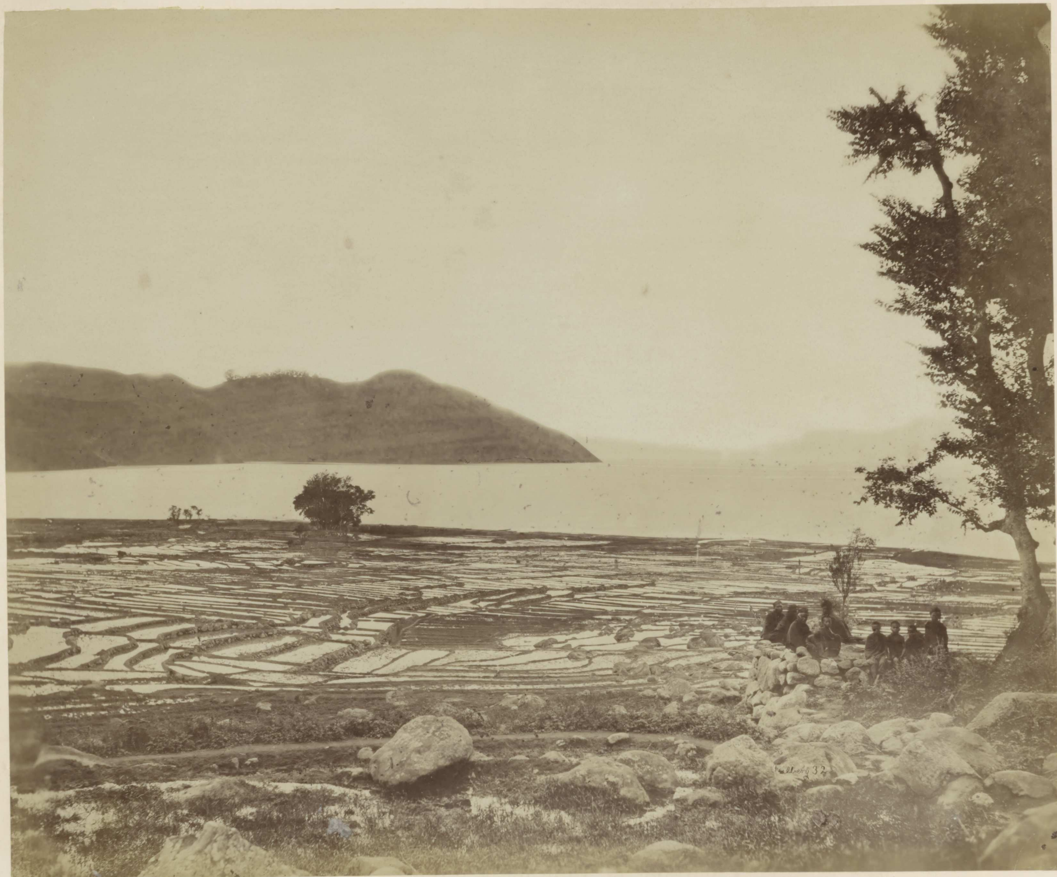
View of Lake Tobah with Ricefields in the Foreground.