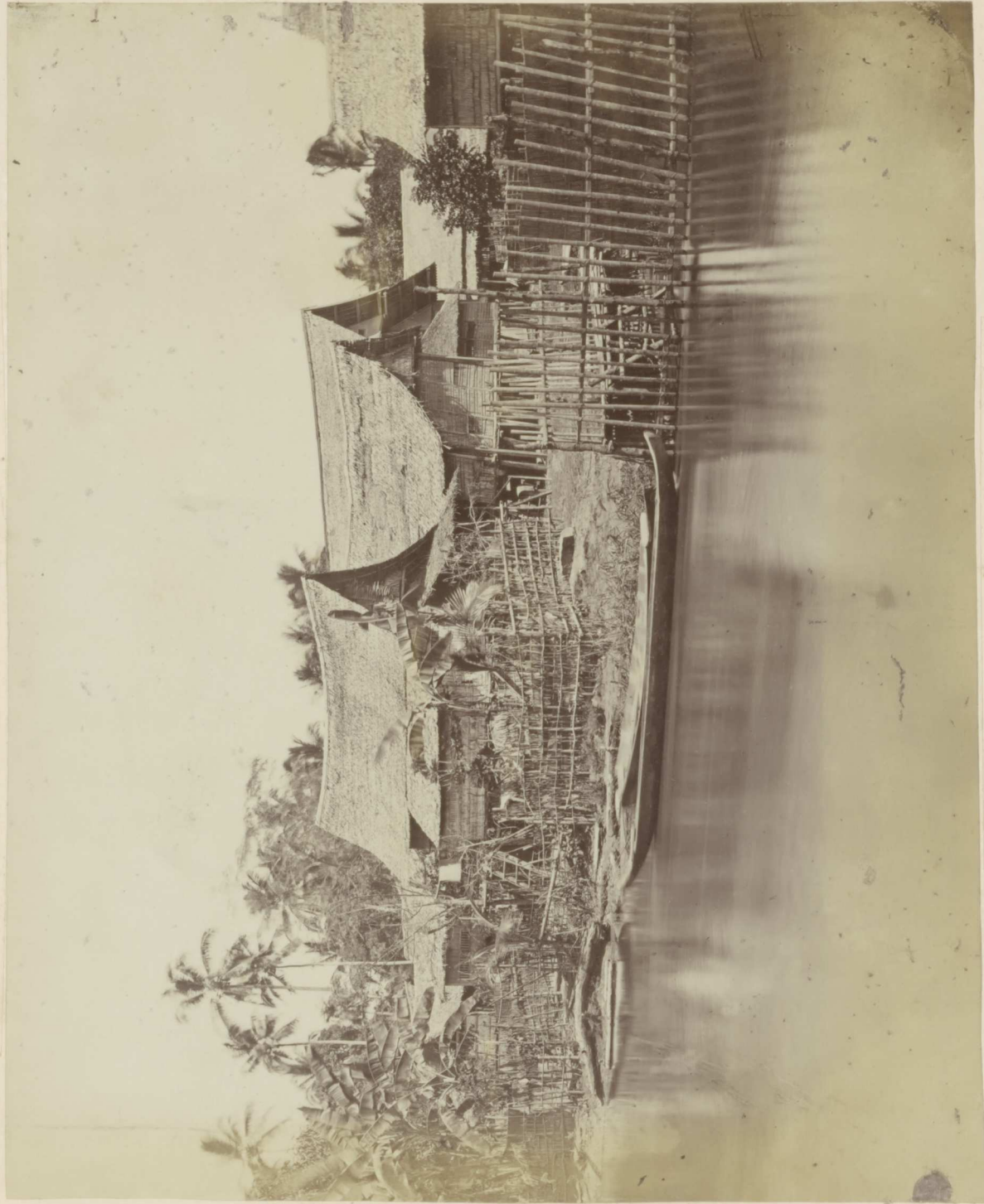
River Scenery near Labuan.