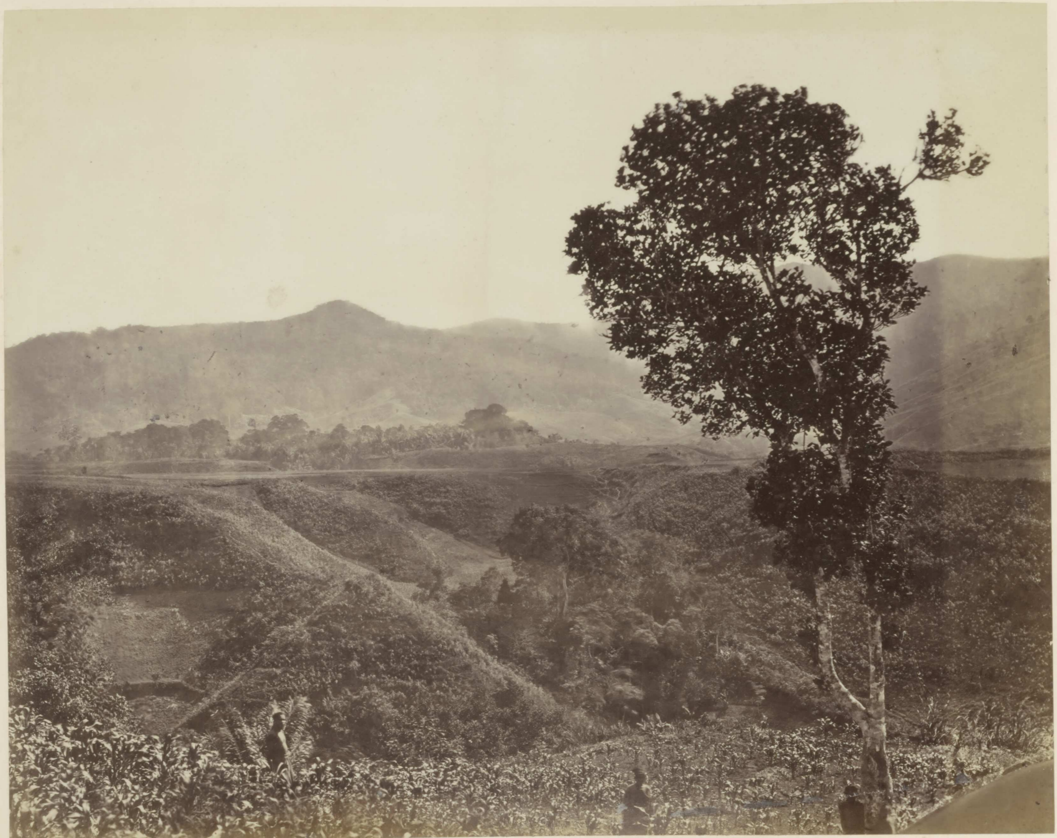
View from the Battak Plateau near Bahru Jahai.