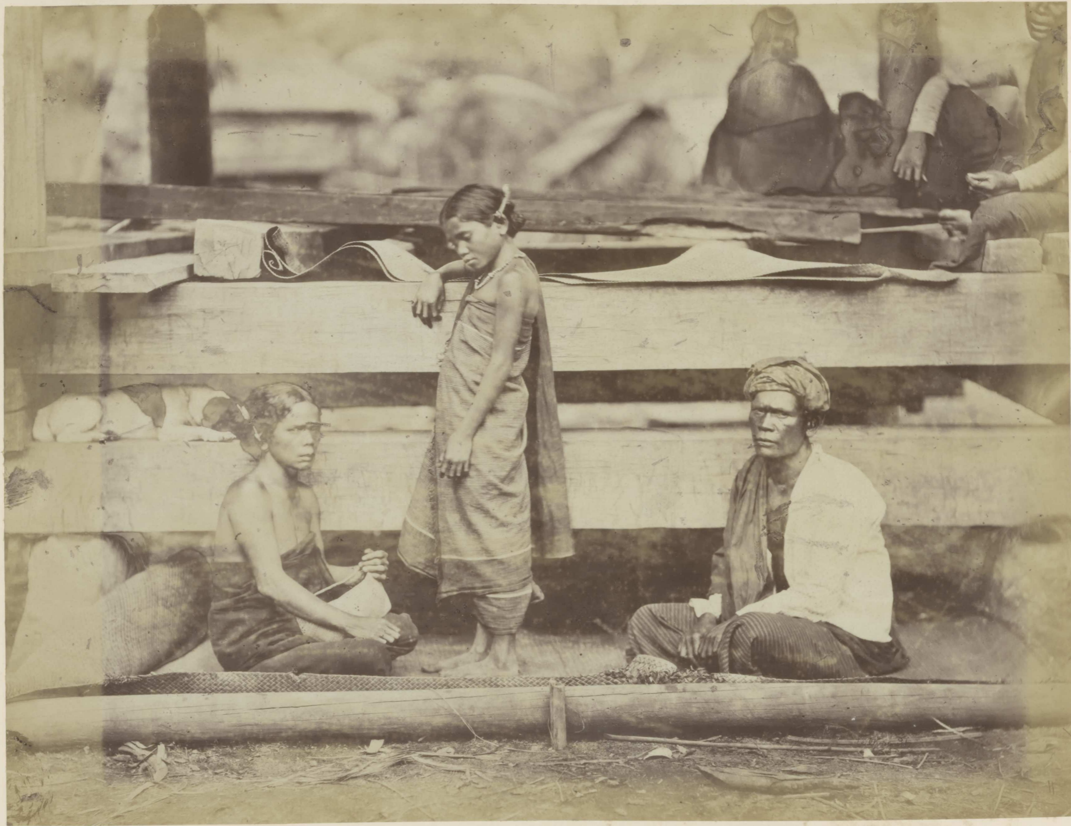
Pangulu of Buluhauer with Wife and Daughter.