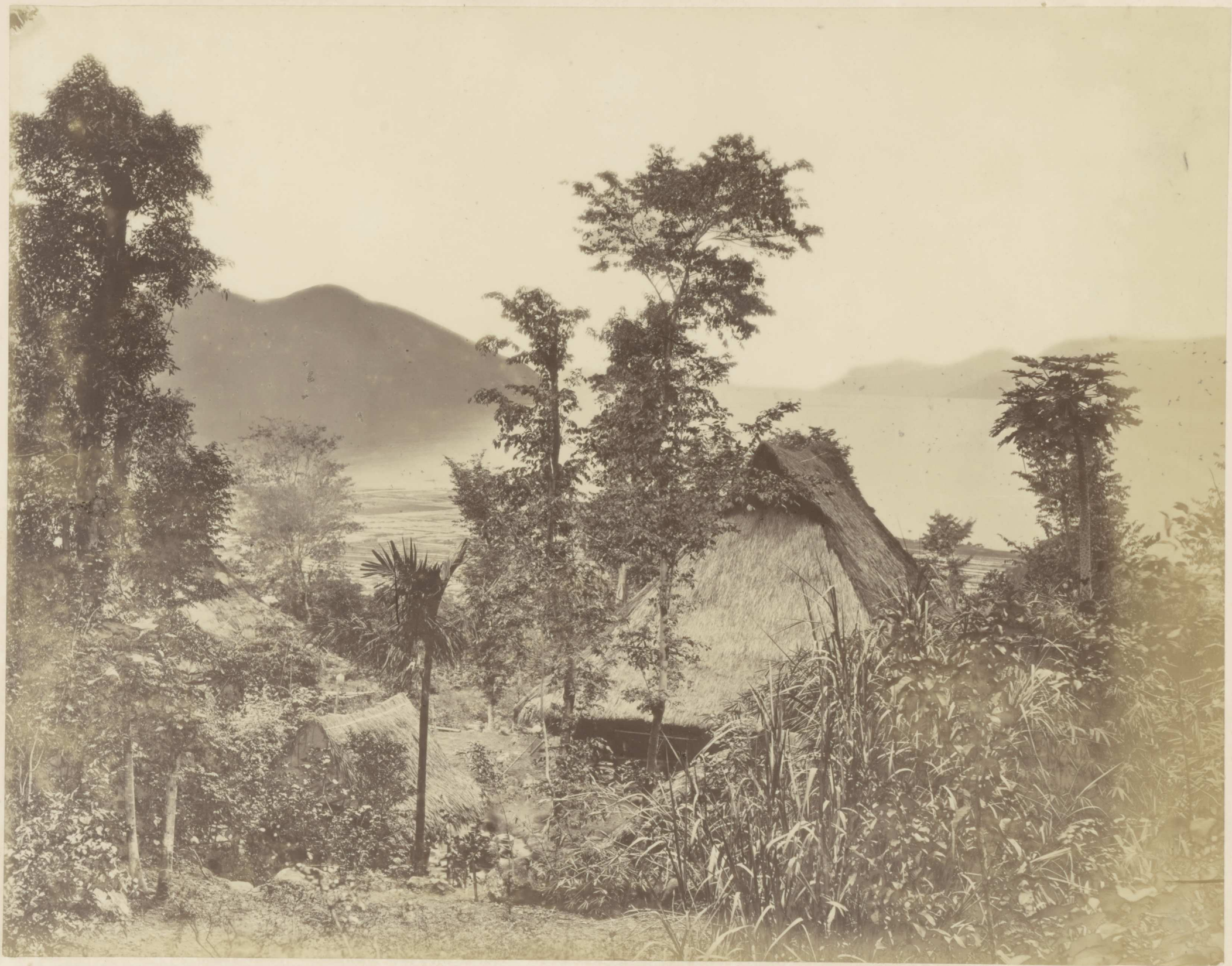
View from Dinging, Lake Tobah in the distance.