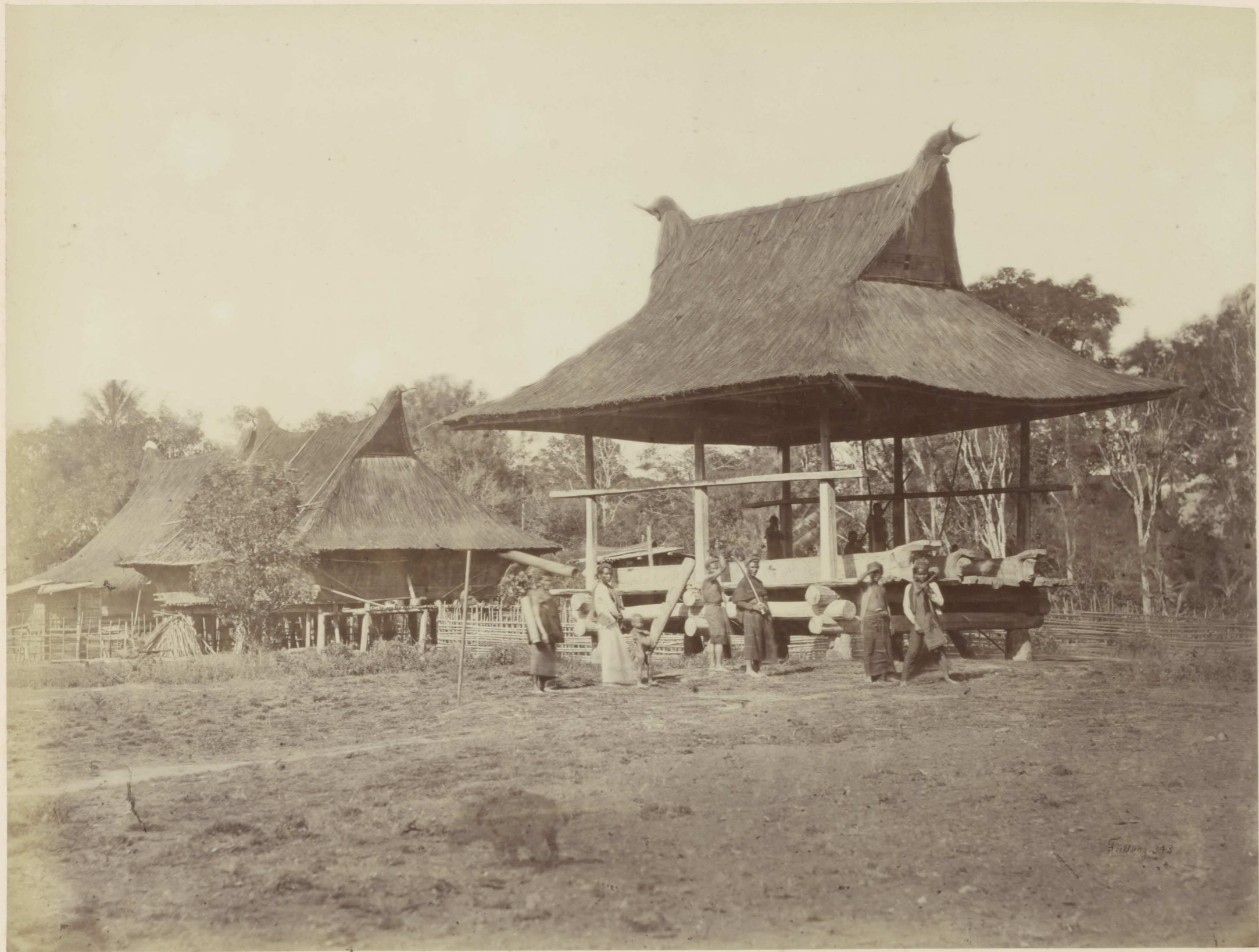
Lussung, a House where the Rice is stamped.