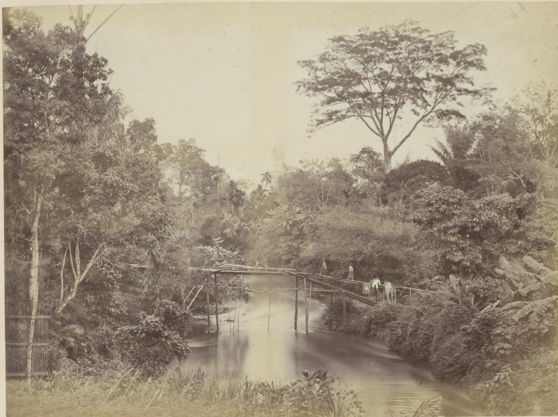
River View in Deli.