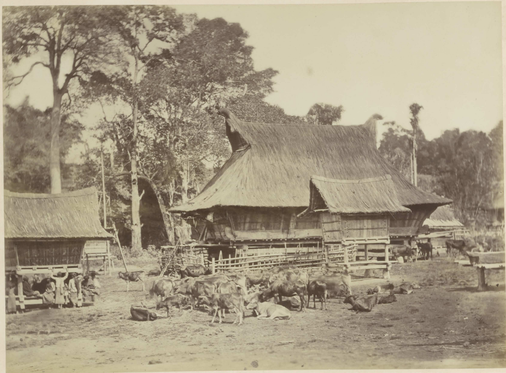
Battak Houses in Sebreya.