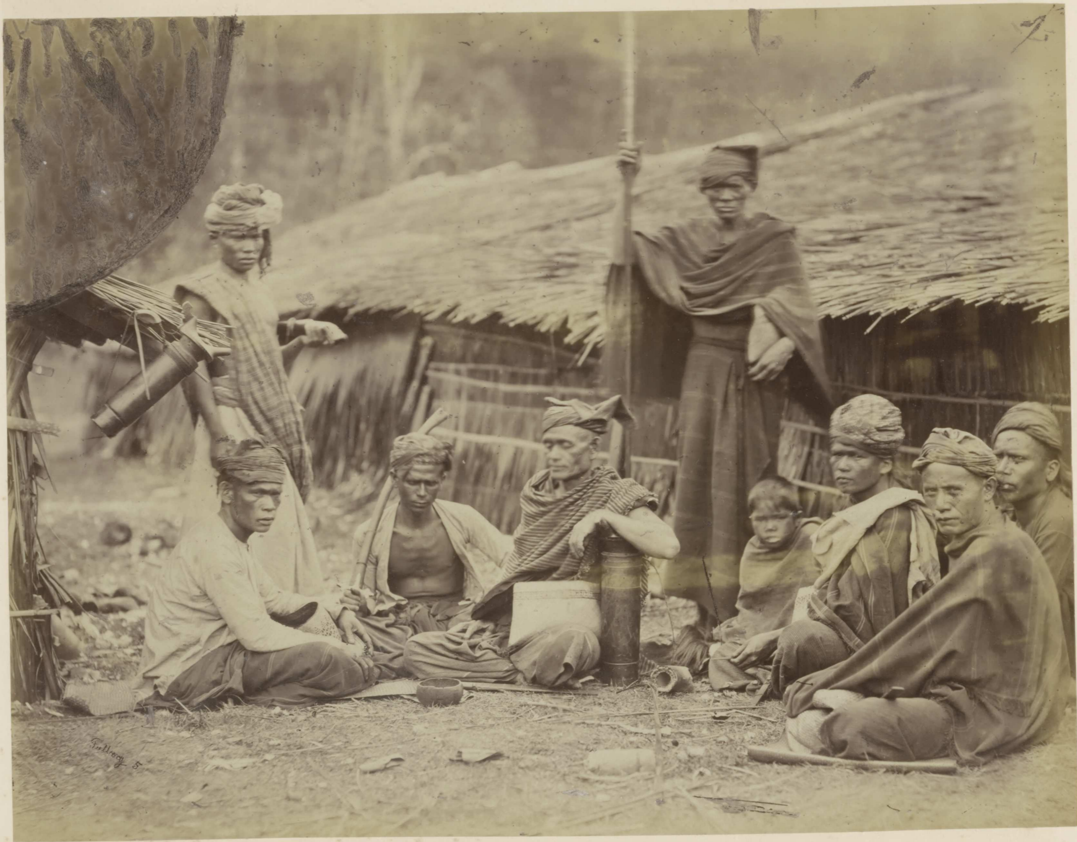
Group of Battak Chiefs.