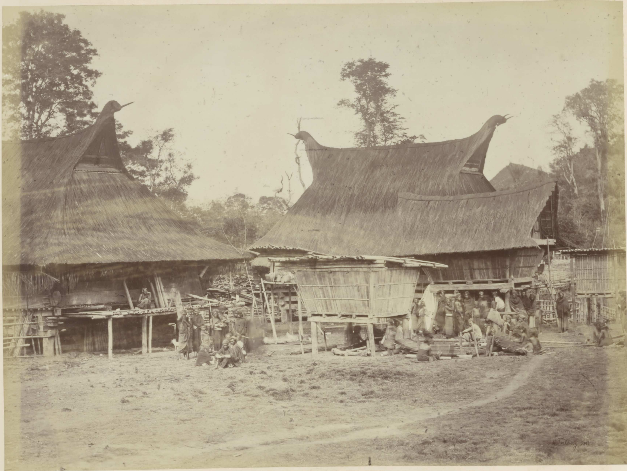
Battak Houses in Sebreyia.