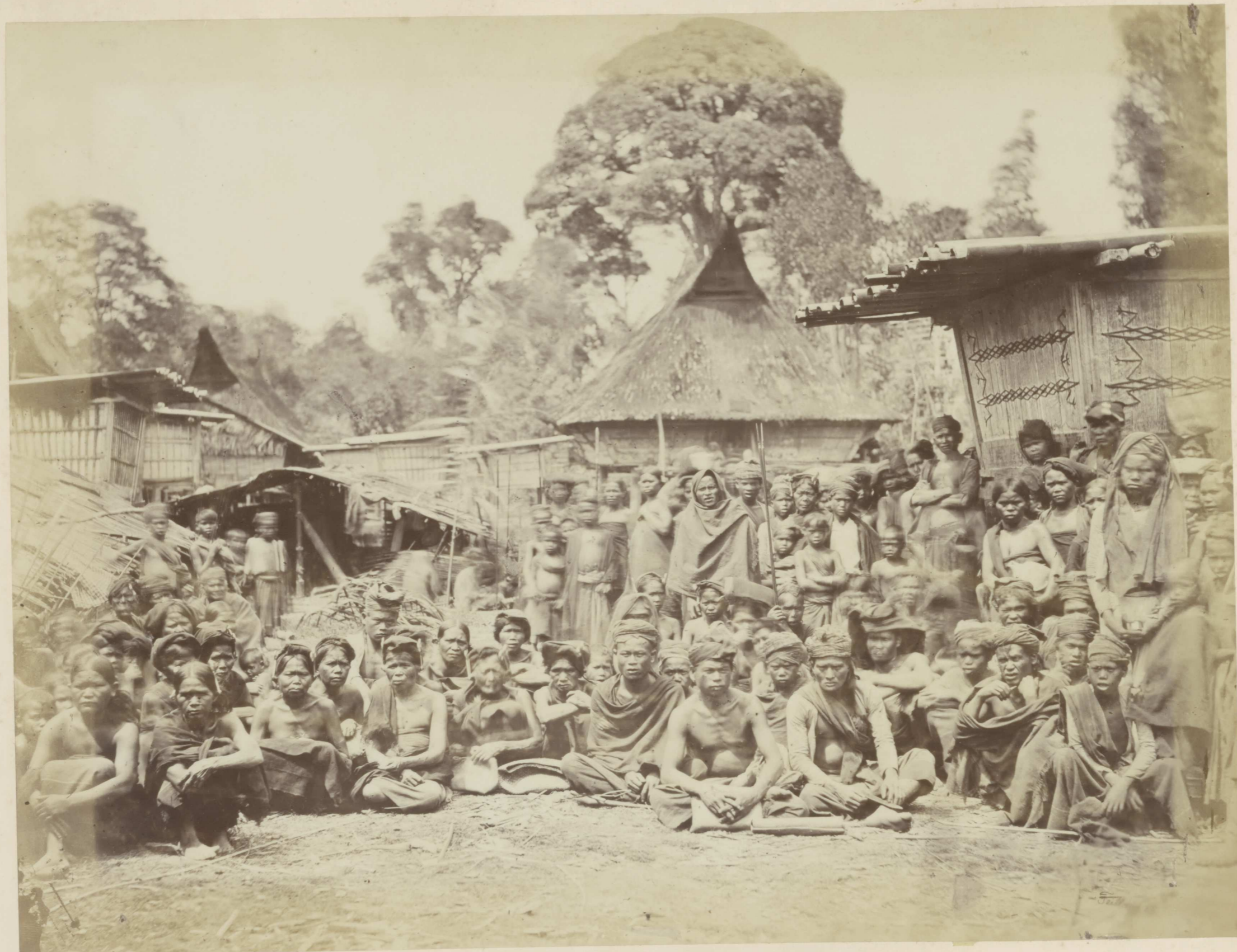
Group of Battaks at Bahru Jahai.