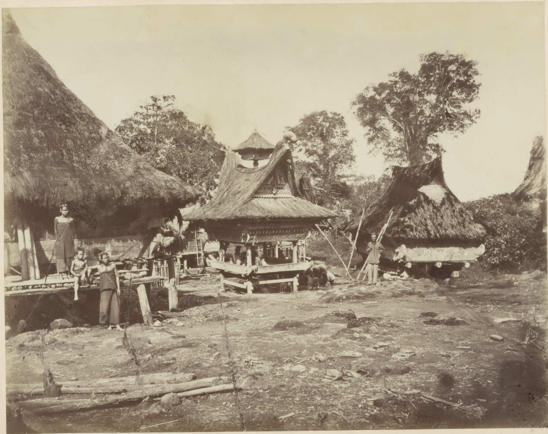
Boekum, a Battak Village.