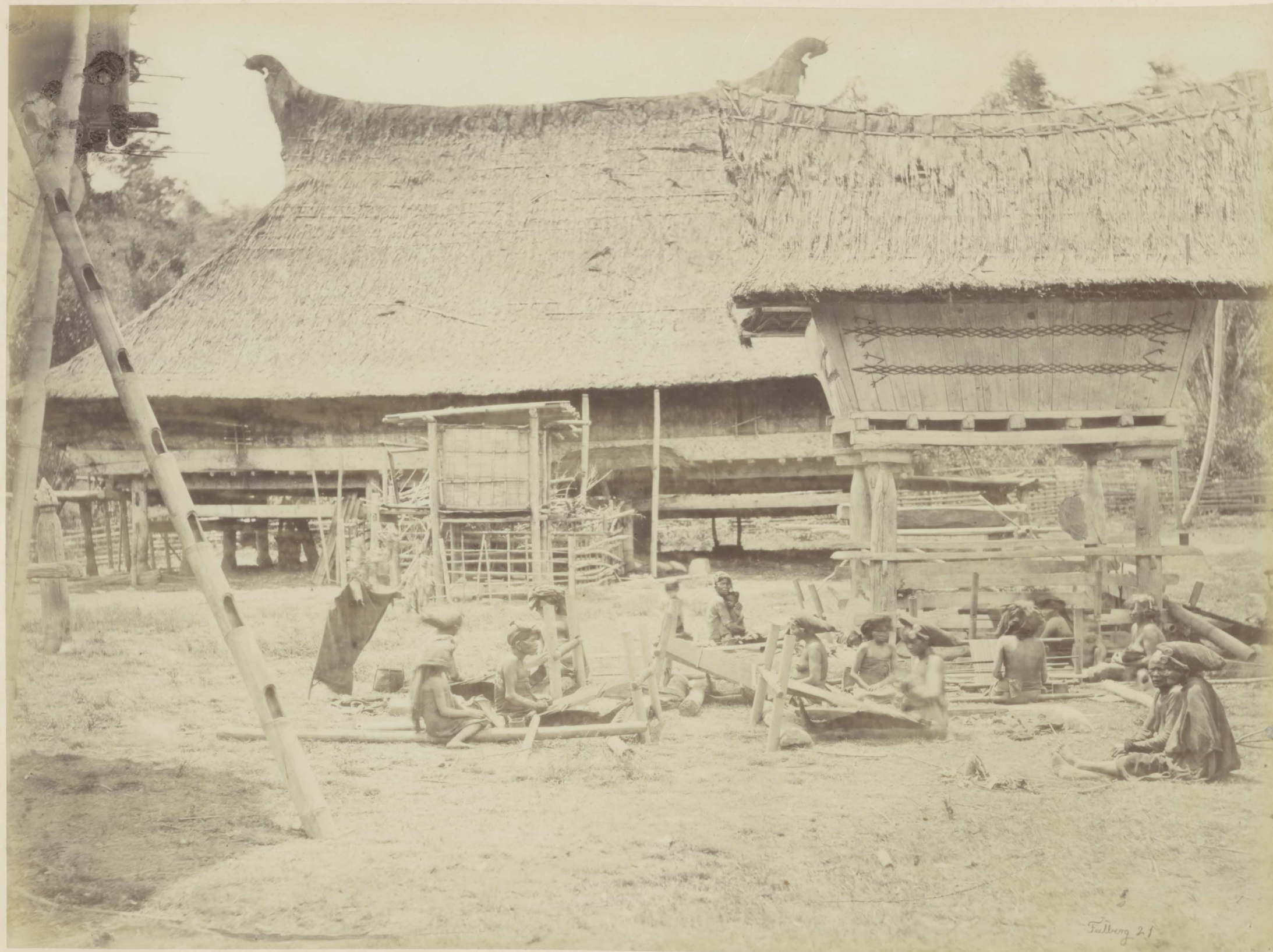
Battak Women weaving.