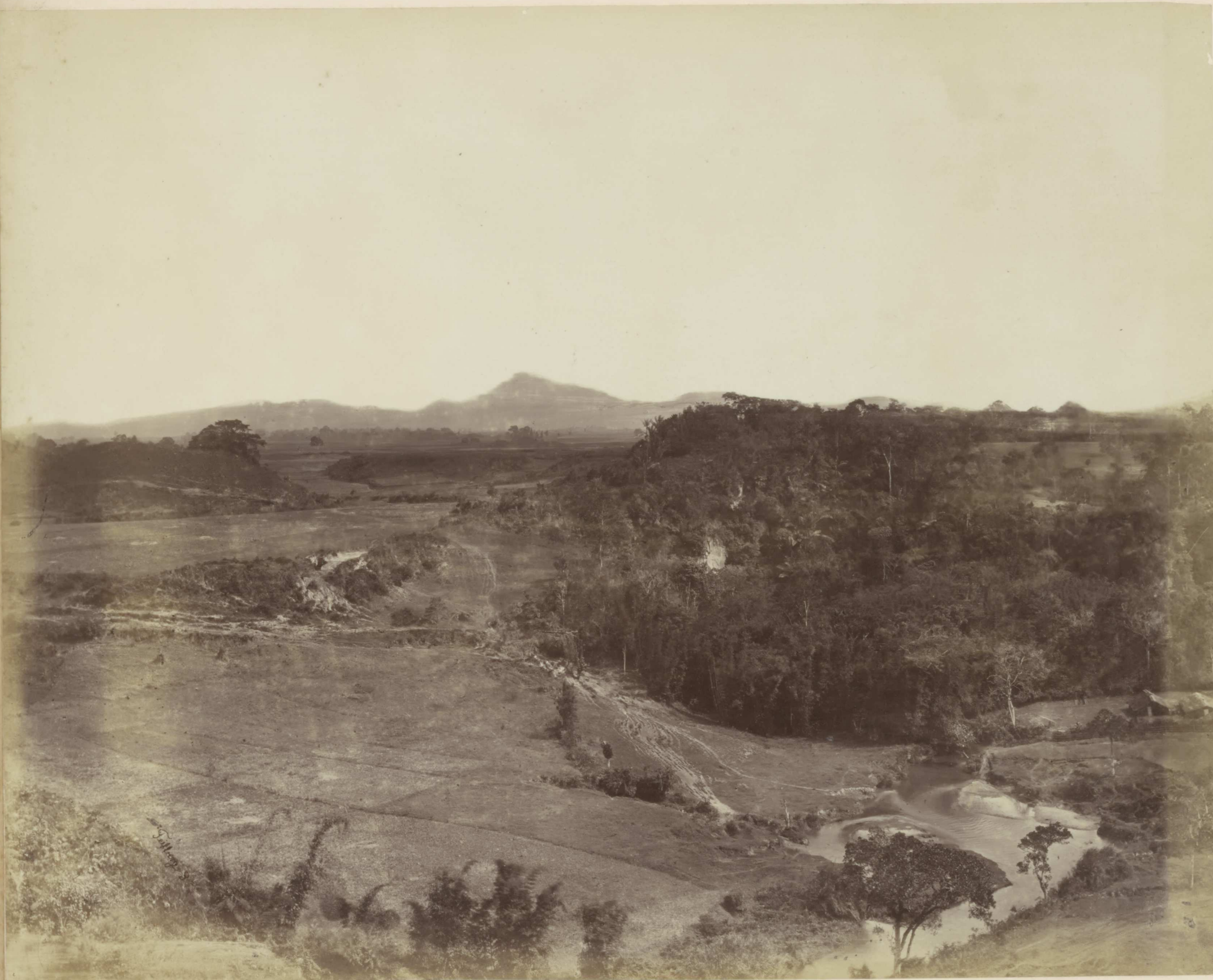
— in the distance Gunnung Snabong and Gunnung Blerang vulcanic mountains.