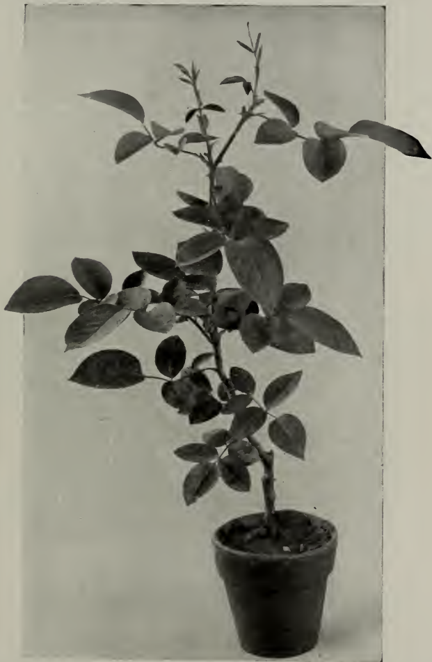
Sample Grafted, 2¼-in.

Own Root: 2¼-in., $1.50 per doz., $12.00 per 100, $100.00 per 1000.