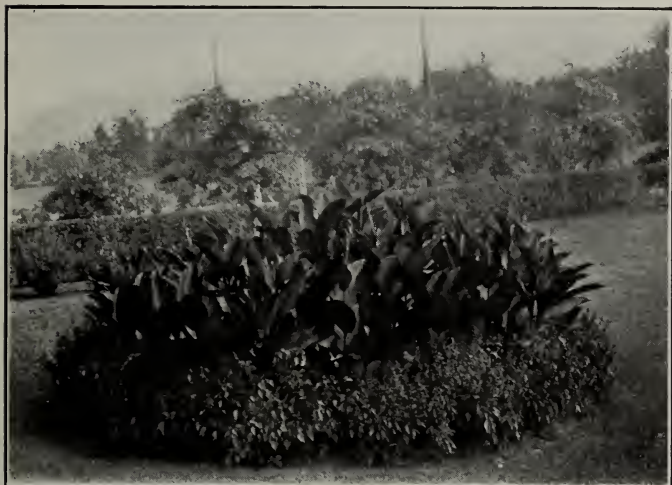
Canna Bed with Salvia

Very free Summer-blooming variety. $2.25 per 100, $20.00 per 1000.