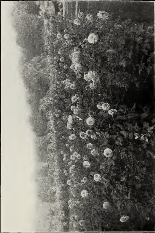
VIEW IN WAITE'S GARDENS, SHOWING LUXURIANT AND HEALTHY GROWTH