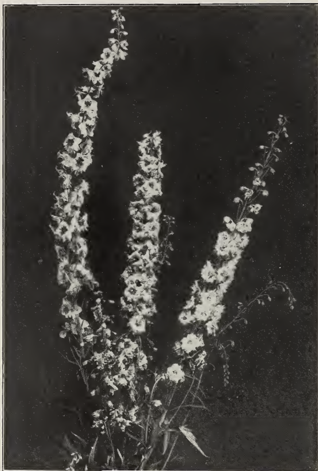
SPIKES OF DELPHINIUM

From February sown seed. Photo made August 8th