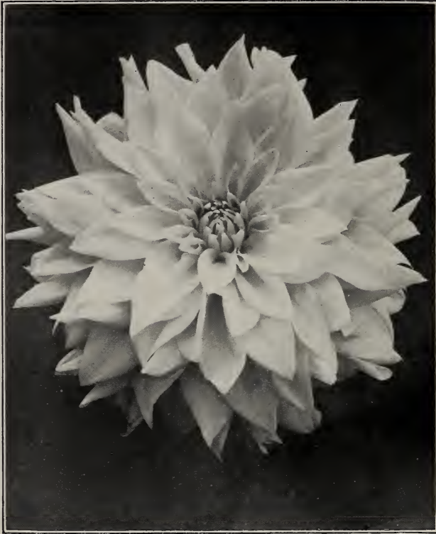
JERSEY'S DAYBREAK A very fine exhibition Dahlia