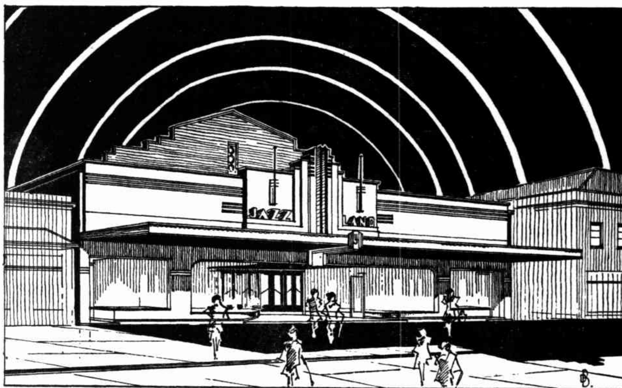
Perspective of a block of shops, arcade and dance palais in course of construction at Coolangatta. The building will replace the "Jazzland" dance palais.

severe modern design, with walls faced with "Masonite" flush-jointed with horizontal beading, and plaster enrichment to the ceilings of the seating annexes, cloak rooms and toilets. The ceiling to the hall proper has banded "Tentest" and open ornamental grilles for ventilation, the lighting being kept flush with the ceiling. Auxiliary lighting includes inverted cones applied to the structural columns of the hall and capable of two-colour combination control, giving the effect of nollow supports.