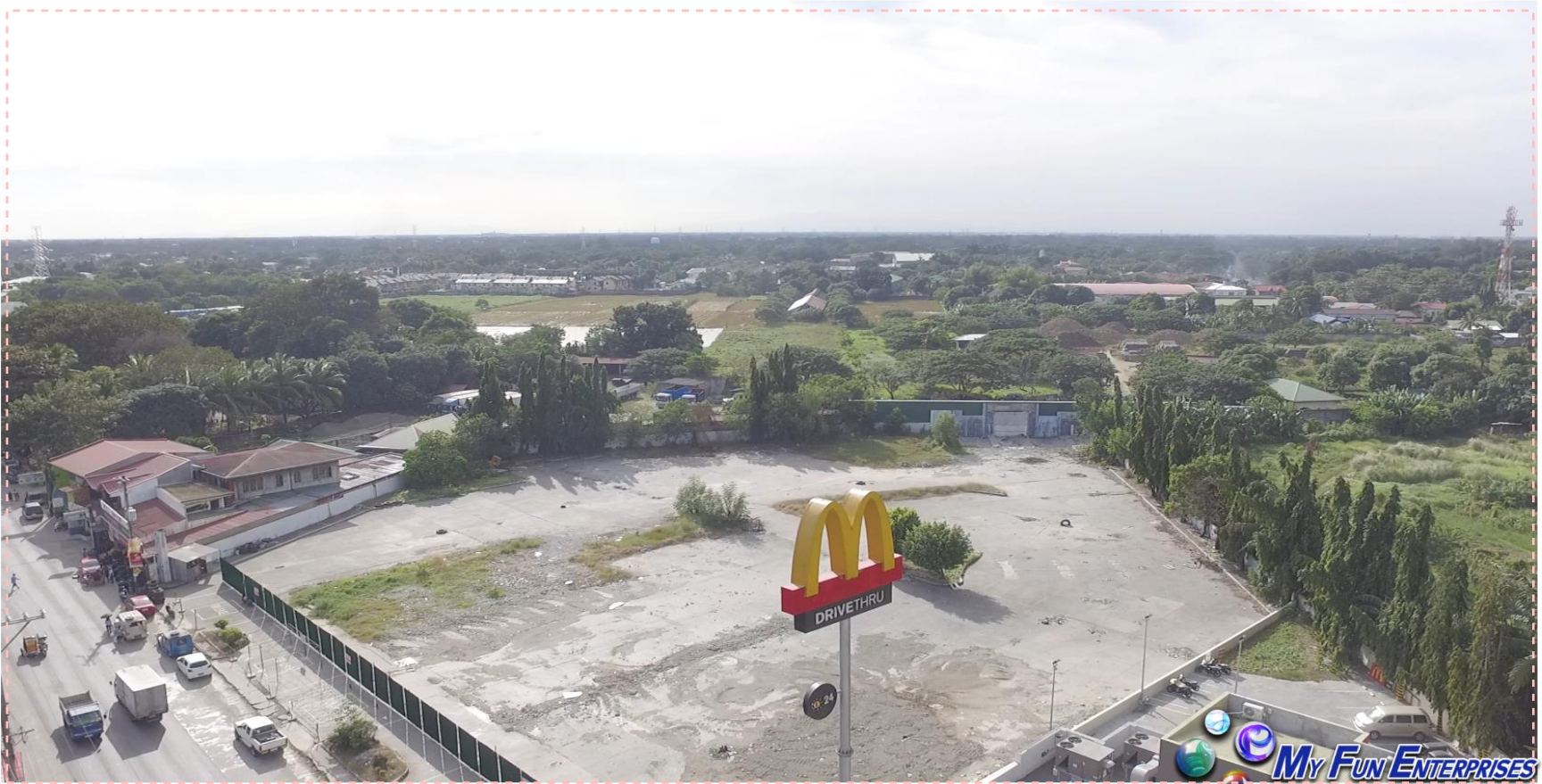
Cagayan Valley Road, Plaridel, Bulacan PHILIPPINES