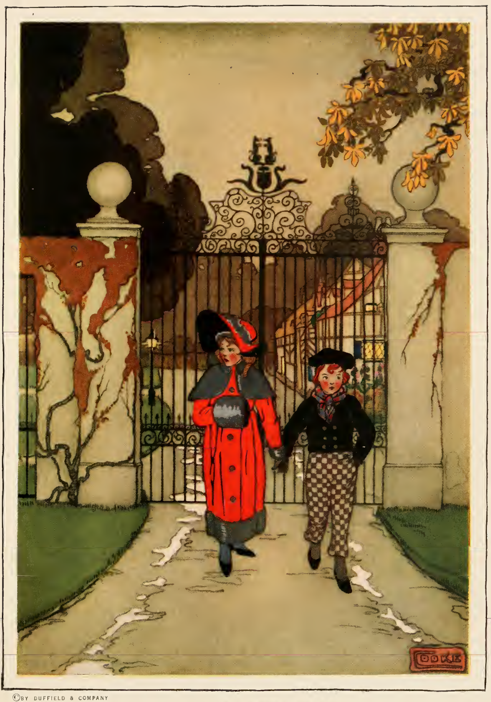
"Then it must be this way," said Floss.