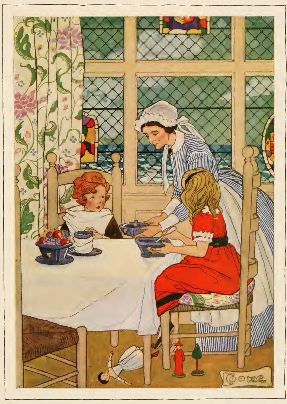
OBY DUFFIELD & COMPANY

"So Floss and Carrots ate their bread and milk in undiminished curiosity." See Page 206 \,