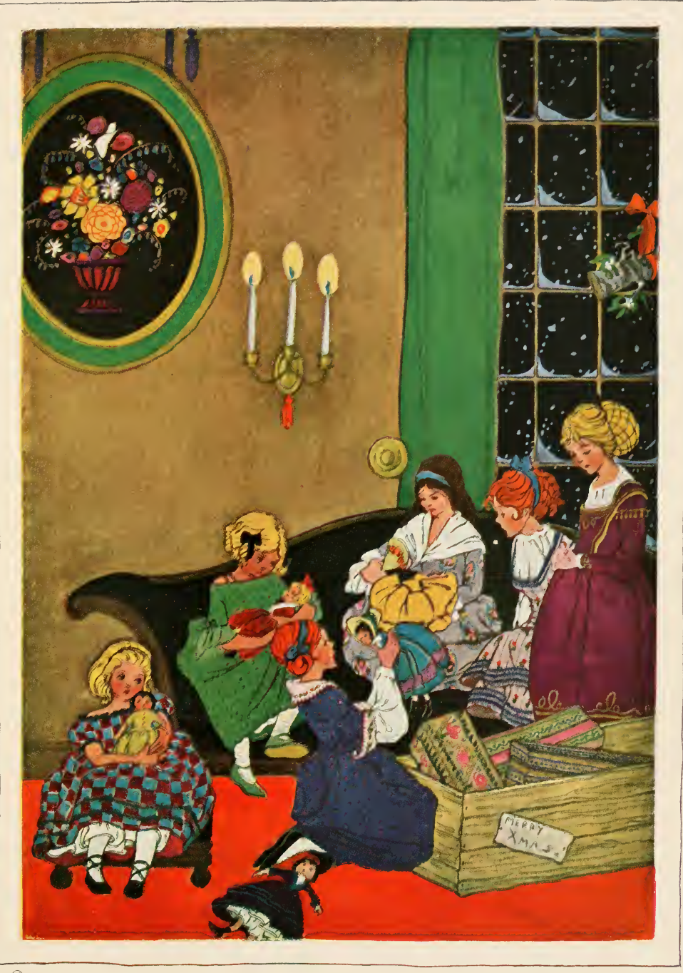
OBY DUFFIELD & COMPANY