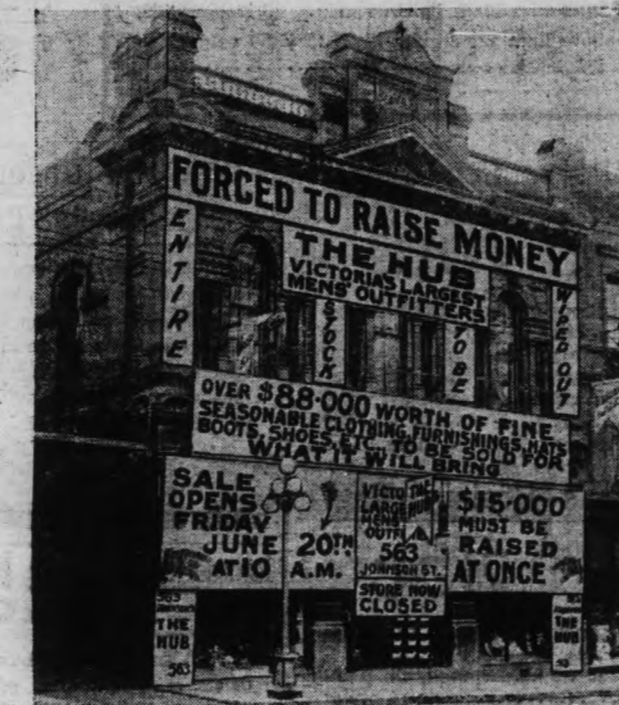
LOOK FOR THIS STORE

Lace Boots, every pair guaranteed for good wear. Many of this lot are worth $3.00. Forced price $1.45 Boots for business wear, that mean service and comfort. All the newest shapes. Worth to $3.50. $1.95