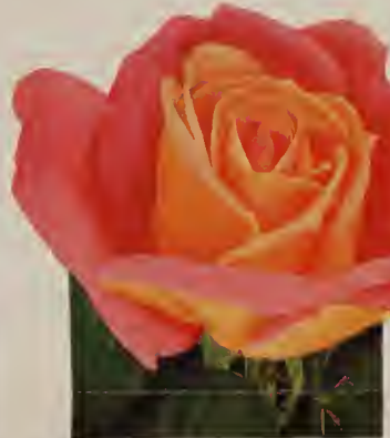
President Herbert Hoover