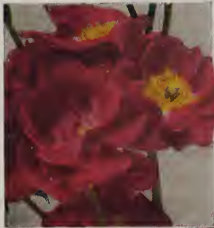
Miss Edith Cavell