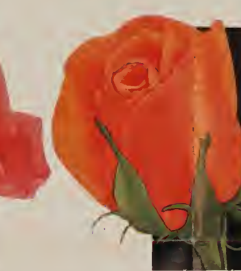
Duquesa de Penaranda