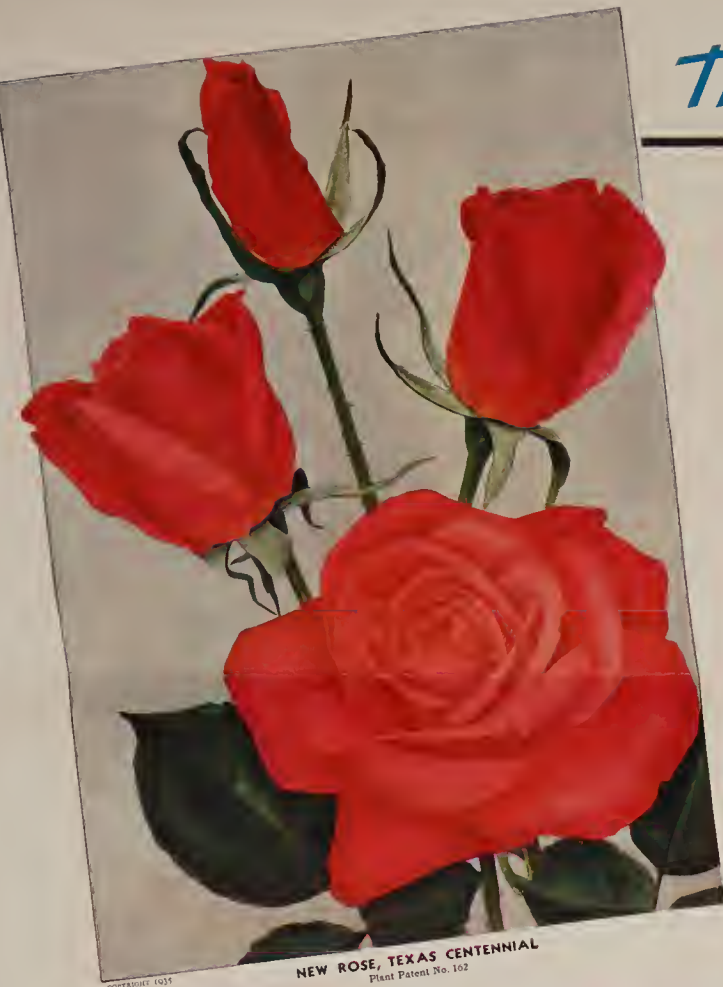
NEW ROSE, TEXAS CENTENNIAL Plant Patent No. 102

D IXIE ROSES are real Roses, grown as Rose plants should be grown, watched and tended all through their growing-up period as carefully as the plants in your own garden. That is why we are able to say "The Finest Roses Come from Dixie."