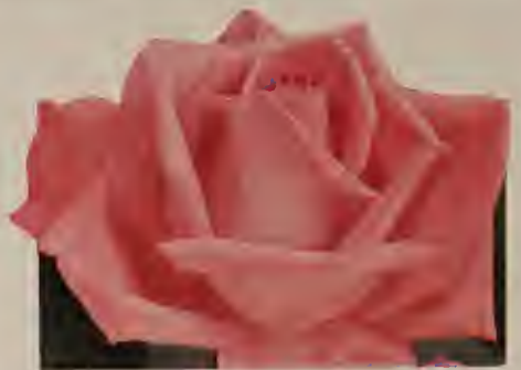
Dame Edith Helen

If you have never planted Dixie Roses, try them this fall and we believe you will agree next summer that "The Finest Roses Come from Dixie."