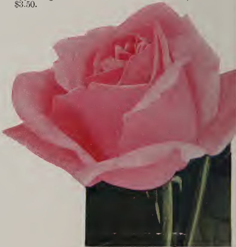
Cl. Rose Marie

Silver Moon. Dazzling white flowers with a mass of golden stamens. Each 35c; doz. $3.50.