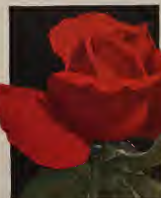
Etoile de Hollande