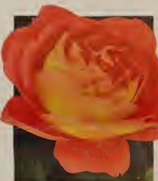
Condessa de Sastago