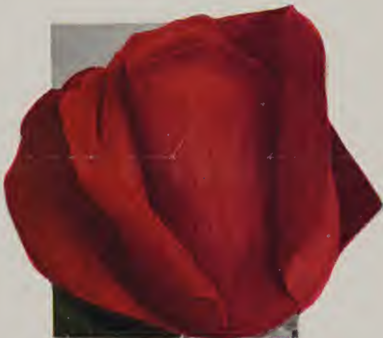
Countess of Stradbroke