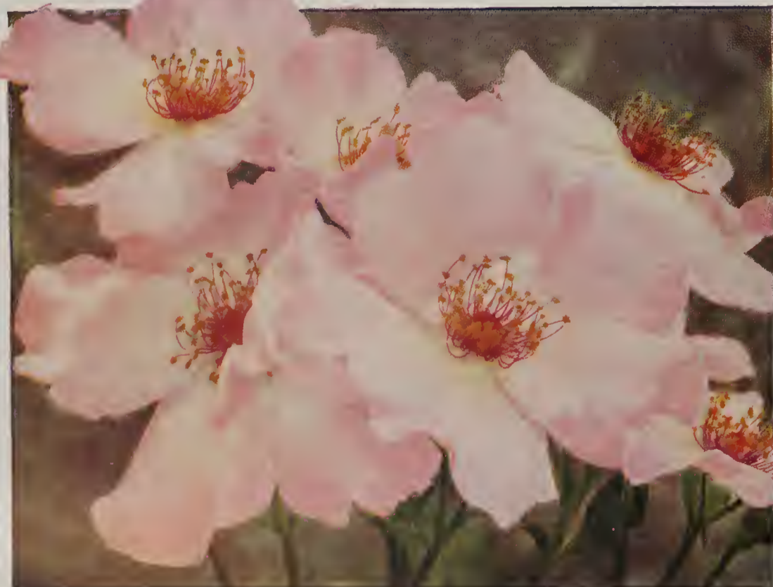
Climbing Dainty Bess

We will ship prepaid to any point in the U. S. any ten 50-c Roses and any ten 35-c Roses (20 in all) for only $7.