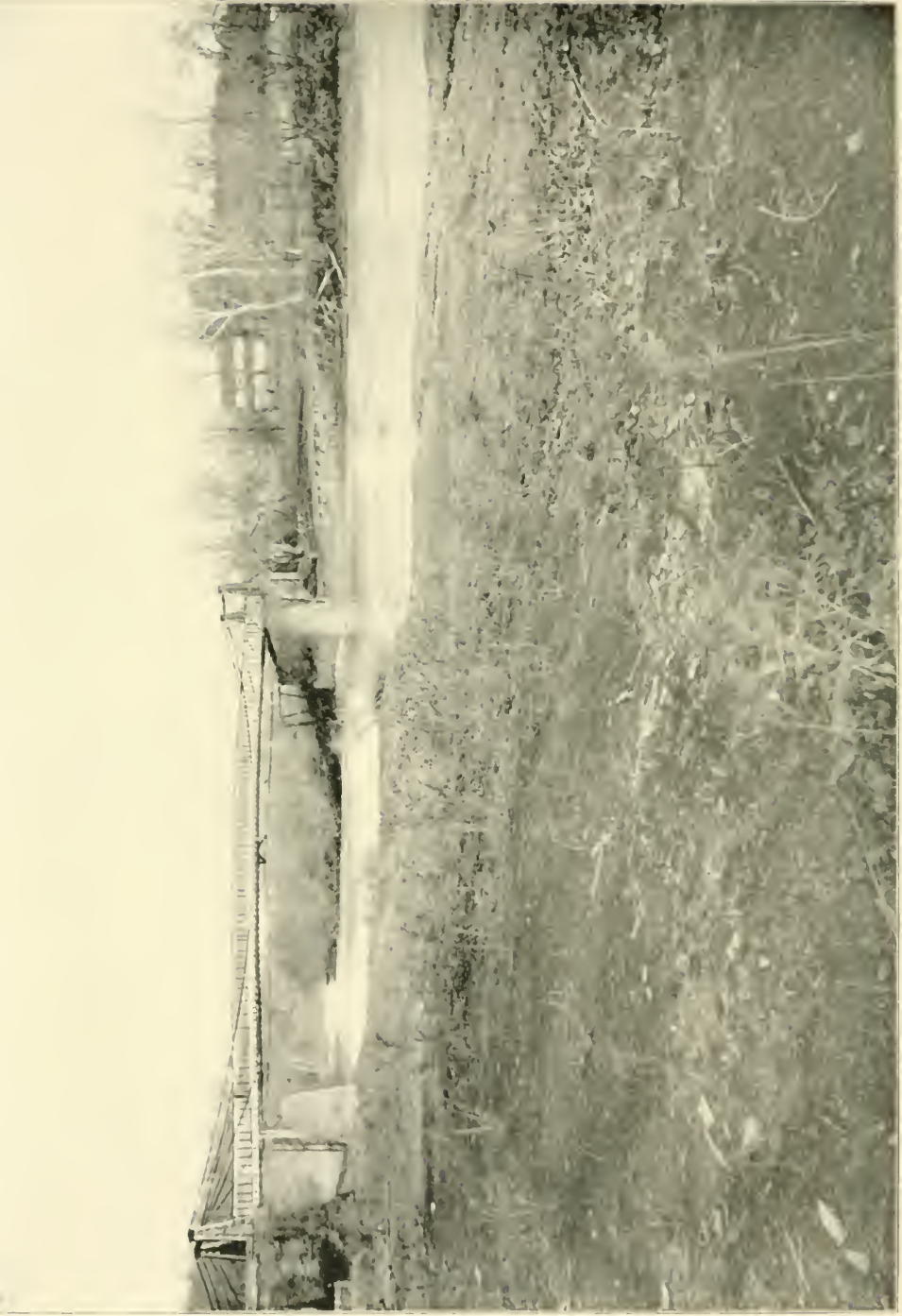
The ford of the Licking, from which the Indians were first seen and where the Kentuckians crossed to engage them.