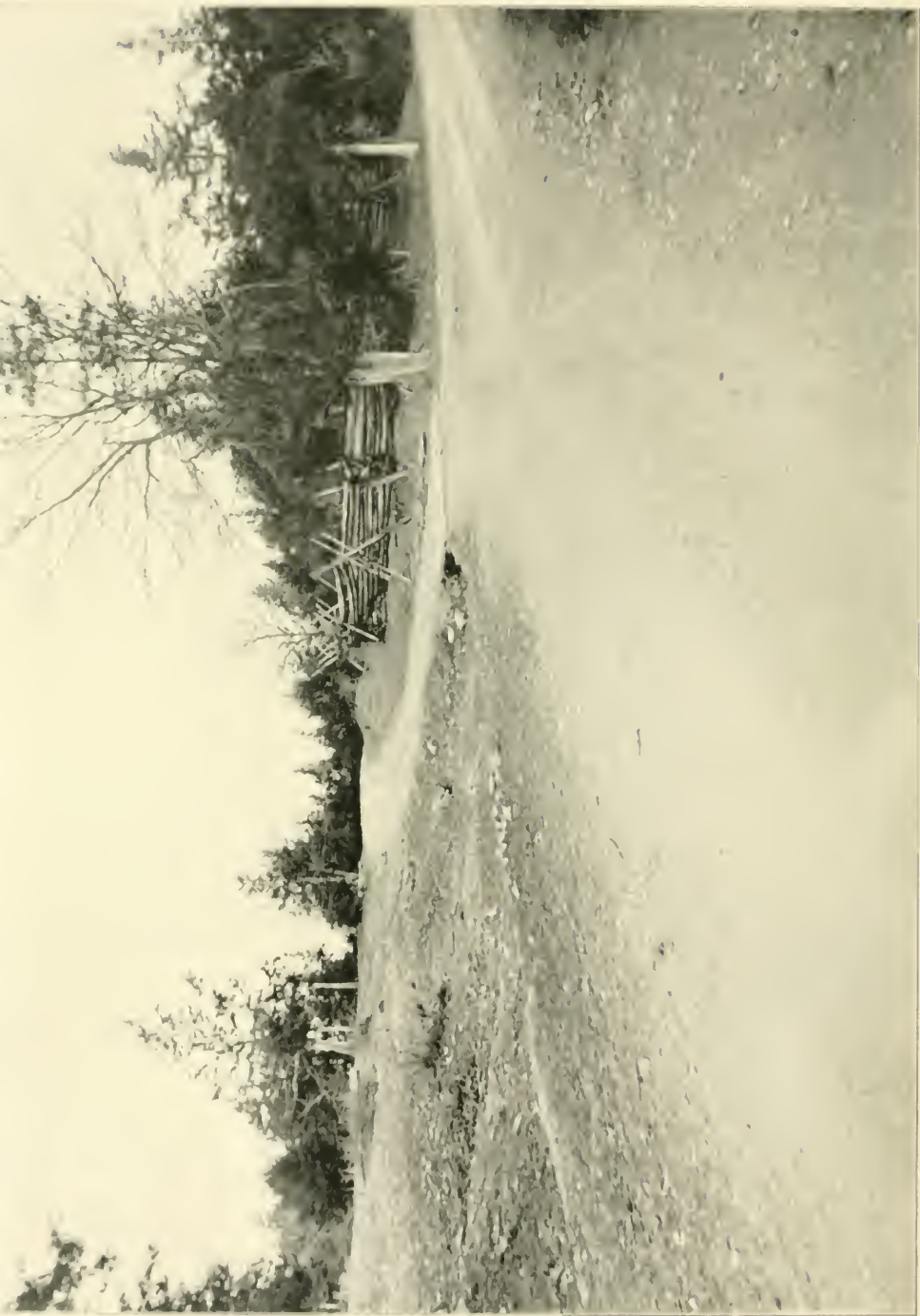
Place where the Battle of the Blue Licks began by the Indians firing upon the advance guard.