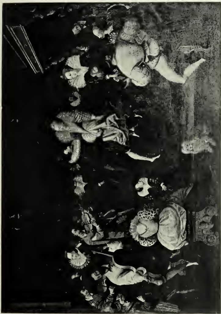
Coll. of Lord De Vise