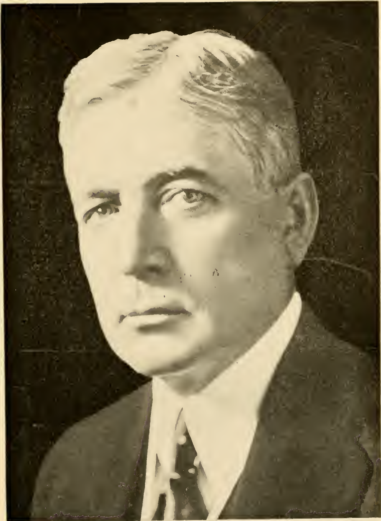
HON. FRANK O. LOWDEN The Centennial Governor of Illinois