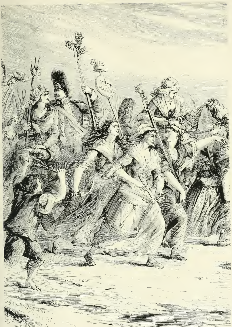
MARCH OF THE FISH WOMEN TO VERSAILLES