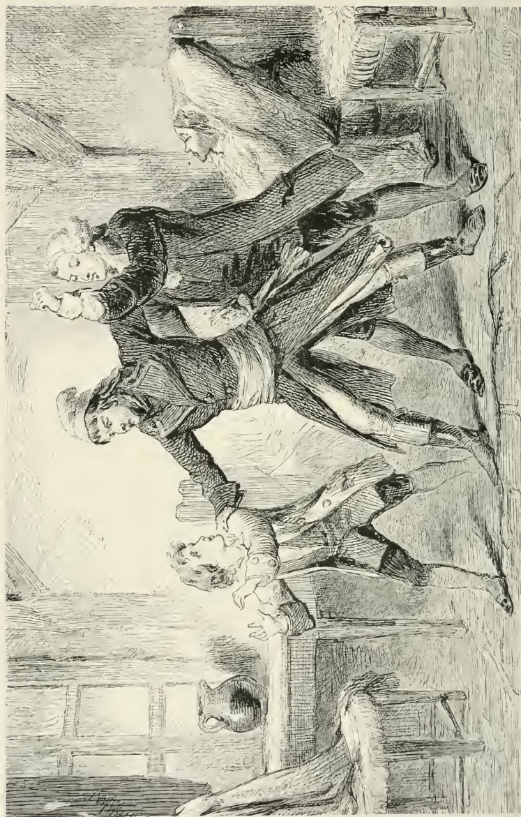
THE DAUPHIN AND SIMON THE SHOEMAKER.