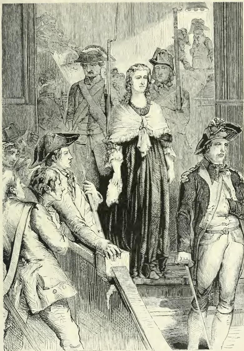
MARIE ANTOINETTE LEAVING THE TRIBUNAL.