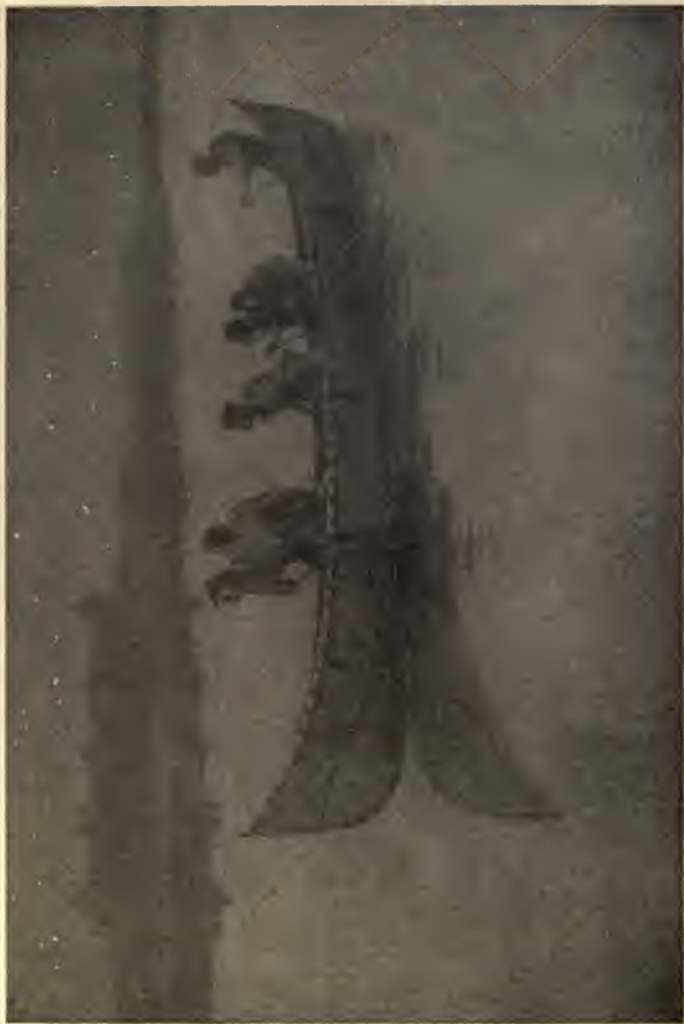
Drawn by Frederic Remington.