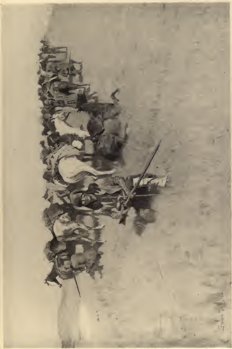
Drawn by Frederic Remington.