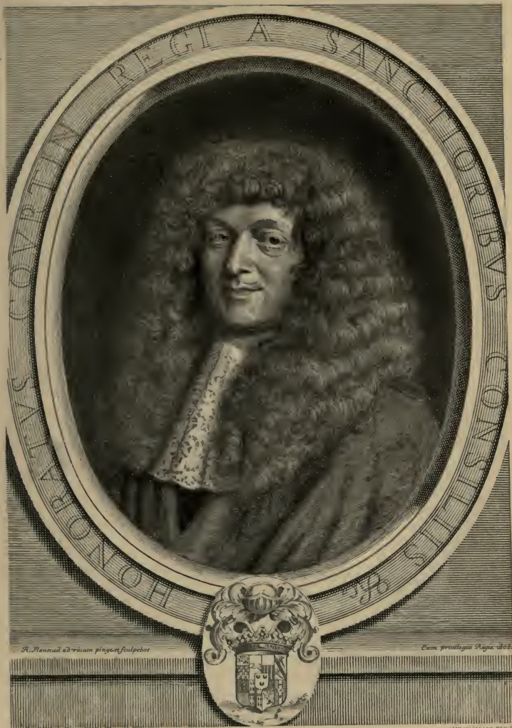
Honoré Courtin Ambassador to England, 1665 by Lantouil