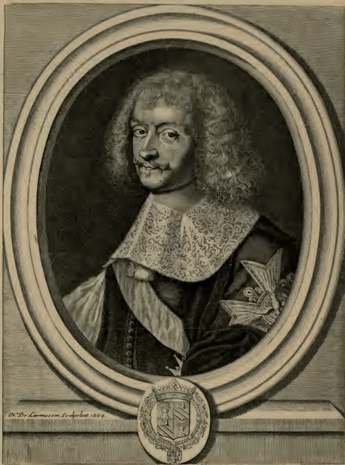
Hugues de Lionne Foreign secretary to King Louis XIV by de Larroissin