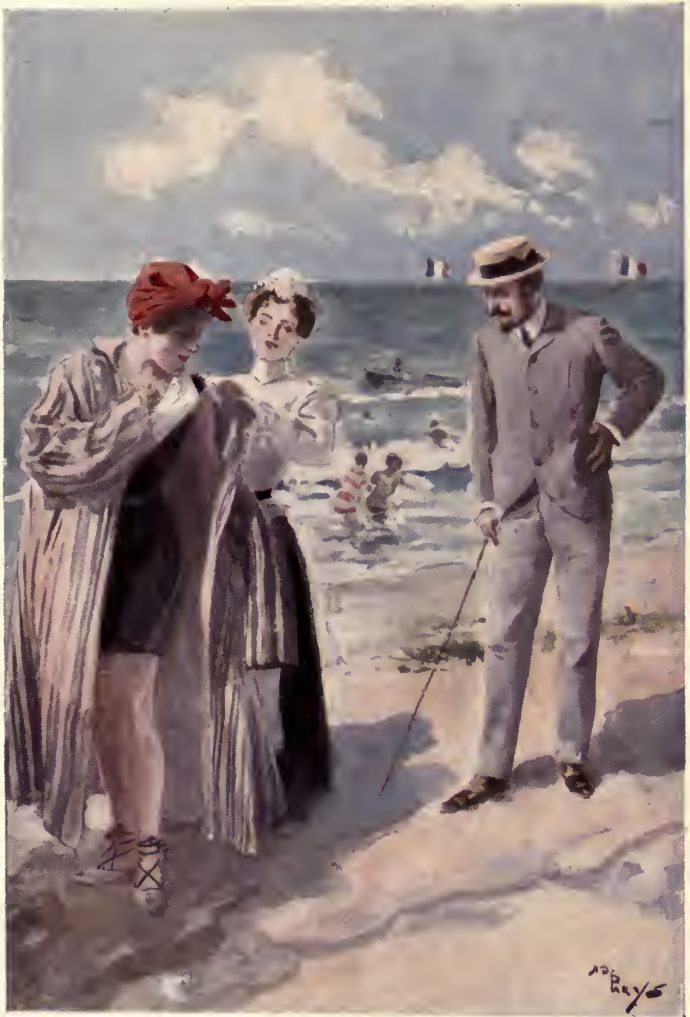
He had an eye, this Monsieur Diderot, and her contours satisfied it.