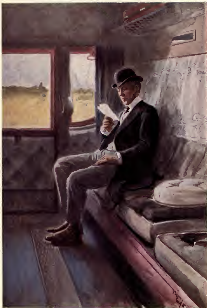
He began re-reading her letter in the train to Paris.