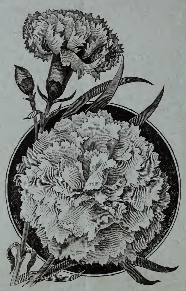
LIZZIE MCGOWAN CARNATION.