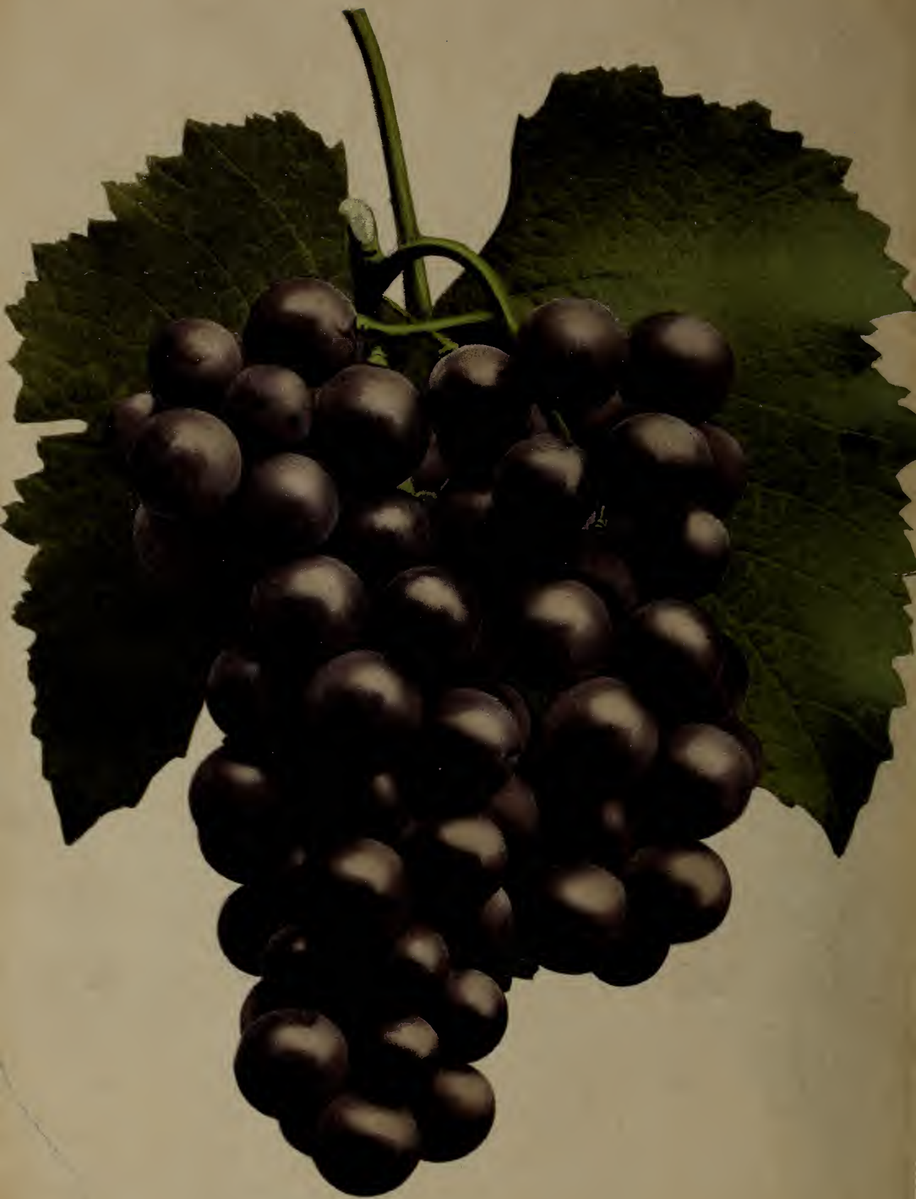
CAMPBELL'S EARLY. PHOTOGRAPHED FROM NATURE; EXACT SIZE.