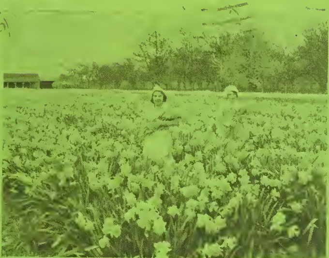
Gronen Daffodil Gardens Puyallup, Washington