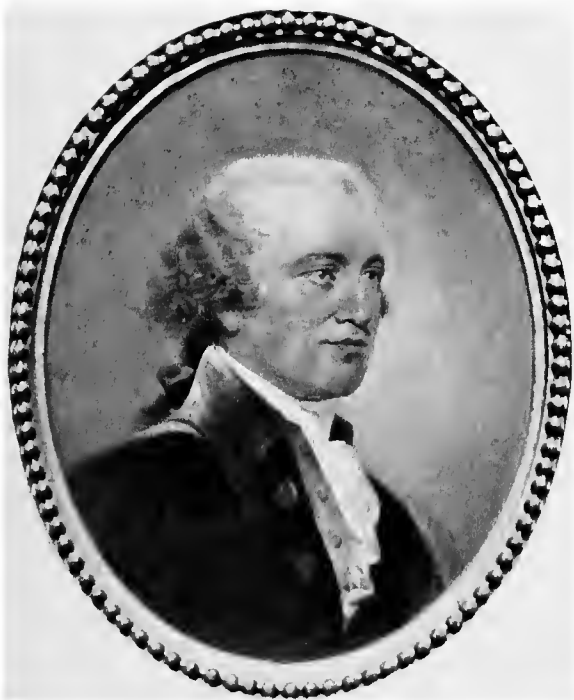
John Adams -