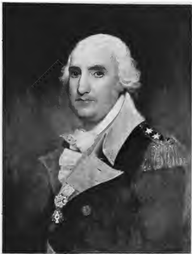
Charles Colsworth Pinckney