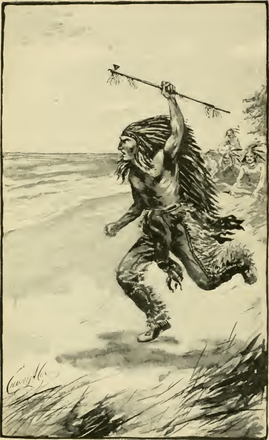
"On he sped with frenzied gestures."—Page 91. Hiawatha.