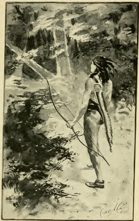
"Forth into the forest walked Hiawatha."— Page 30. Hiawatha.