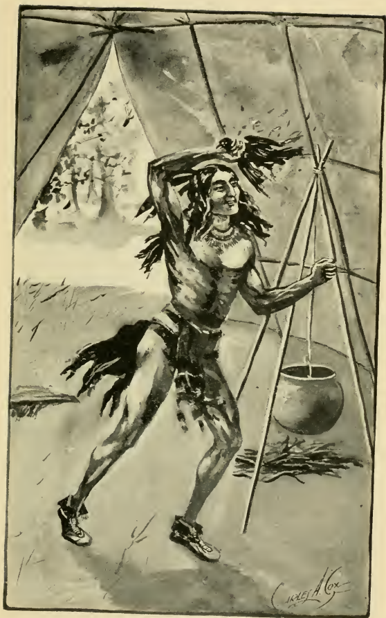
“By the neck he seized the raven.”—Page 135. Hiawatha.