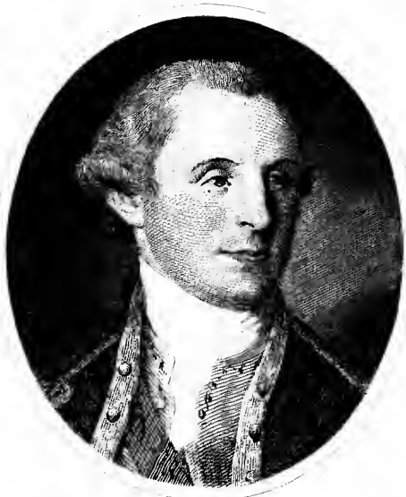
WASHINGTON AT THE AGE OF TWENTY-FIVE