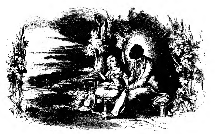
LITTLE EVA READING THE BIBLE TO UNCLE TOM IN THE ARBUR. Page 63.