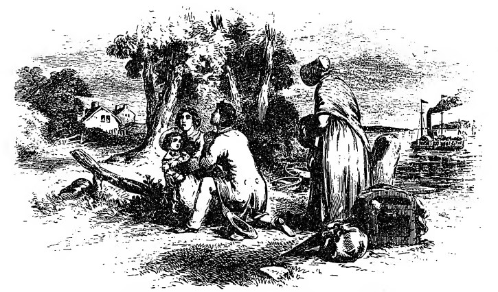
THE FUGITIVES ARE SAFE IN A FREE LAND. Page 238.