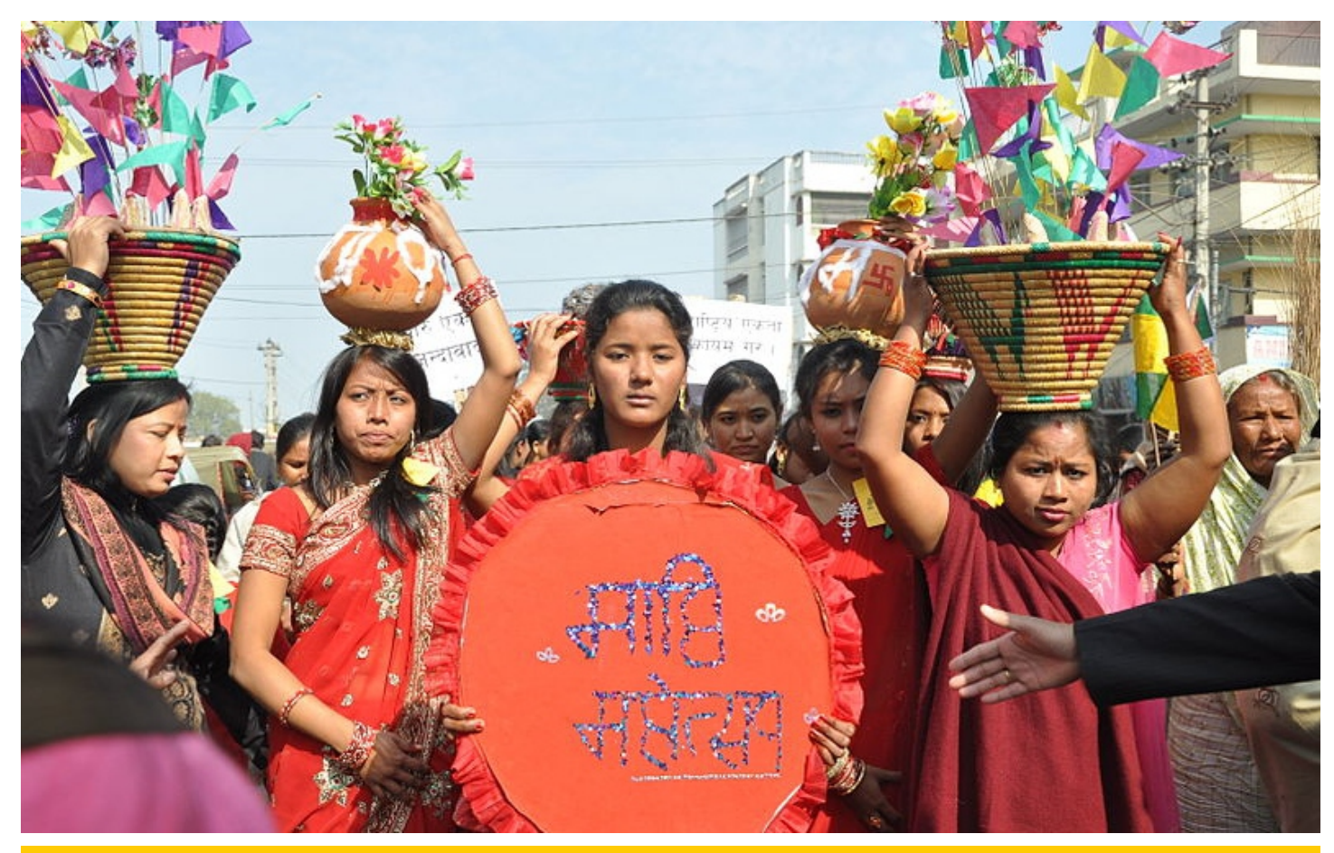
Maghi parwa by Bishal Gauro / Wikimedia Commons / CC BY-SA 3.0

"Maghe Sankranti is a Nepalese festival observed on the first of Magh in the Vikram Sambat calendar bringing an end to the winter solstice containing the month of Poush." — Wikipedia / CC BY-SA 3.0