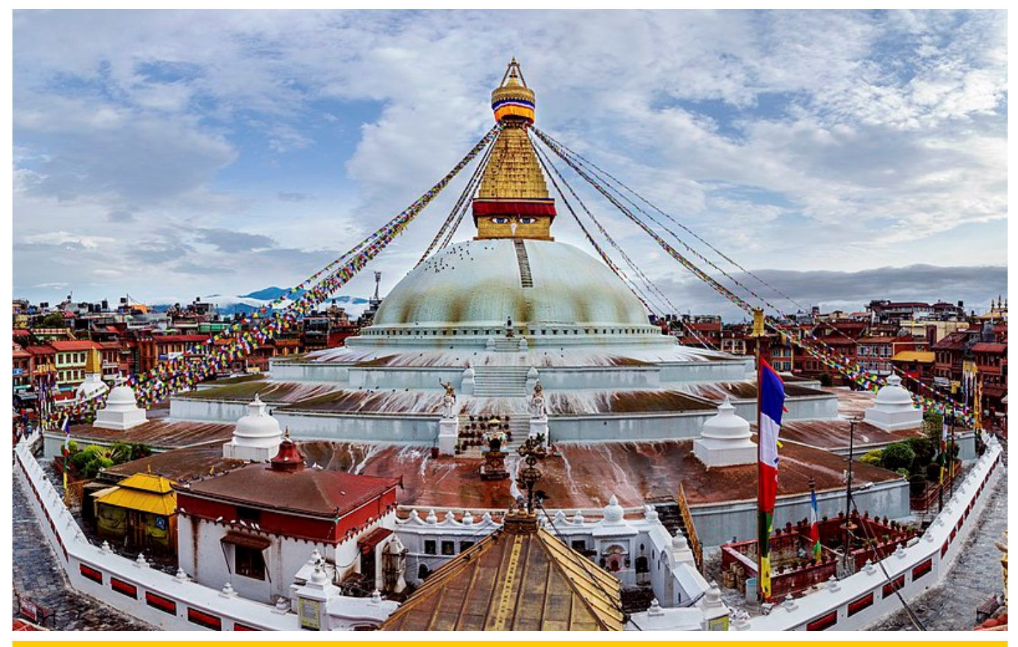
Boudhanath Stupa by Bijay Chaurasia / Wikimedia Commons / CC BY-SA 4.0

"Boudhanath is a stupa, located about 11 km from the center and northeastern outskirts of Kathmandu, its massive mandala makes it one of the largest spherical stupas in Nepal and the world." — Wikipedia / CC BY-SA 3.0