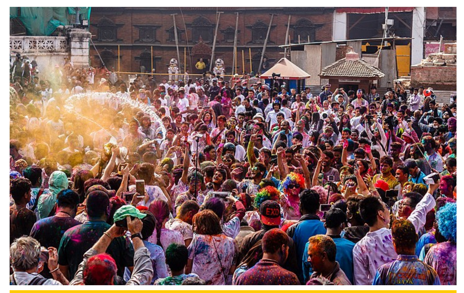
Holi at Basantapur

"Holi is the festival that celebrates the eternal and divine love of Radha and Krishna." — Wikipedia / CC BY-SA 3.0 \,