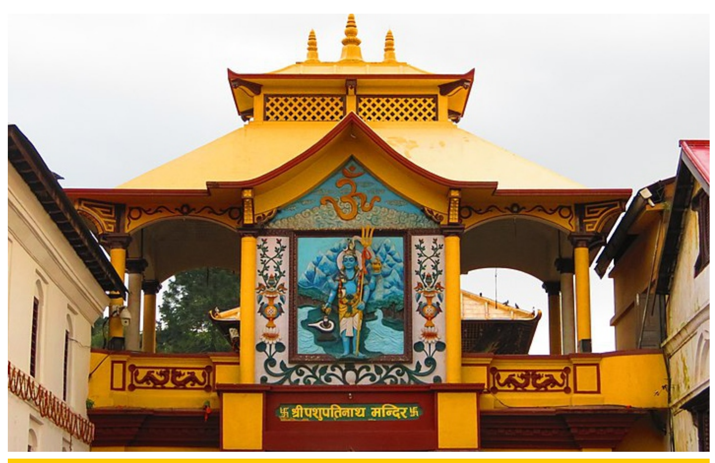
Pashupatinath Temple

"Pashupatinath is a famous and sacred Hindu temple complex that is located on the banks of the Bagmati River, approximately 5 km north-east of Kathmandu." — Wikipedia / CC BY-SA 3.0