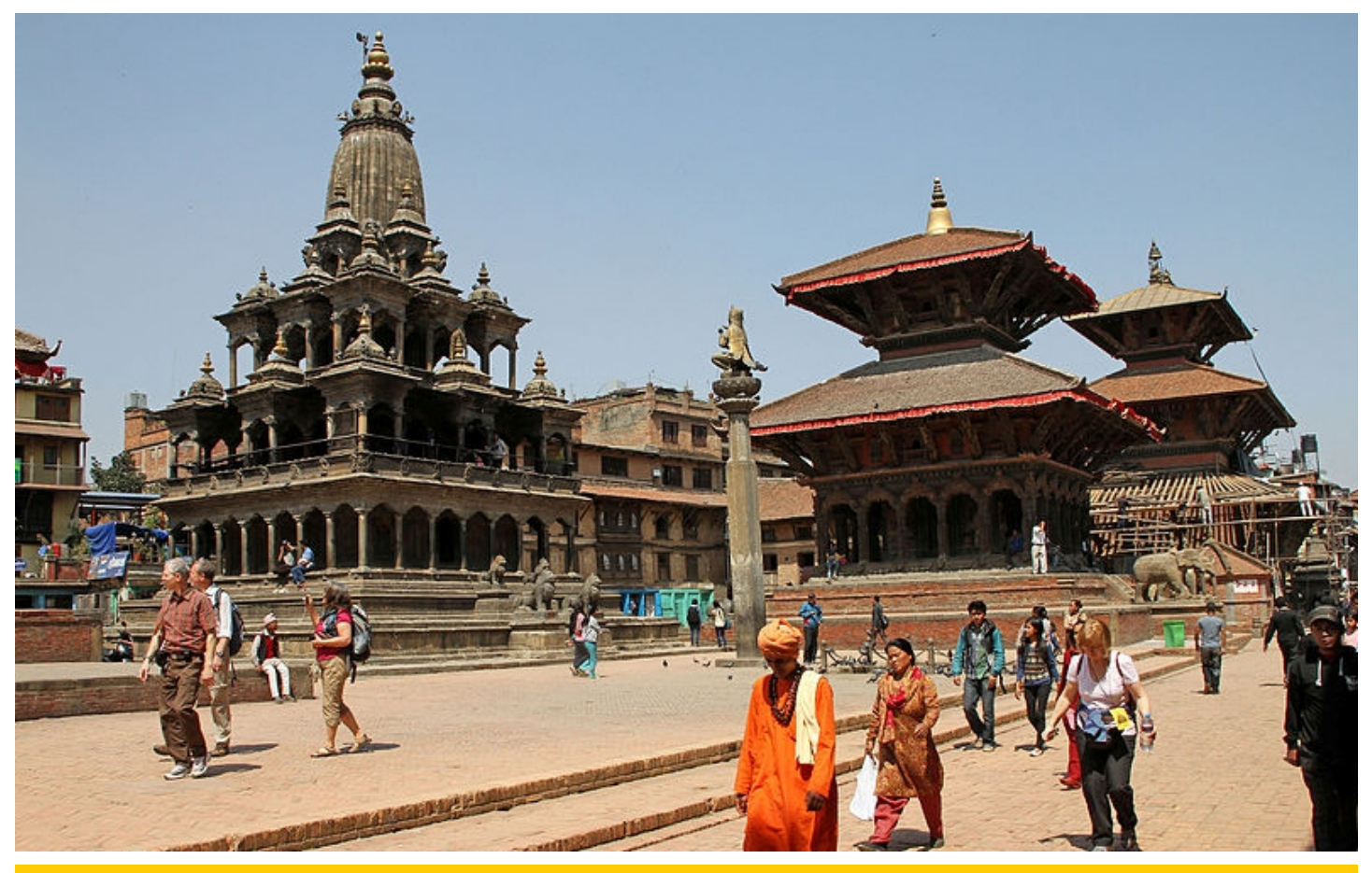
Krishna Mandir, Patan

"Krishna Mandir is a 17th-century Shikhara-style temple, located in the Patan Durbar Square is a UNESCO World Heritage Site". - Wikipedia / CC BY-SA 3.0