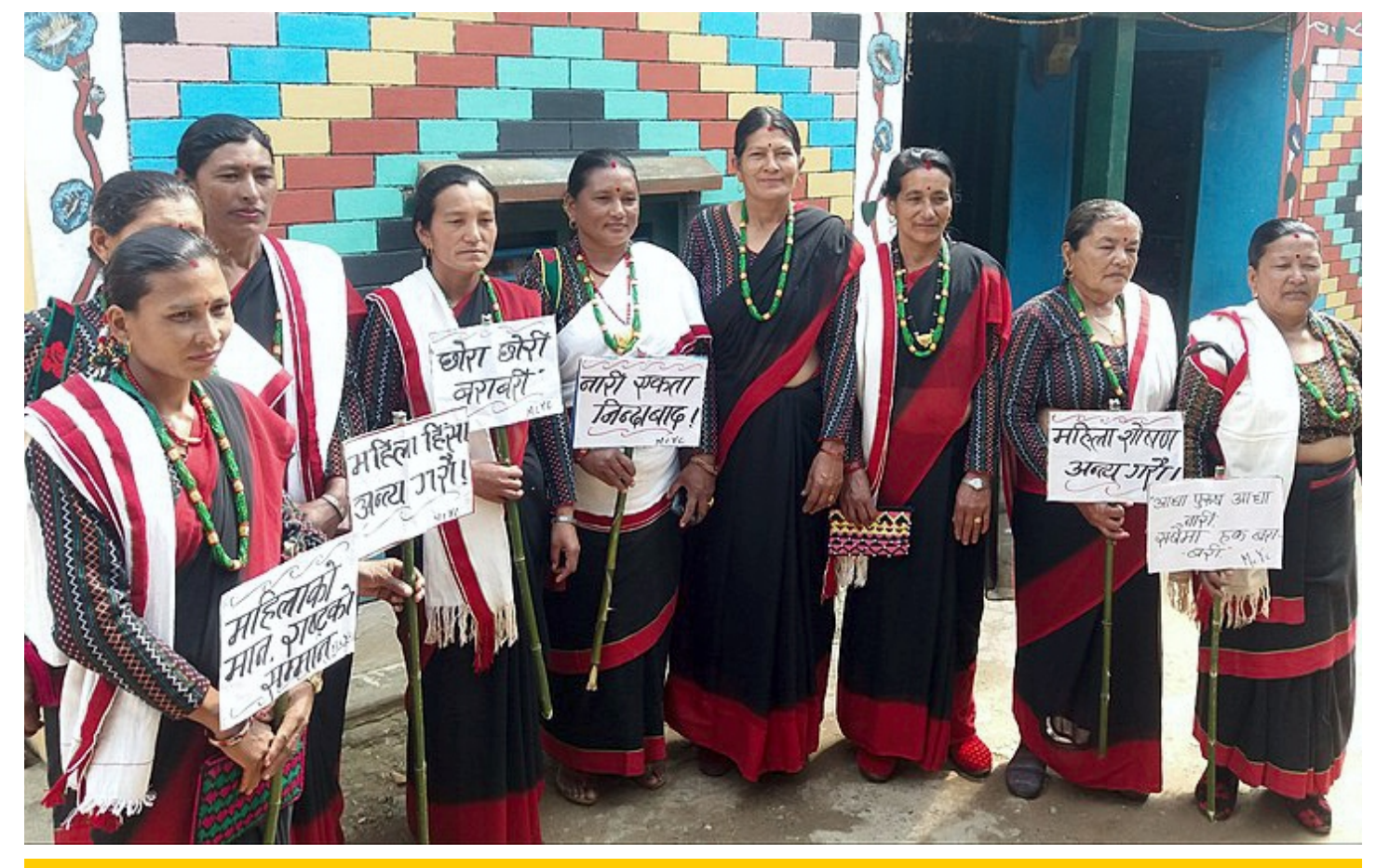
International Women Day

"International Women's Day is a global holiday celebrated annually on March 8 to commemorate the cultural, political, and socioeconomic achievements of women." — Wikipedia / CC BY-SA 3.0