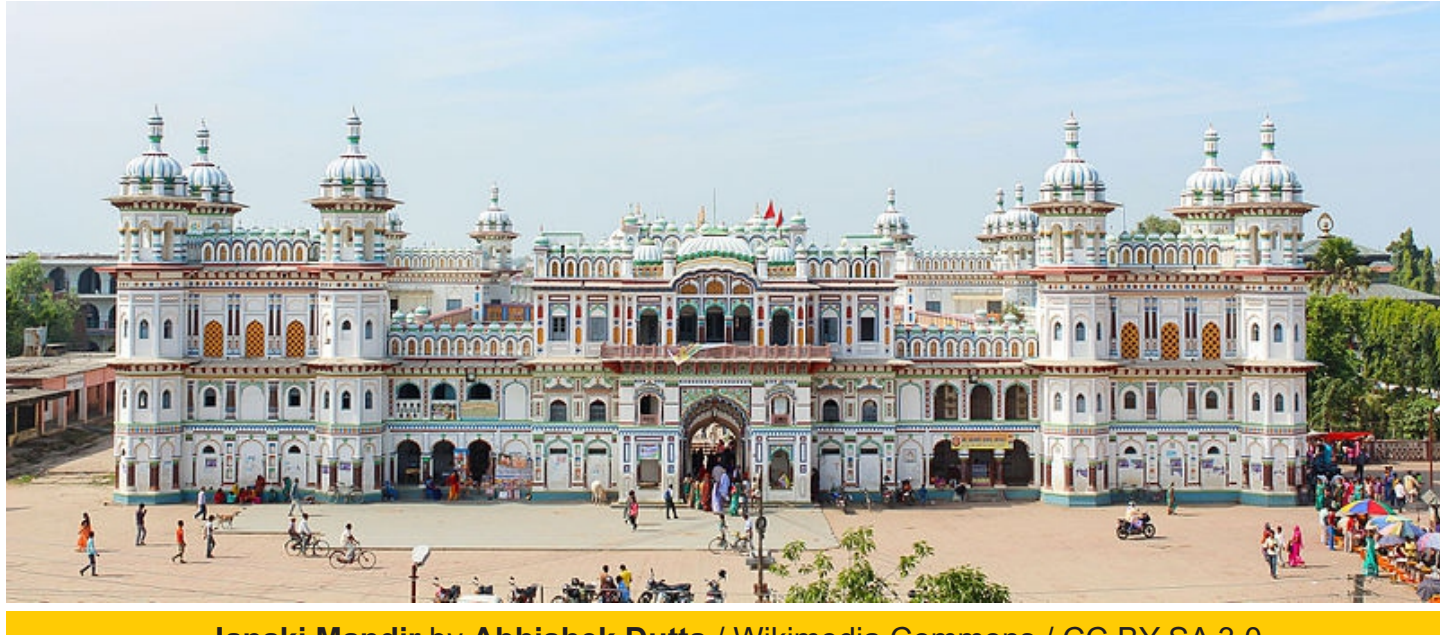
Janaki Mandir

Maithili Wikipedia Link: mai.wikipedia.org I Nepali Wikipedia Link: ne.wikipedia.org Facebook Link: www.facebook.com/wacnofficial