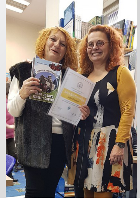
By Milica Buha, under a license CC BY-SA 4.0