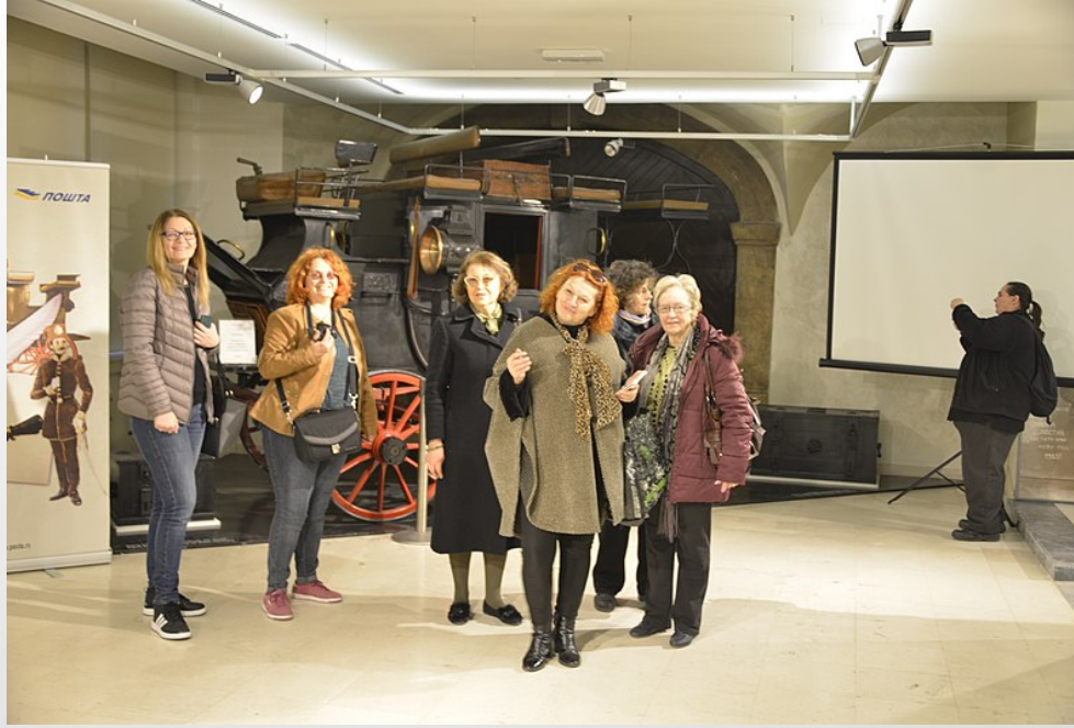
By Mimir Magdevski, under a license CC BY-SA 4.0