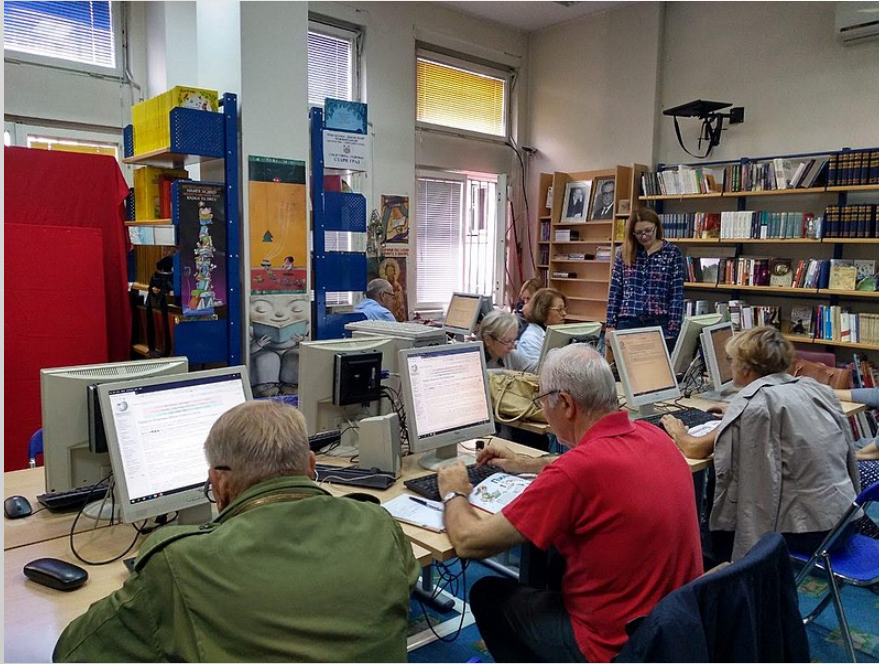
By Andrijana Jelovac, under a license CC BY-SA 4.0