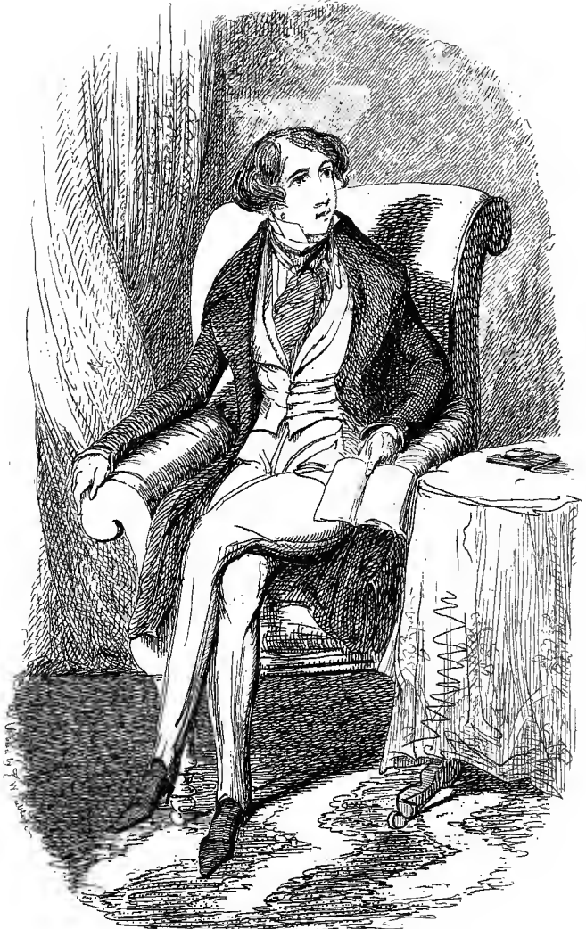
Charles Dickens -