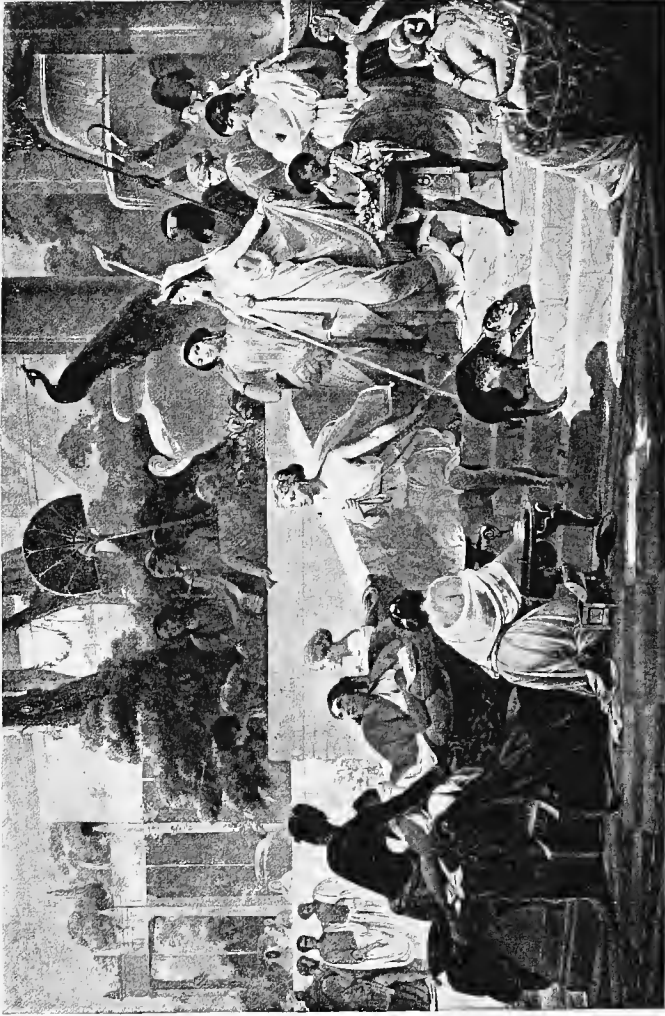
CLEOPATRA AWAITING THE COMING OF ANTHONY Egypt, Frontispiece.