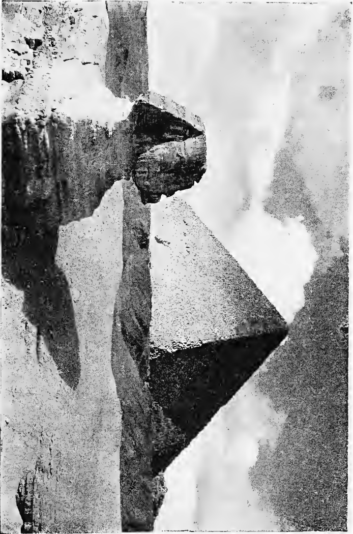
THE SPHINX AND PYRAMID