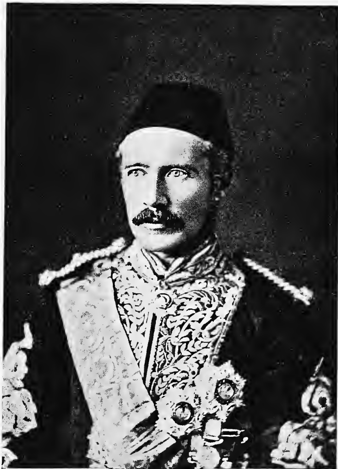
GENERAL CHARLES GEORGE GORDON