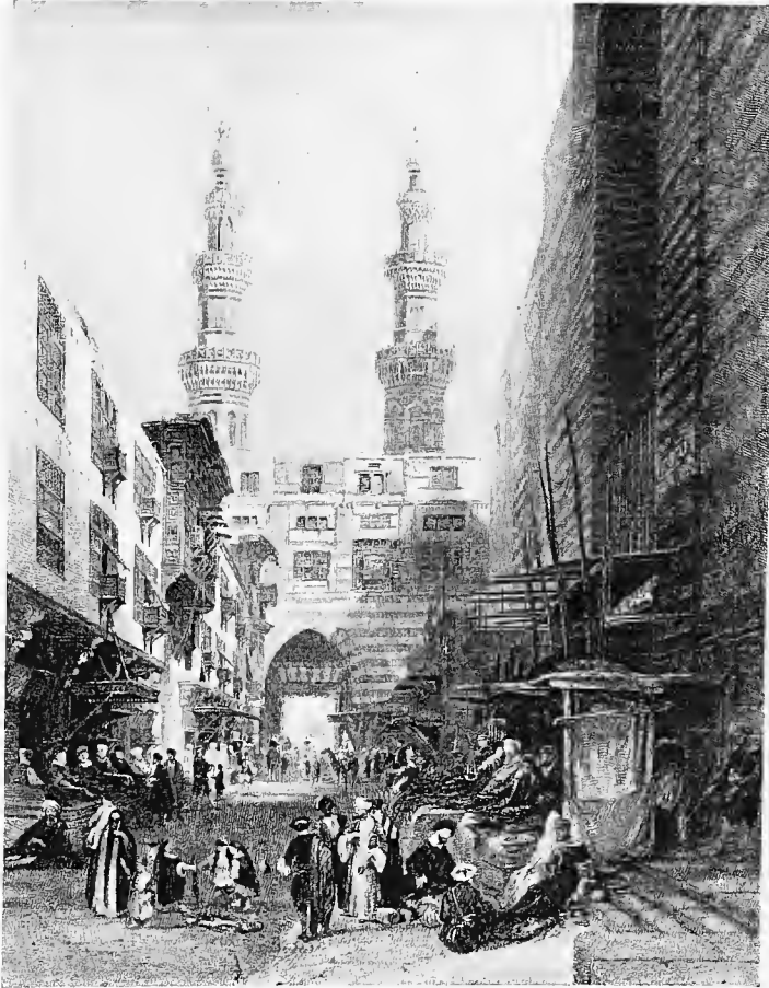
CAIRO.—GATE OF THE METWALEYS