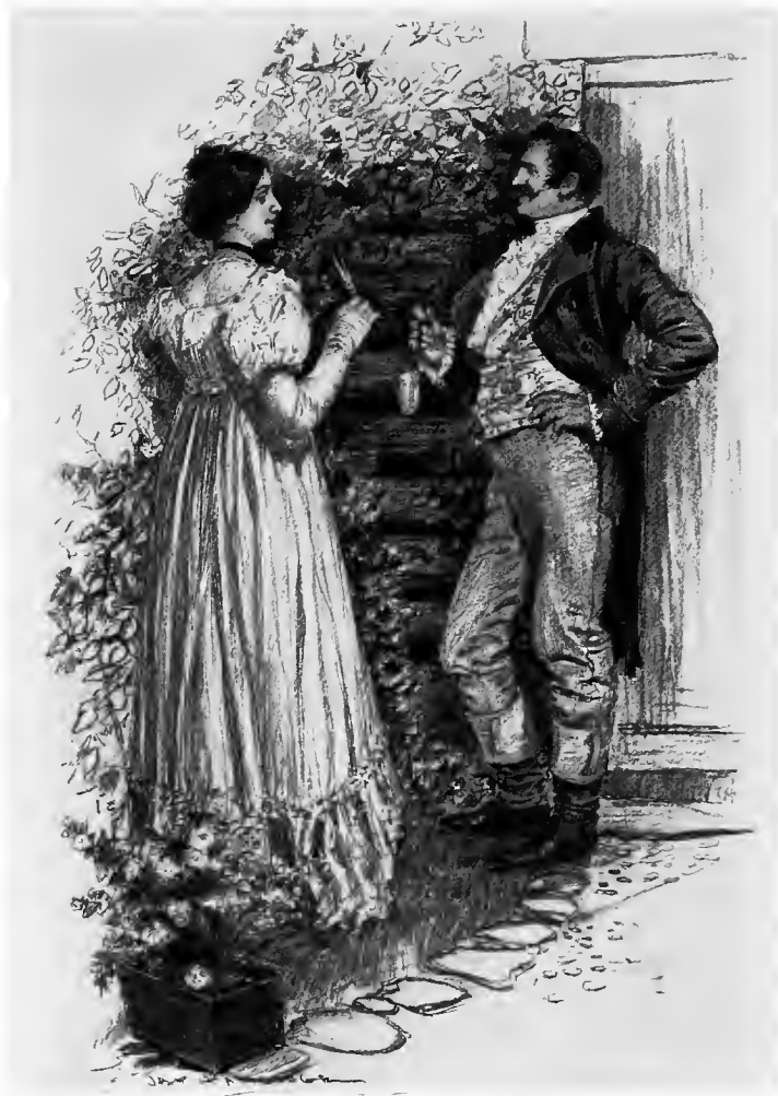
“CHATTING GAILY, SHE TRIMMED THE CLIMBING ROSES.”