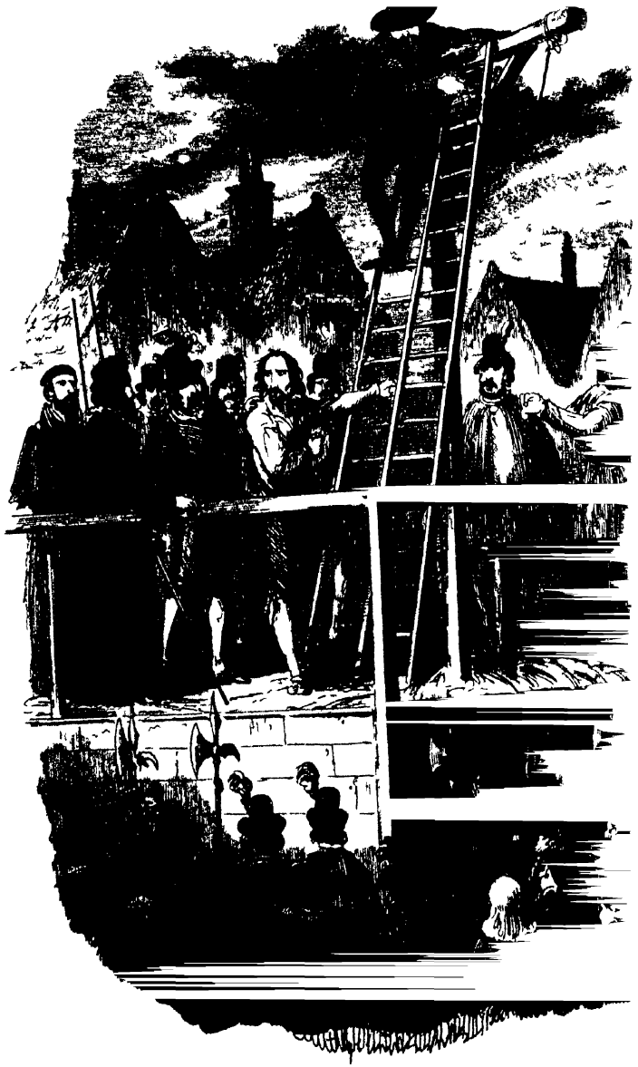
Execution of Guy Fawkes