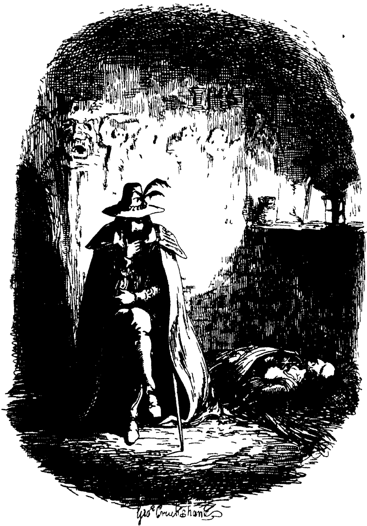
Guy Fawkes in Drisill Cave