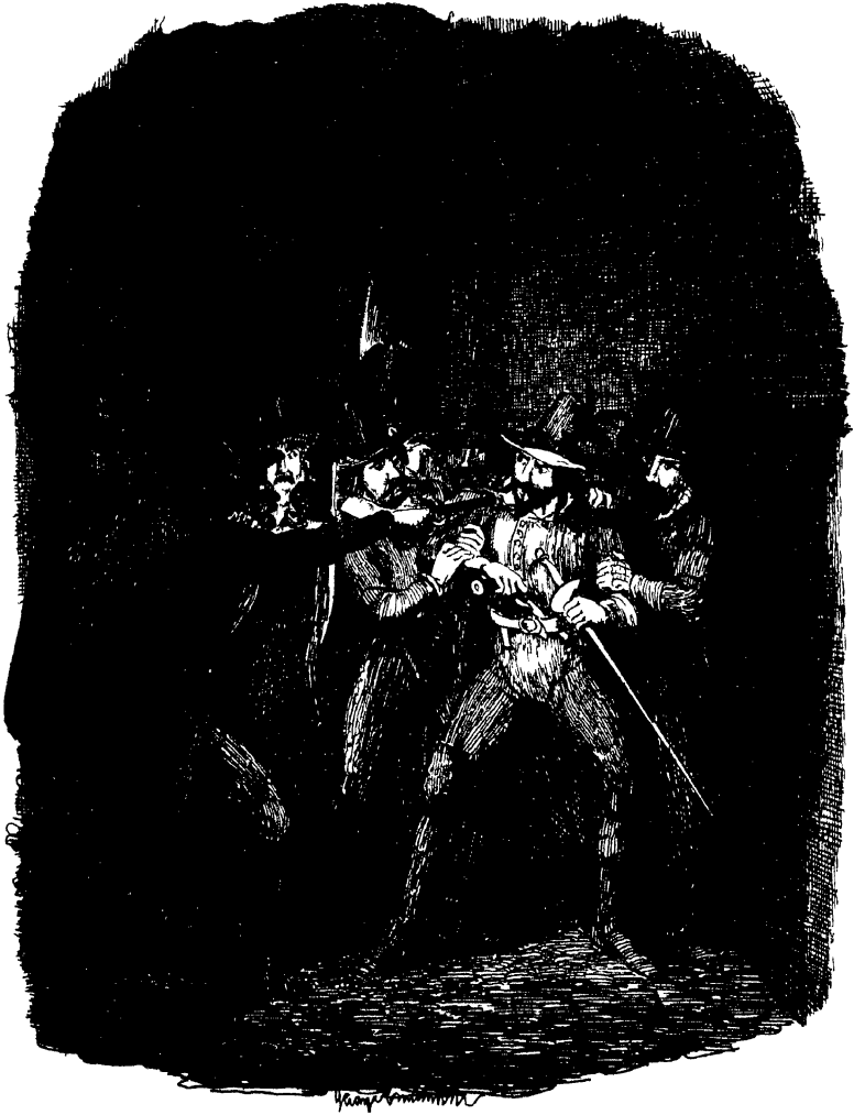
Fig. 1. "Other as called by" 2000 "the 1st 2000"