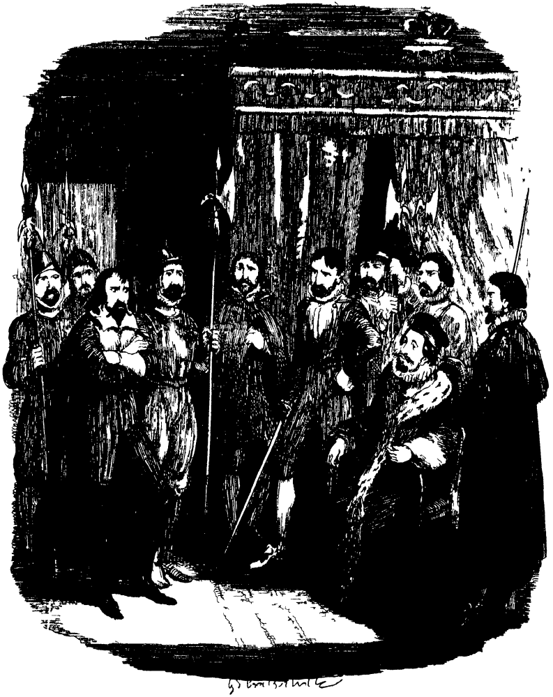
Guy 'nukes' interrupted 'y' day 'nukes